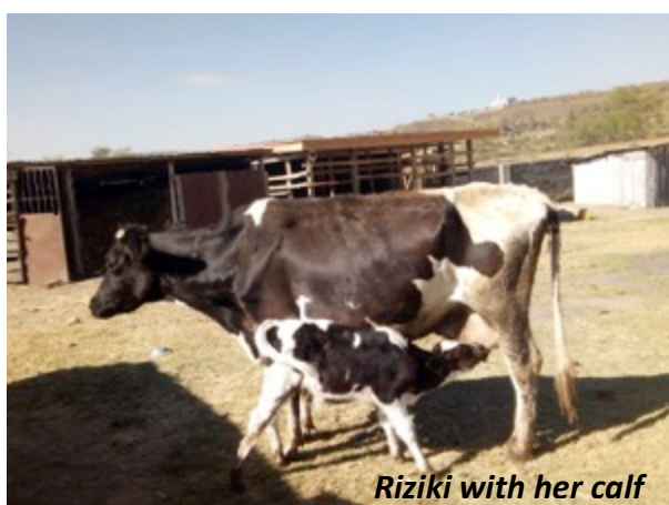
Riziki with her calf