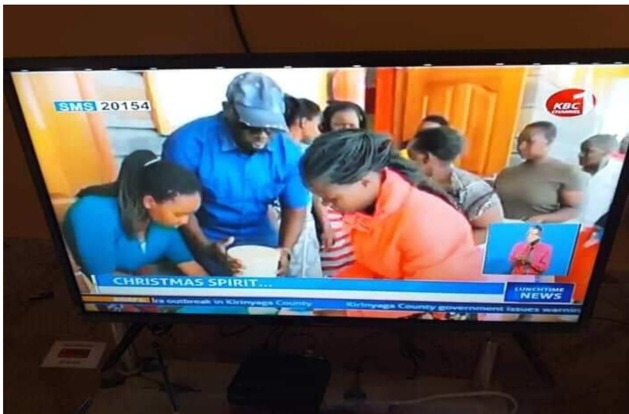
Christmas presents event was aired on a National Television (KBC)