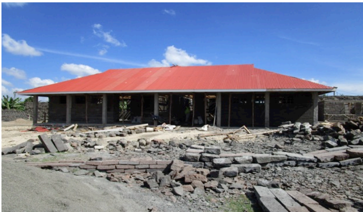
Kindergarten by the end of 2019

In mid-December, we started the construction of an administration block with a library and a clinic. A donor from the USA has donated $70,000 to construct the building.