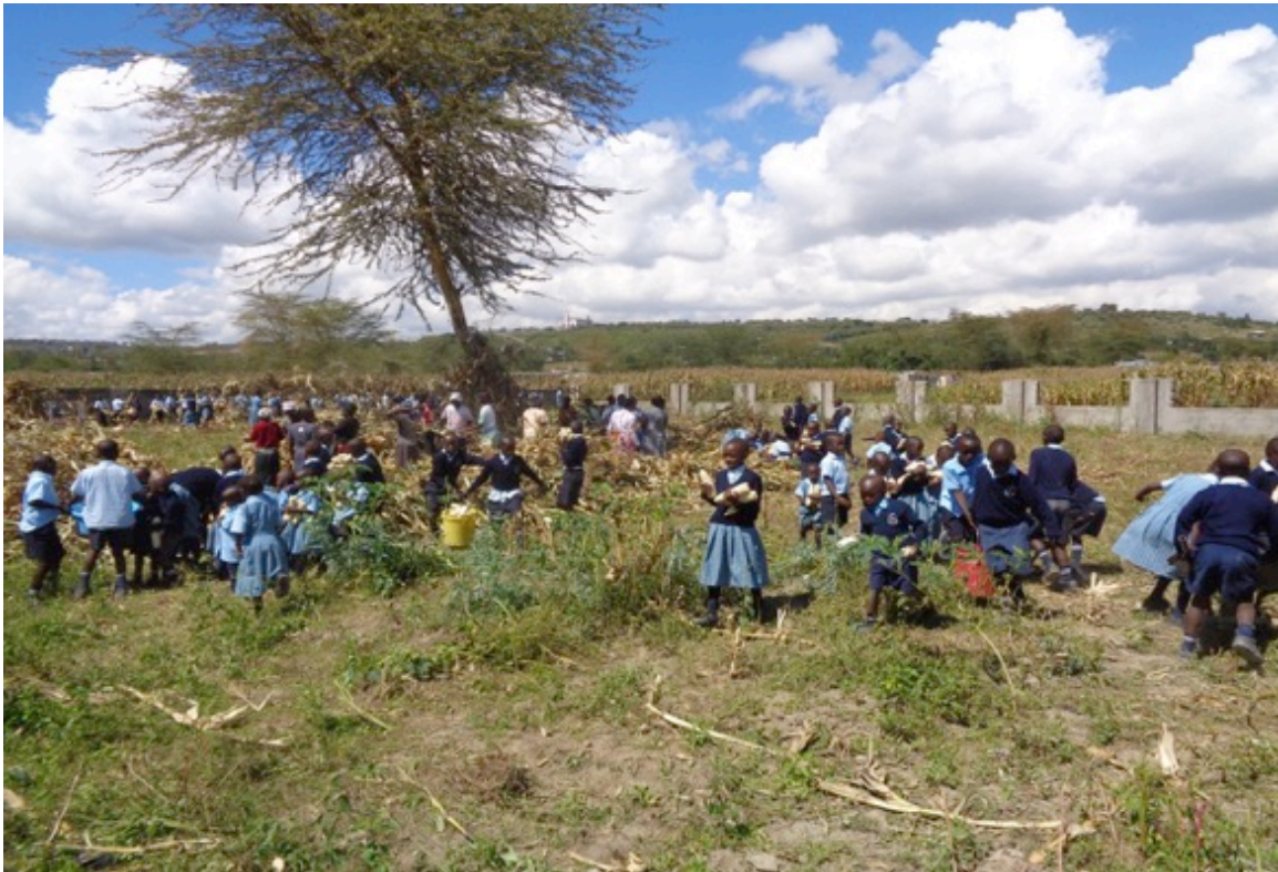
Children, parents and staff harvesting maize on our school field