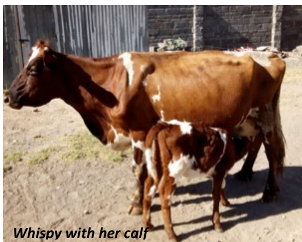
Whispy with her calf

We had enough milk for our children from January to October when milk reduced because all the 3 cows are pregnant again. They used to drink milk 3 days in a week instead of the former twice a week. This has helped to keep our children healthy, and at the same time we saved money we had used to buy milk.