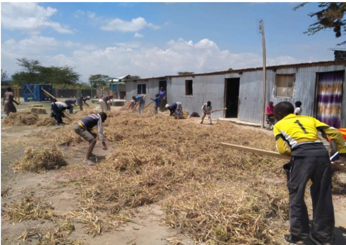
Children helping parents to shell beans