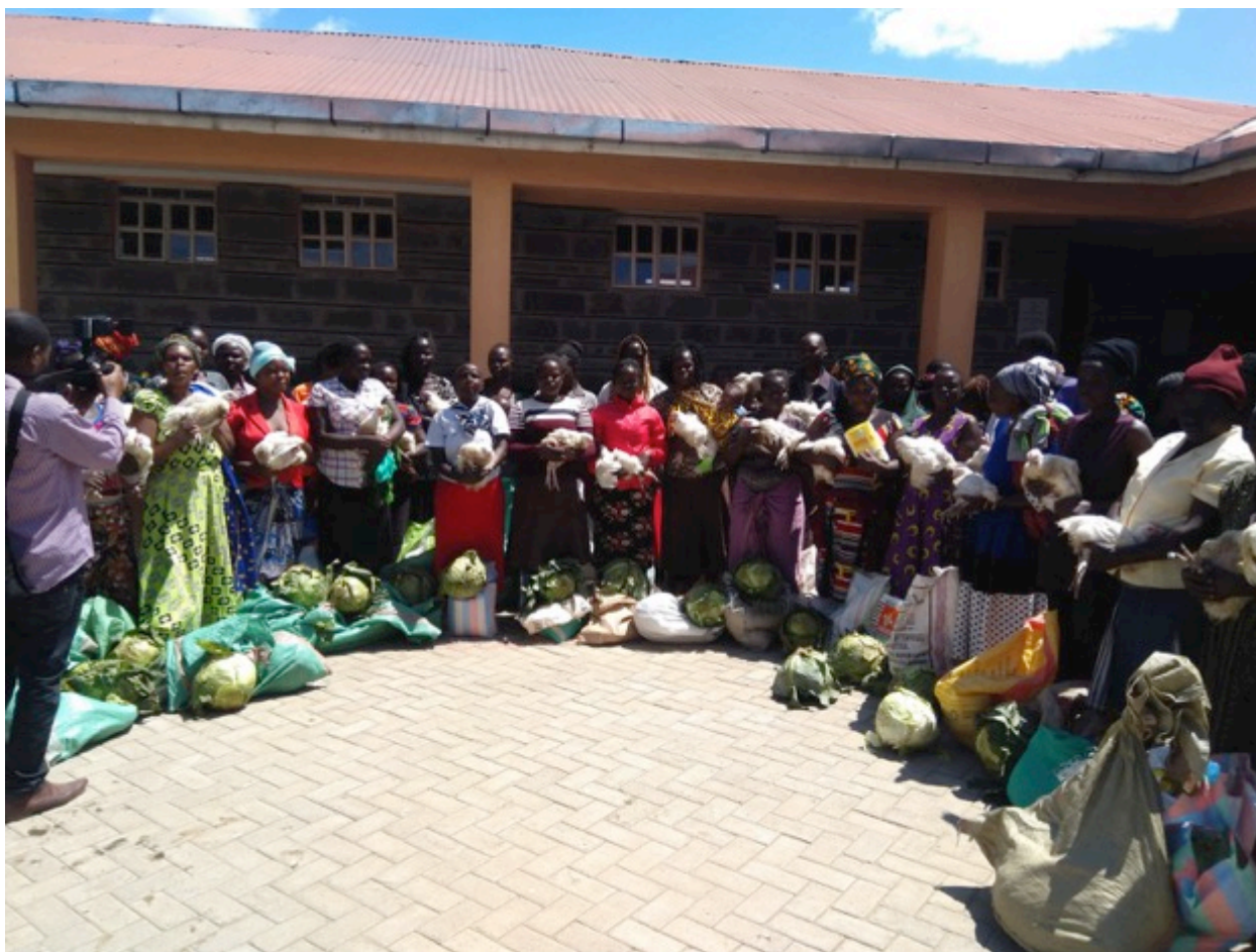
Parents with their Christmas presents