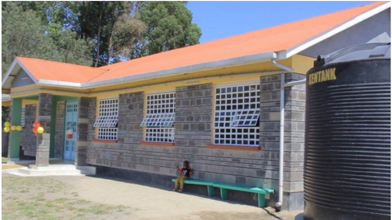
Front view of our multi-purpose hall

Mid last year we started the construction of our dining/multi-purpose hall. Due to limited funds, it took us a long time to complete. But the quality of work done was very high as it can be seen in the photos below.