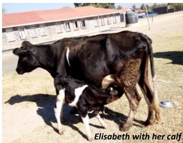
Elisabeth with her calf