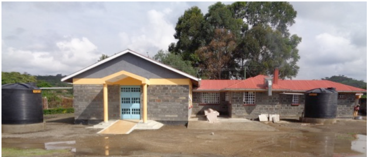
The complete dining hall, kitchen and water tanks for rain harvesting