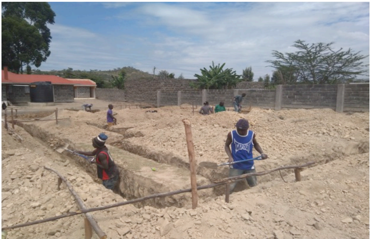
Construction in progress