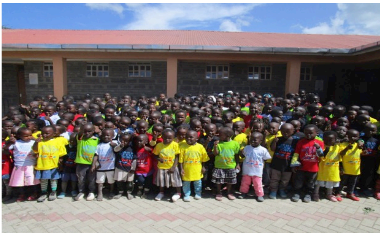
Happy children in their t-shirts