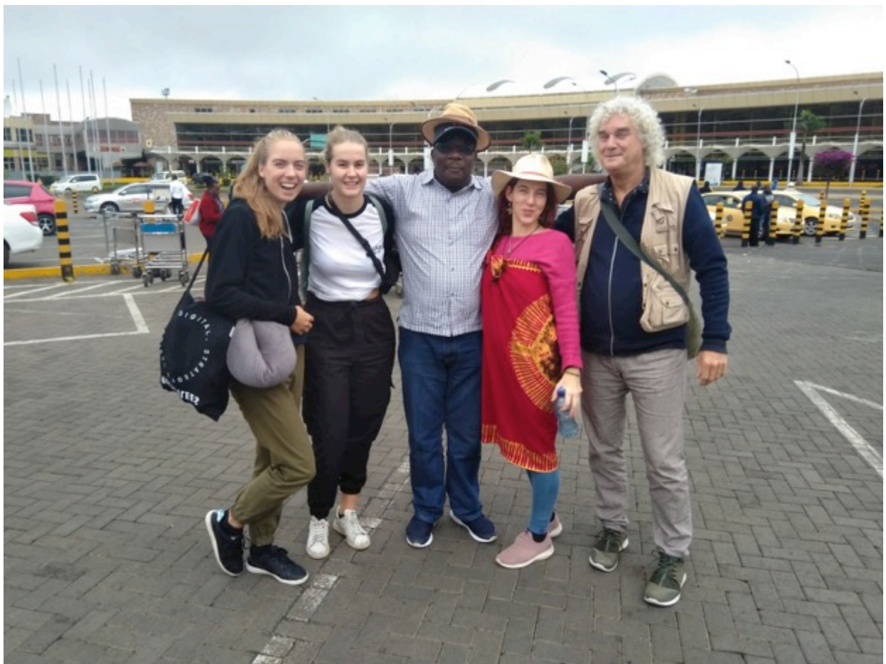
The Dutch guests at the Jomo Kenyatta International Airport

On October 25 th , we received 19 visitors from Germany, the USA and the Netherlands. Four came from Netherlands while 15 travelled from Germany. They all stayed for 10 days. While in Kenya they were involved in a number of activities. They visited sponsored children's families, repaired and made playground items for our children, visited micro-credit activities and especially important for the children: played, sang, danced and did handicrafts with them. This is an important and memorable time for all involved