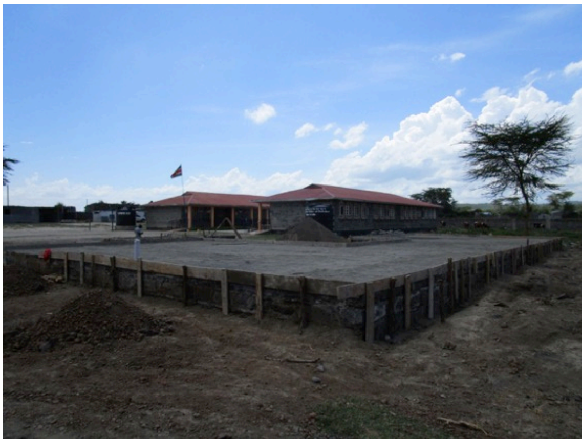
Administration, Library and Clinic block under construction – January 2020