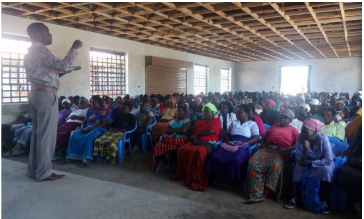
Photos above show the workshop in progress