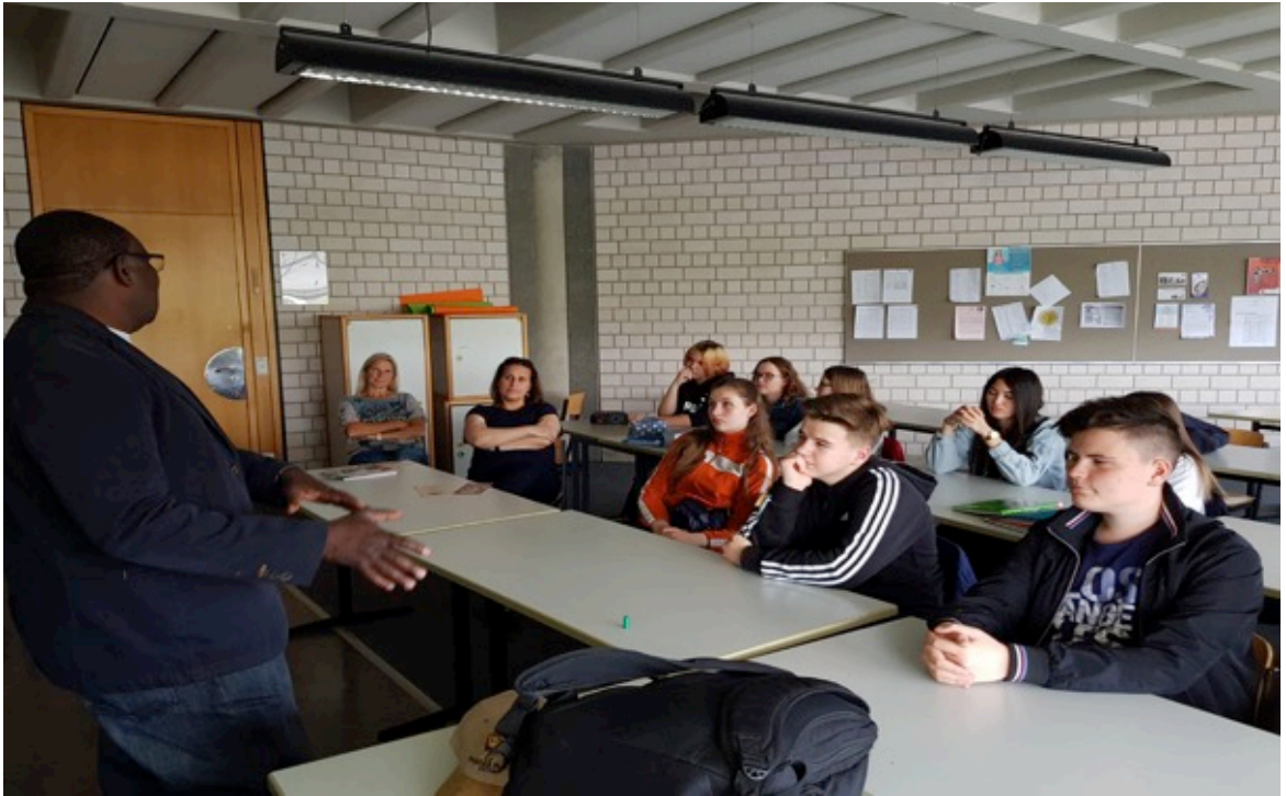
Talking to students and teachers at the Stein Gymnasium