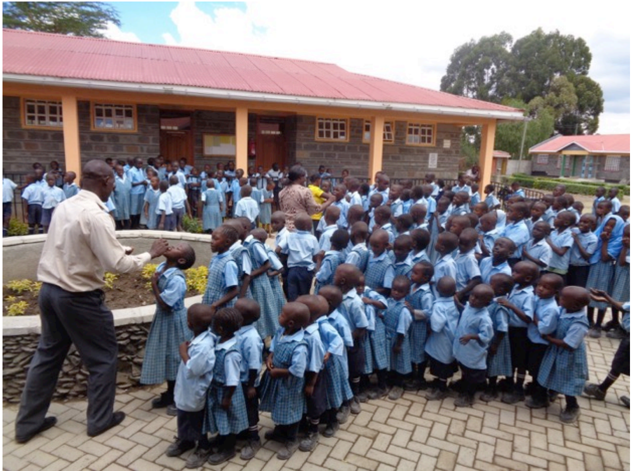
Teachers helping a public health officer to administer anti-worm and multi-vitamins tablets

At the end of May, we invited a local Health Officer to come and do a medical checkup for all of our children. A number of health cases were noted. Most cases were referred to the health centre and other referral hospitals around Nakuru. Children received anti-worm medication and multi-vitamins. These checkups are done on a routine basis. This has kept our children healthier.