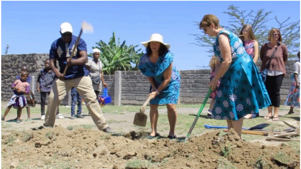
Ground breaking of Kindergarten construction