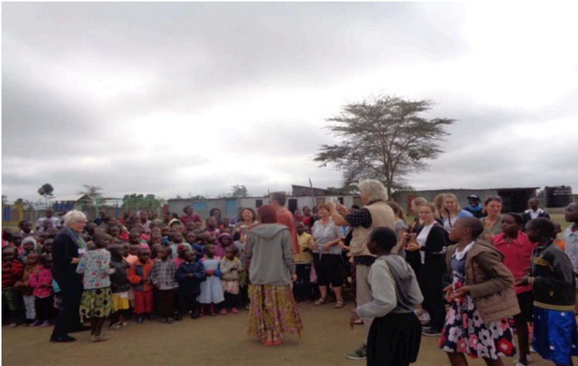
Children and staff welcoming visitors at the LLK Center