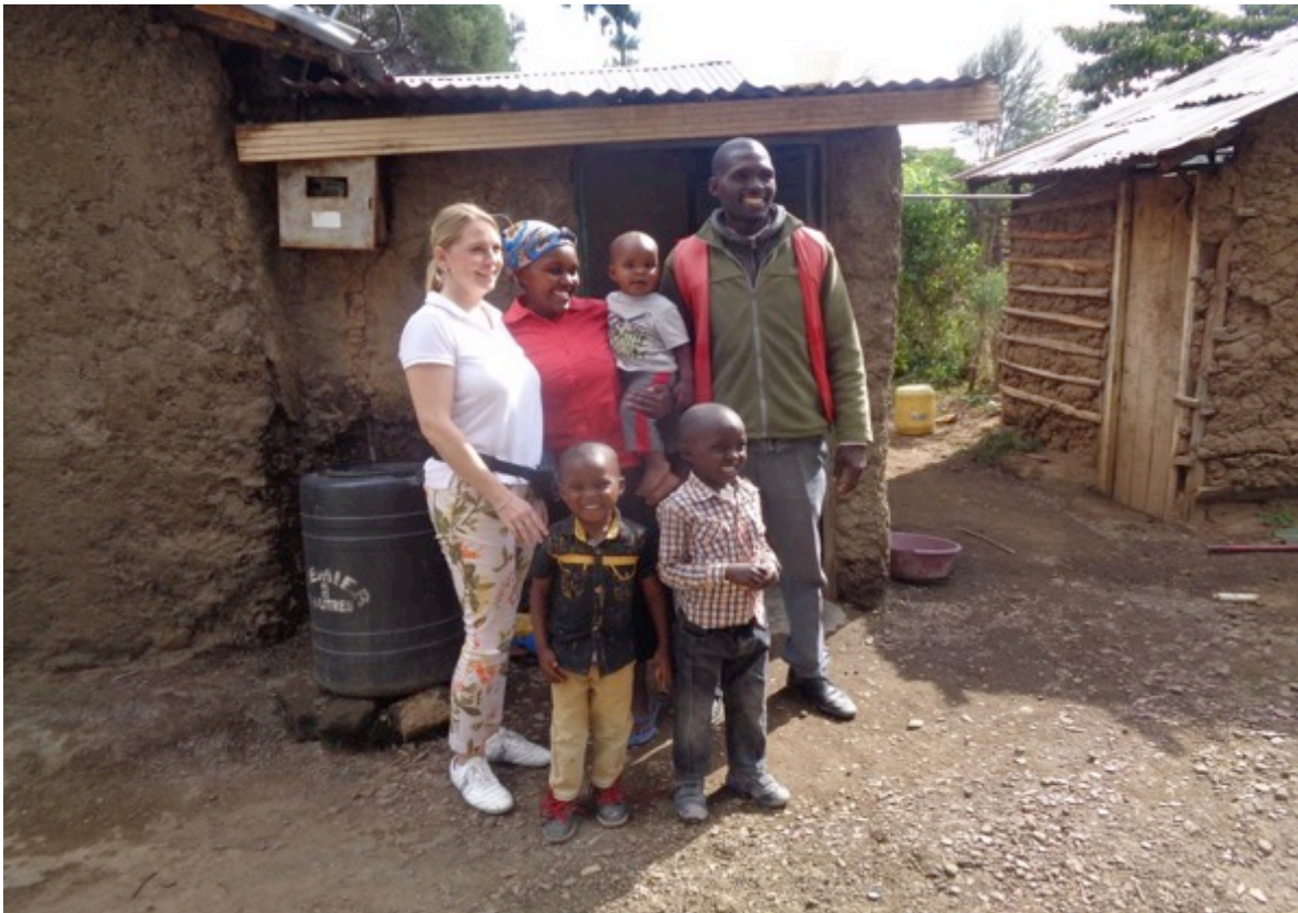
Most of the visitors were sponsors to our project children. They visited their home to see their living conditions as seen in the above photo.