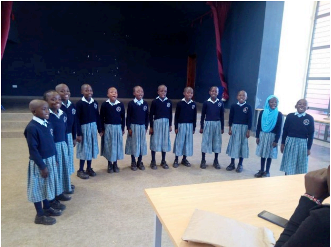
Our children on stage at the county level

Extra-curricular activities are part of the education syllabus in Kenya. It helps to identify children's talents and in developing them. Our children performed very well in academic and extra-curricular activities. This year our children performed very well in poems and Mashairi. They reached the regional level. These children have promoted our school in our region. Everyone is asking where Live and Learn in Kenya Education Center is. It has also shown people that talents can also be found in the slums.