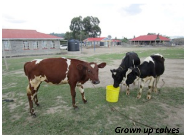
Grown up calves