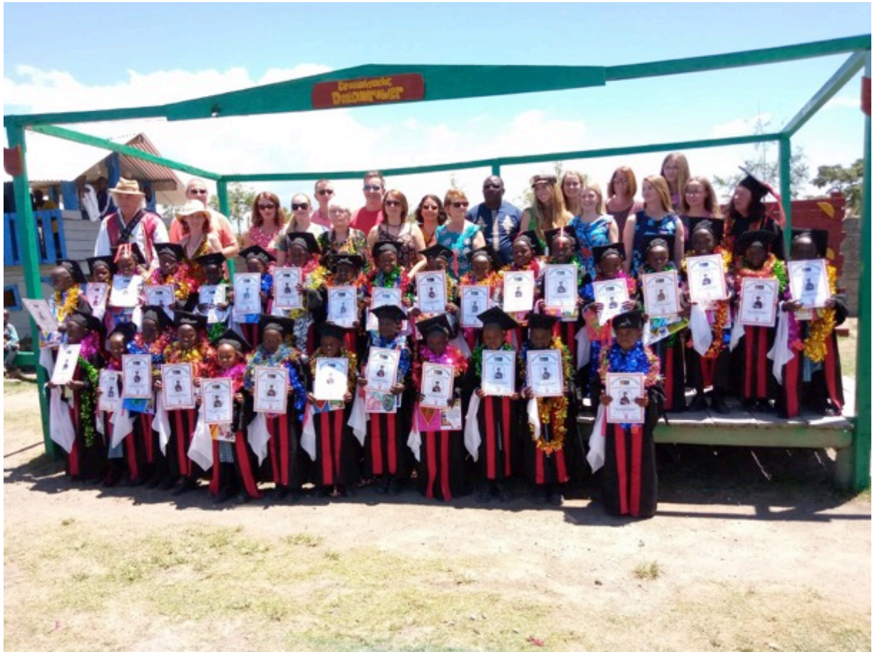
Pre-school children with their certificates. They will be joining grade 1 in 2020

The guests left for Nairobi the following day - on November 3 rd to their respective countries after a very successful trip. Parents, children and LLK staff were very grateful for the visitor's generosity.