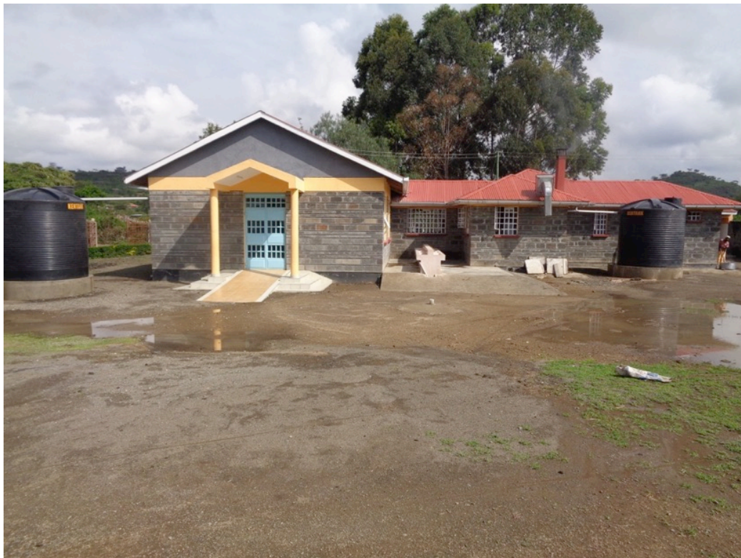
Our completed dining/multi-purpose hall, kitchen and water tanks for rain harvesting

Eric, our contractor, completed the wall fence around our school in early May. This has provided for safety and security at our school. Neighbor's animals can no longer access our school and destroy our crops and other vegetation. We are very grateful to Ericom for the offer of constructing a wall around our school for just the price of the materials used. The only thing remaining to keep our Center safe is a larger and more solid gate and the metal grating in the front wall.