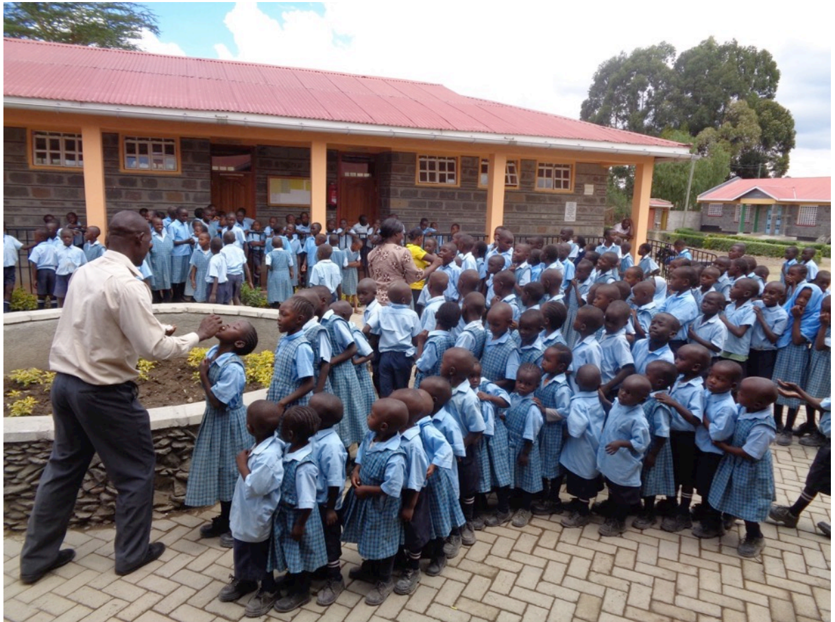
Teachers helping a public health officer to administer de-worming and multi- vitamin tablets