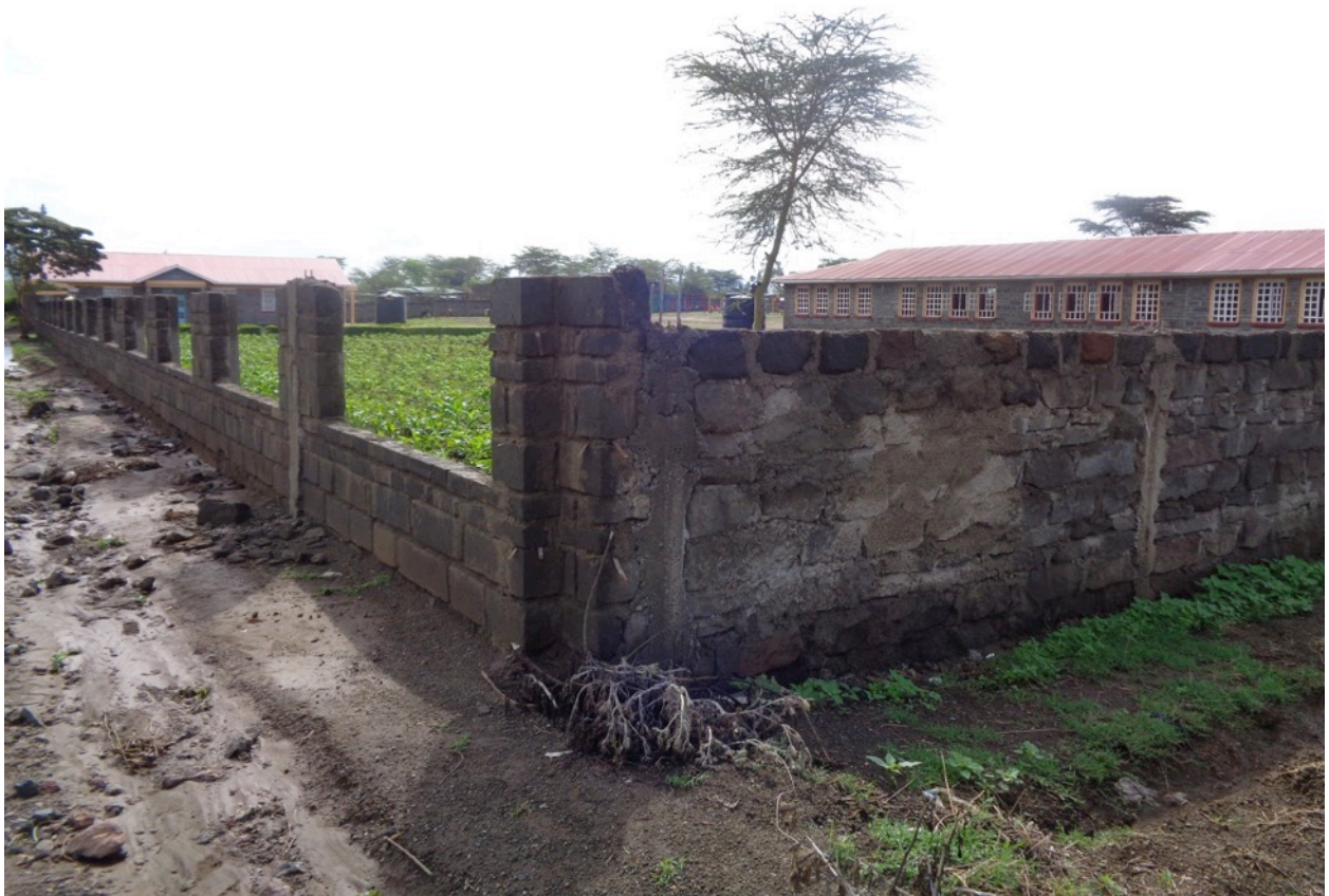
A complete wall around our school –metal grating is still necessary between the pillars