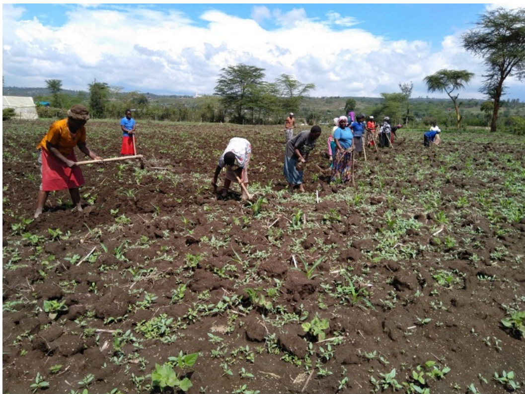
Above photos shows parents weeding in both leased and our school farm