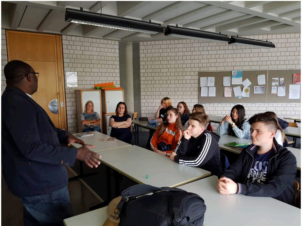
Talking to students and teachers at the Stein Gymnasium