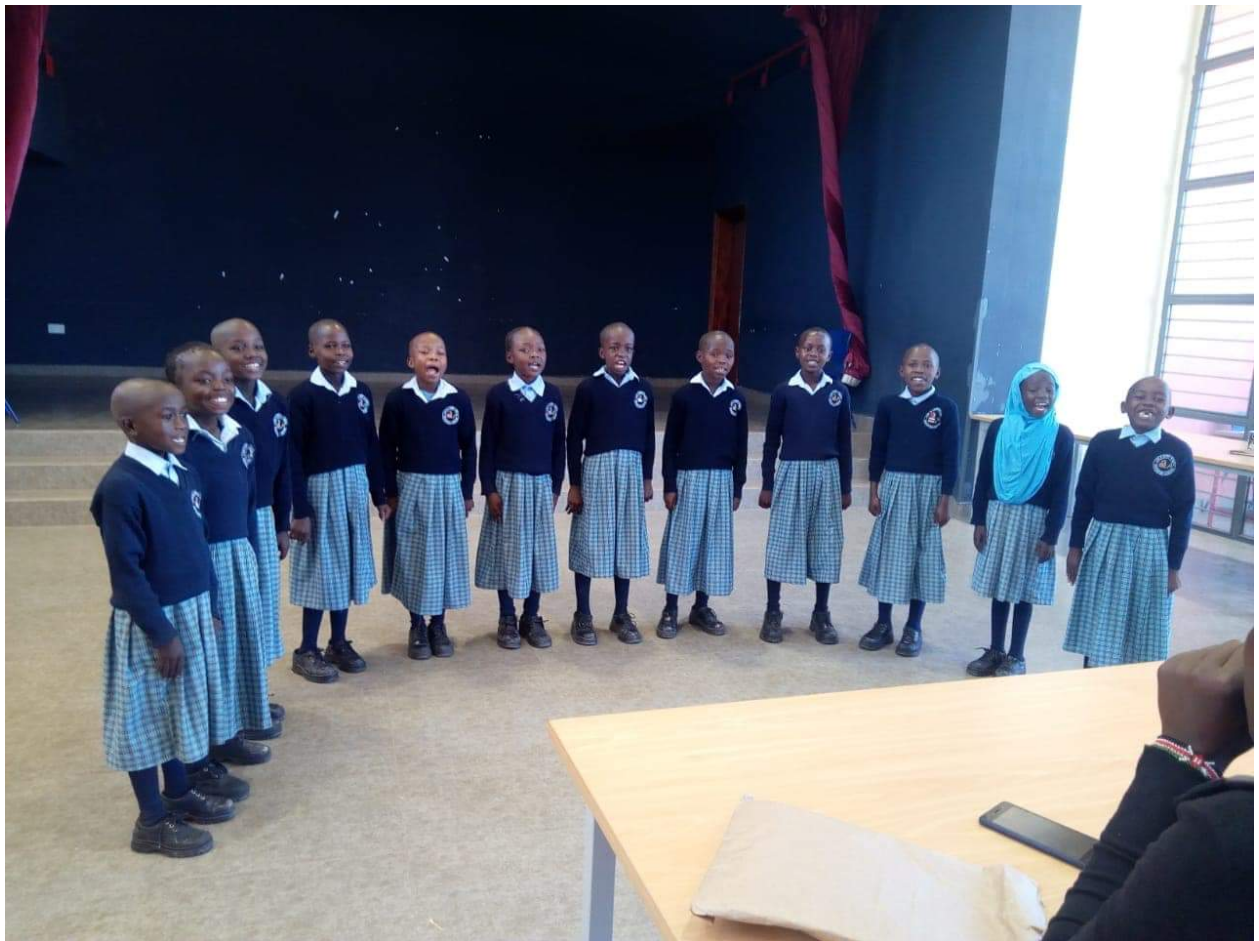
Our children on stage at the County Level

Extra-curricular activities are a major part of education syllabus in Kenya. It helps in identifying children talents and developing them. Our children perform very well in academic and extra- curricular activities. They perform very well in music and poems. This year, they performed stunningly well in Poems and Mashairi so that they reached the regional level. These children have promoted our school in our region. Everyone is asking where Live and Learn in Kenya Education Center is coming from. It has also shown people that talents are also found in the slums. That was new to many people.