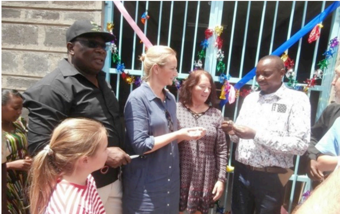
Official opening of the water filters and solar installation

They also organized a special party for all staff members. It was a wonderful get-together.