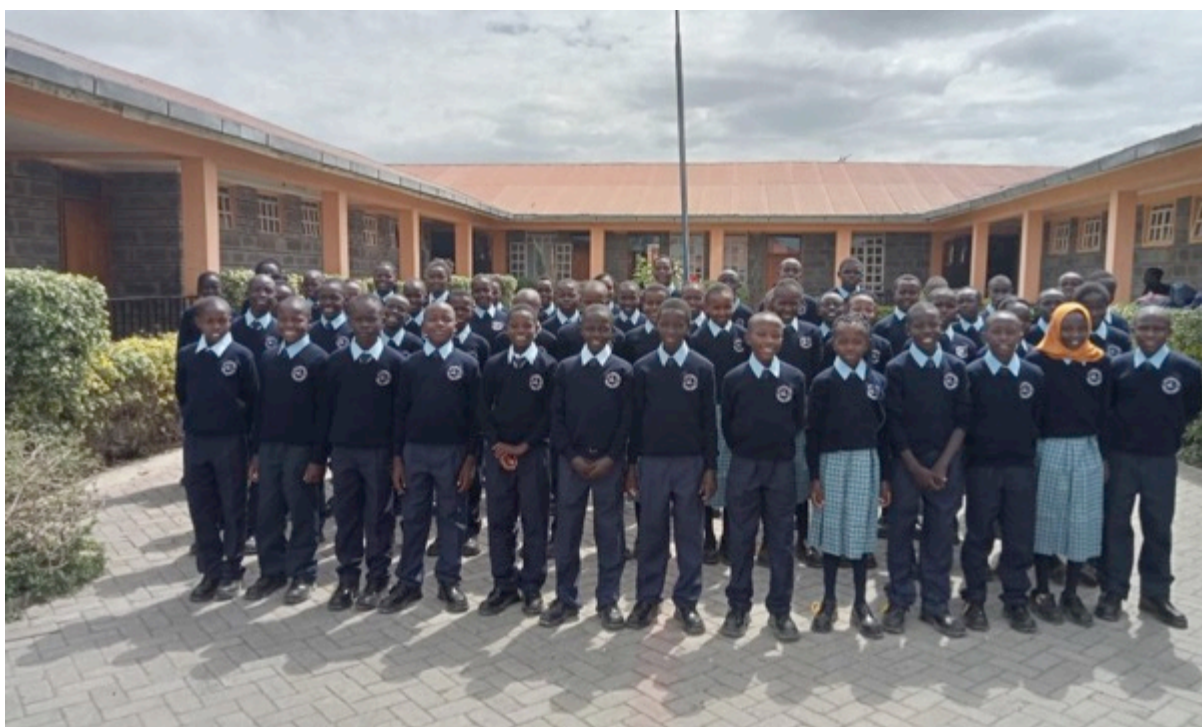
Junior secondary school students in their new school uniform