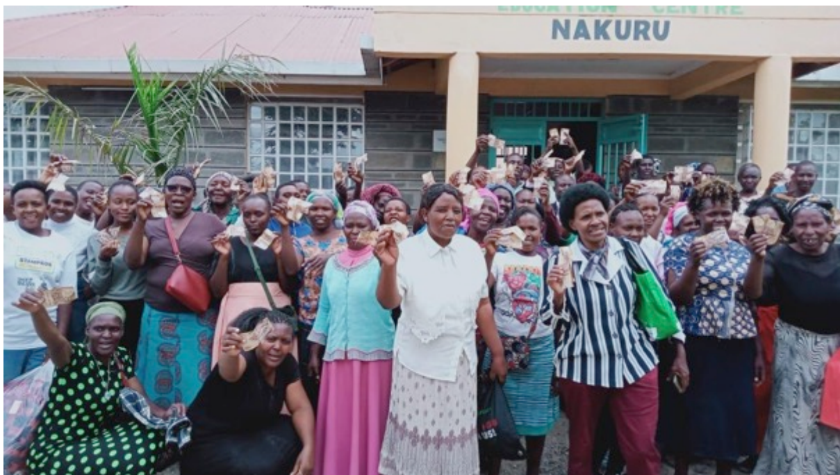
Parents with their money for Christmas