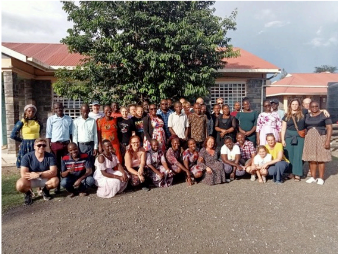
All smiles after guests-staff party