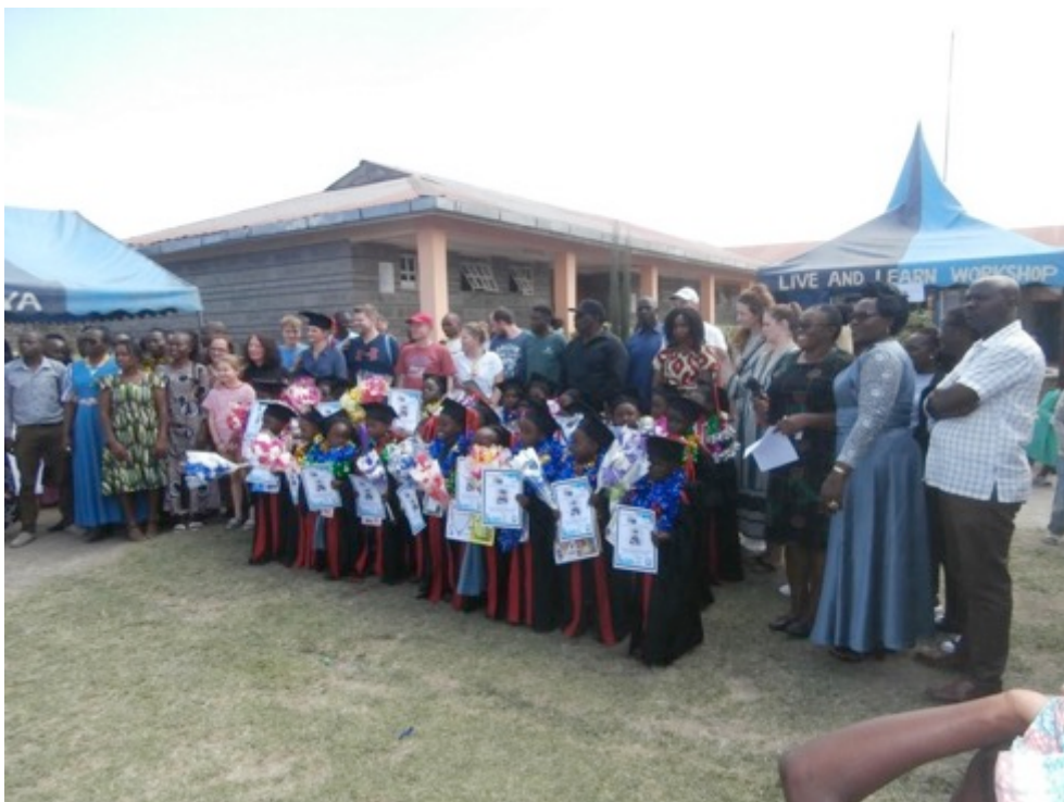
PP2 graduation ceremony