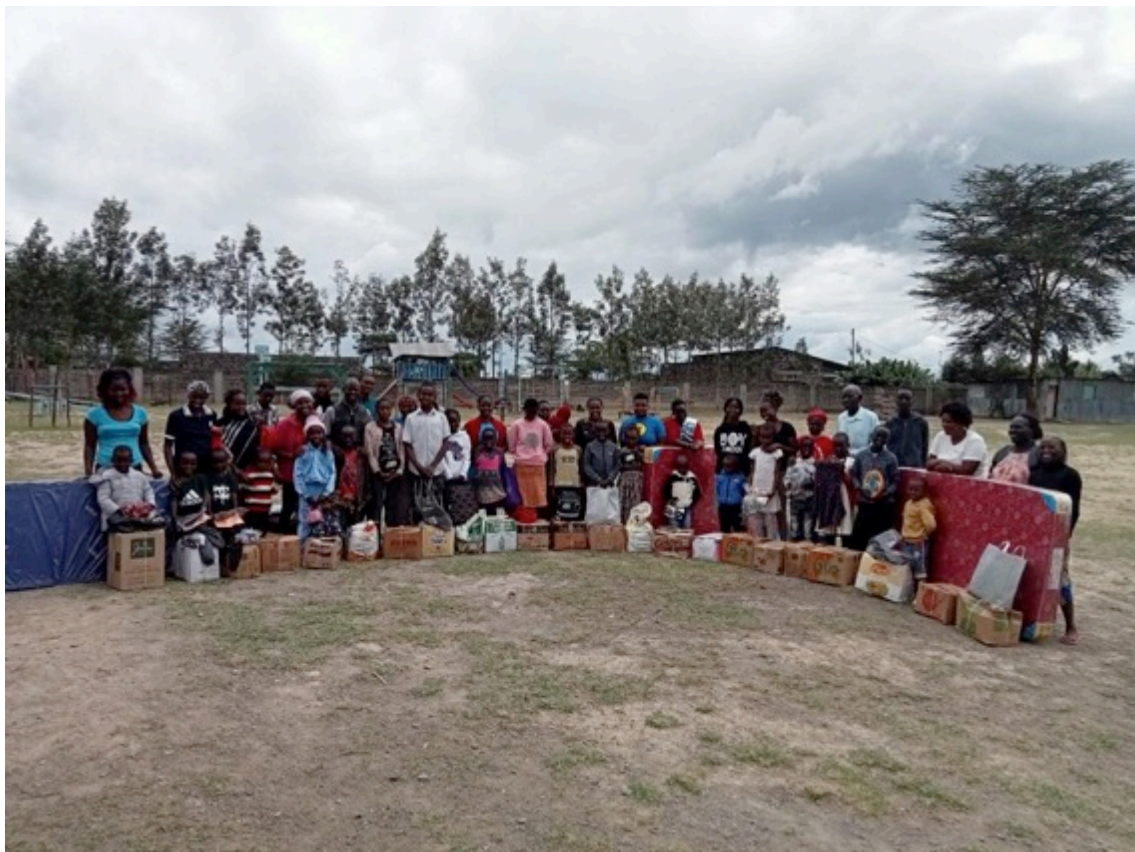
Parents and children with their food packages