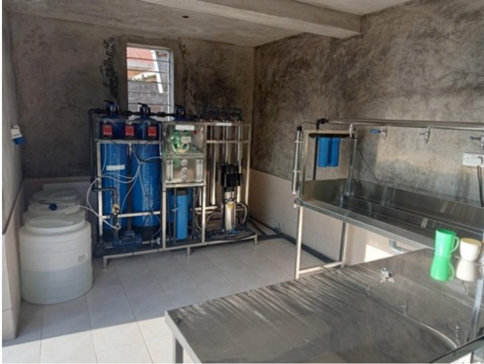
Water treatment machine

We received a donation from well-wishers from Germany to achieve this course. We installed water treatment machines in August this year. Since then our children can drink clean and treated water.