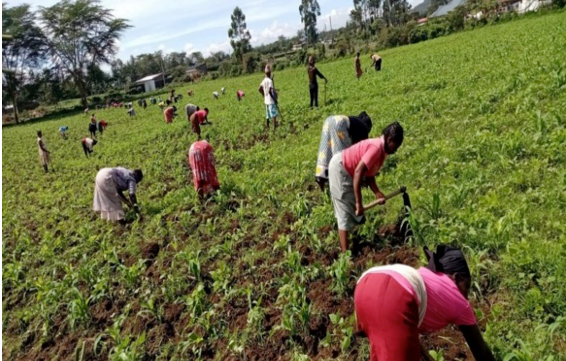
Above photos shows parents planting and weeding maize and beans