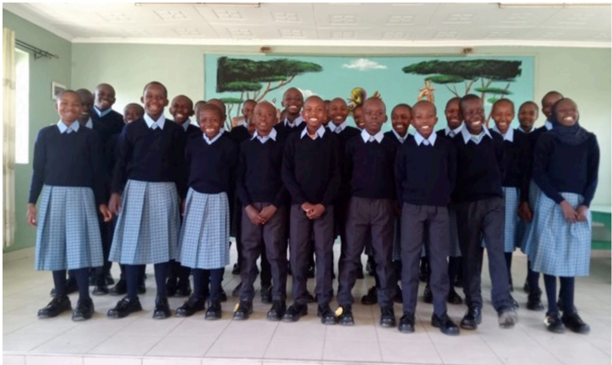
Junior secondary children

The Ministry of Education decided to move Junior secondary to Primary schools. In 2024, we will be having grade 8 of the new system.