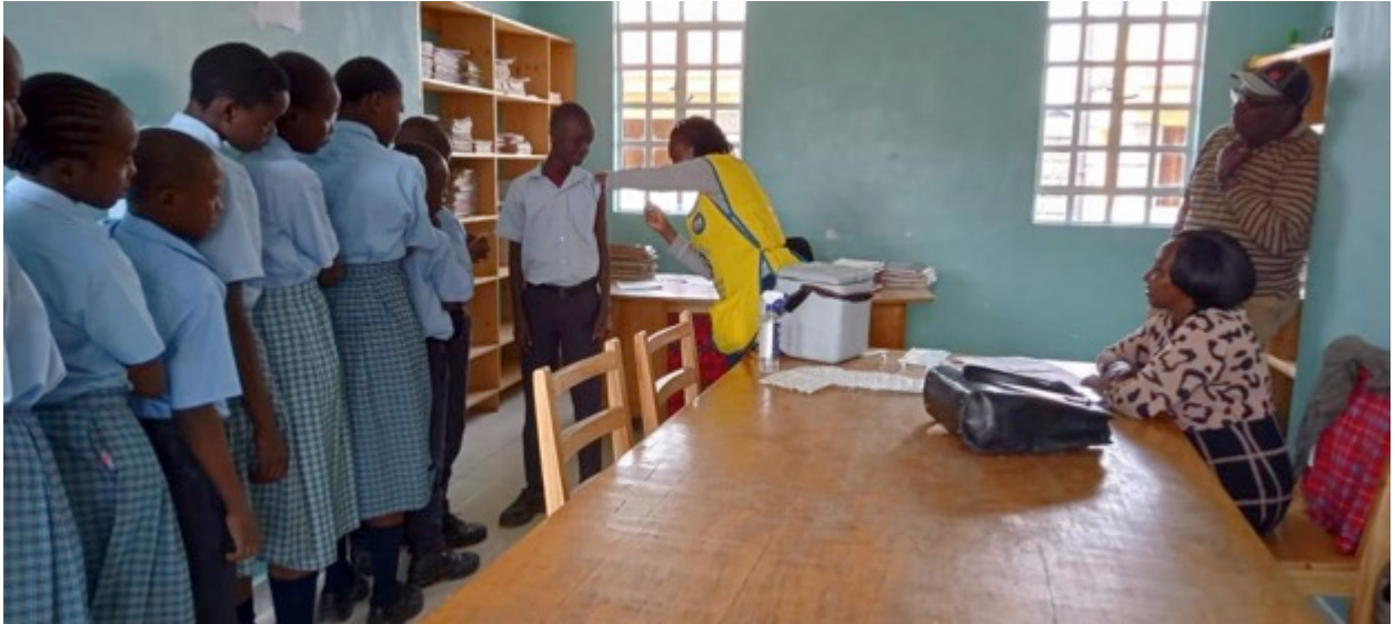
Children getting their COVID-19 vaccinations.