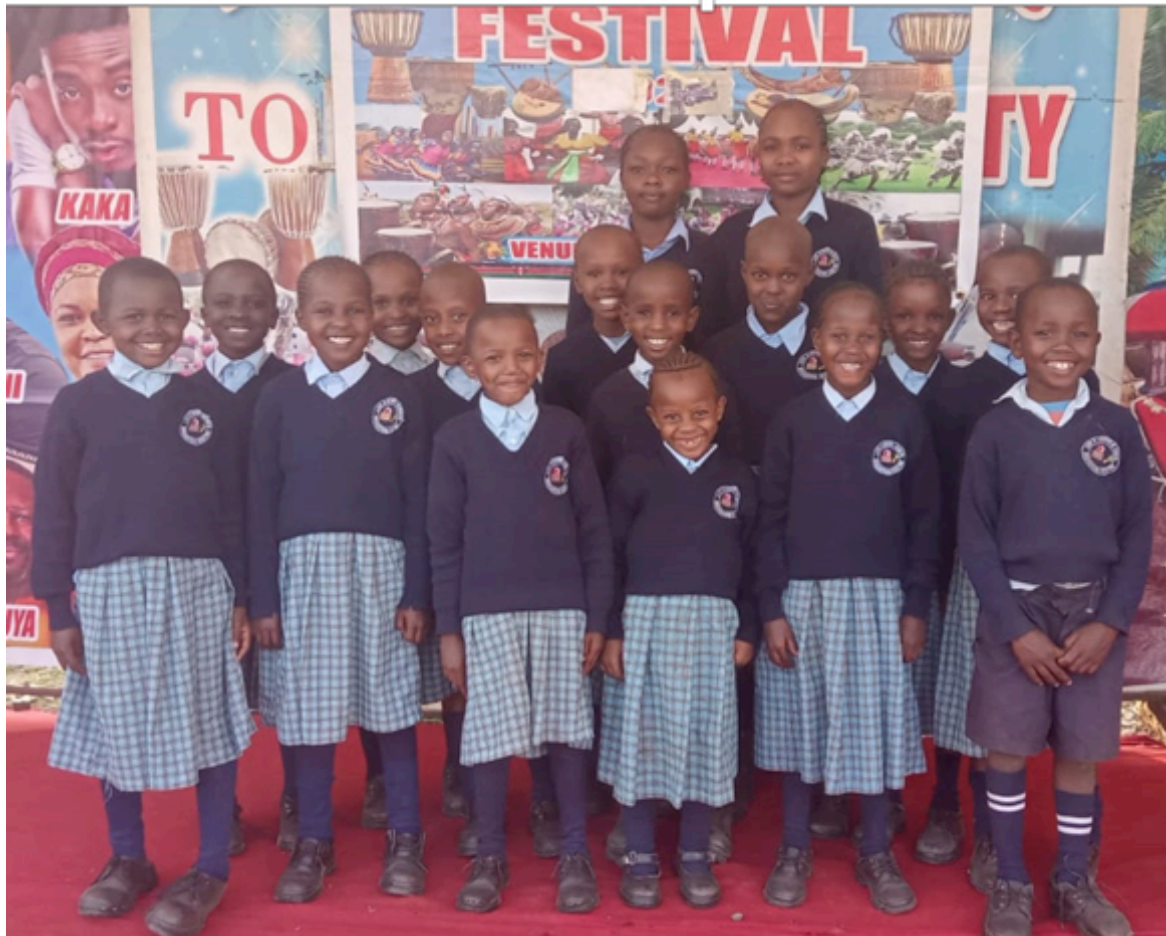
The above photos show our music team in Narok for the Regional Competition