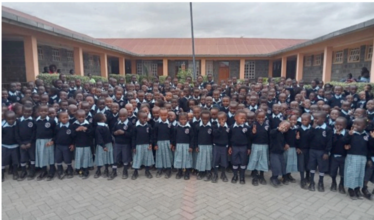
Happy children in their new school uniforms