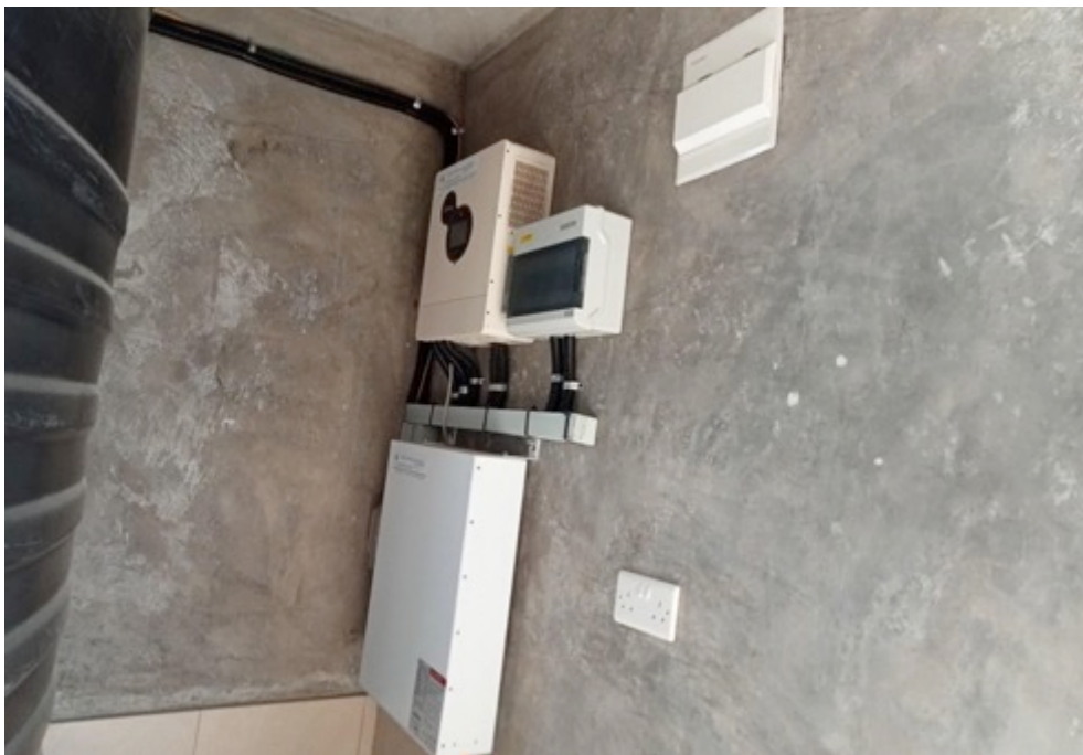
Solar batteries and inverter