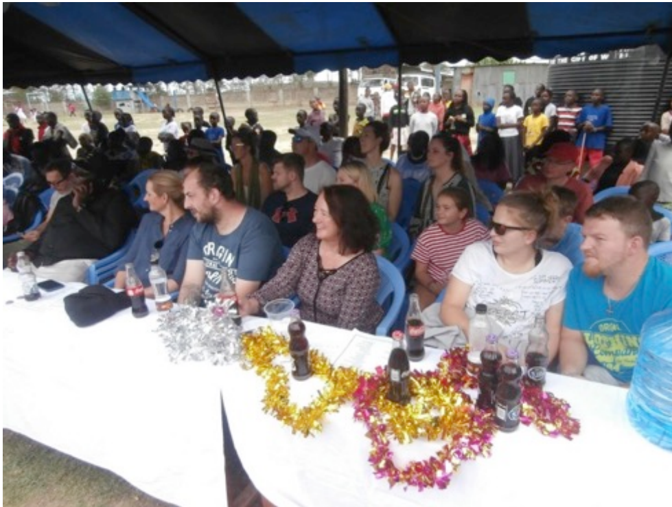
Guests during our annually held party which takes place when the chairwoman of both the German and the Kenyan LLK organizations visit the Live and Learn in Kenya Education Center - this year on November 11 th