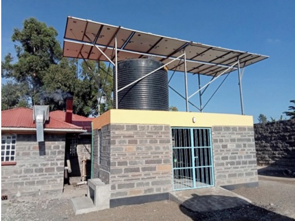
This building houses solar panels and water filters