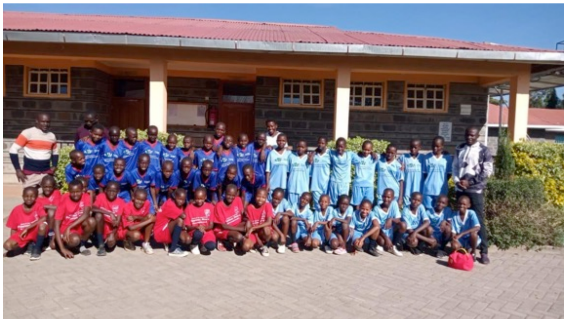
Our school athletics team

Other than academics, our school also organizes very good extracurricular activities, especially athletics. Our students performed very well in athletics at zonal, sub-county, and county levels. Our children were the best in music at both zonal and sub-county levels. They also performed well at the county level. This helps them to keep fit and fresh for their academics.