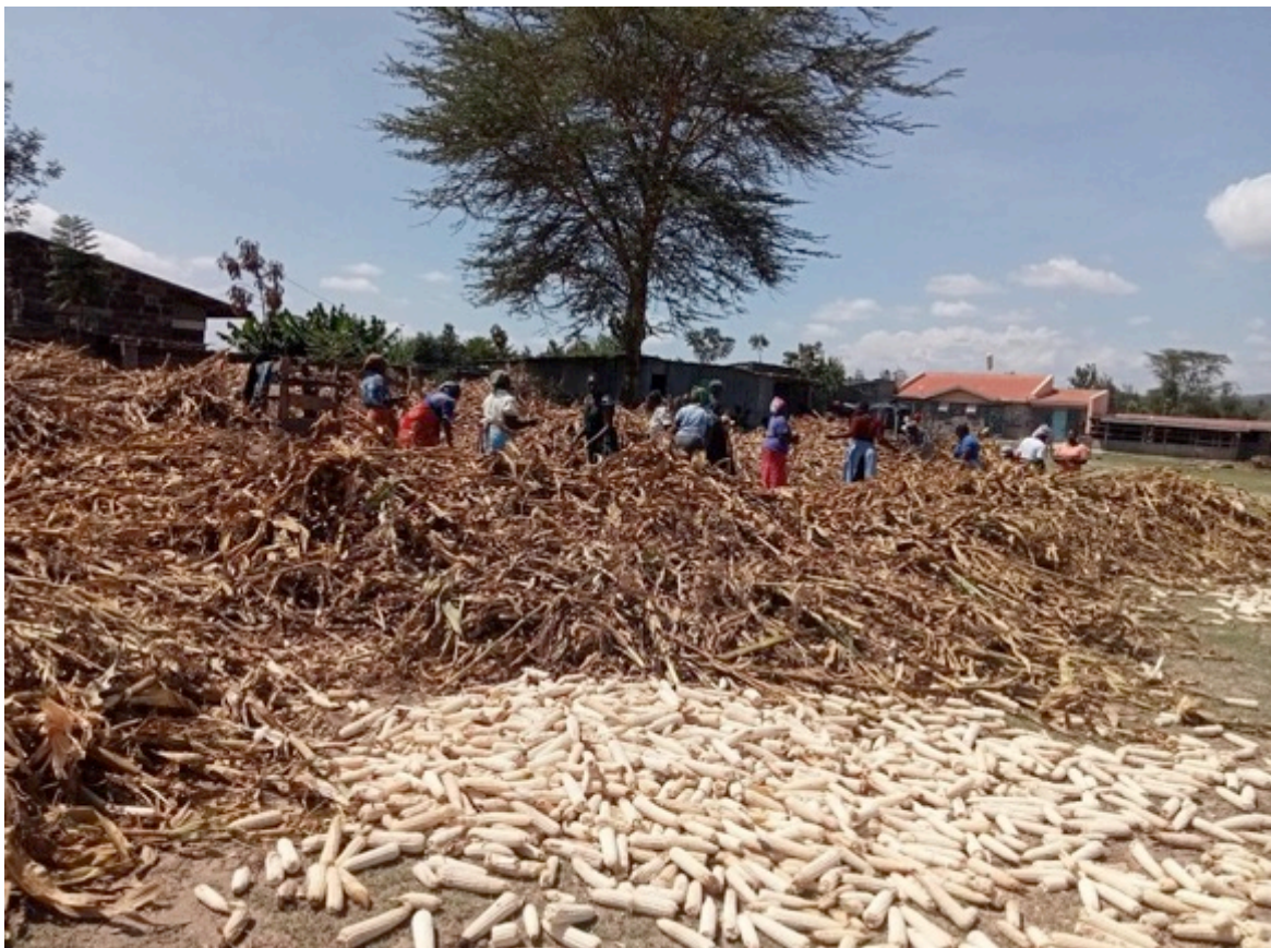
Parents harvesting maize.