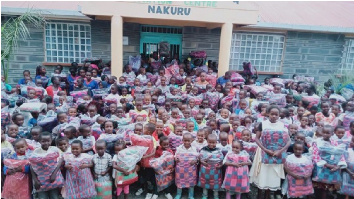
Children with their warm blankets