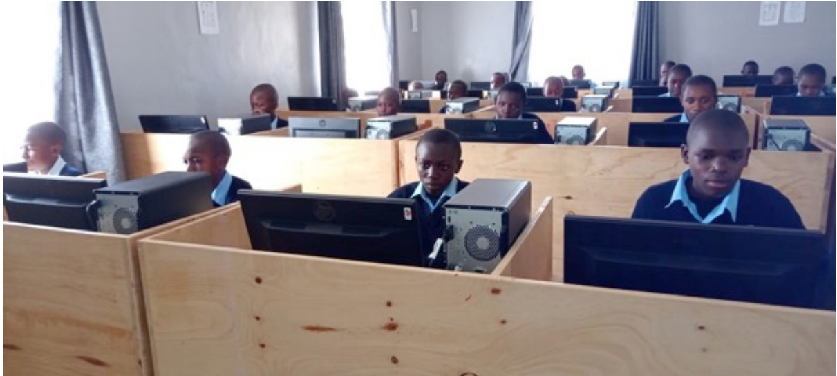
Grade 7 children during computer lessons

In Kenya, we have two systems of education running concurrently. That is the old 8-4-4 system and the new CBC system. Our current grade 8 is in the old system while our two kindergarten classes and grades 1-7 are in the new CBC system. Grade 7 is in Junior secondary. We are going to have 3 junior secondary classes. Grades 7-9 will be our secondary section before they join senior secondary in grade 10.