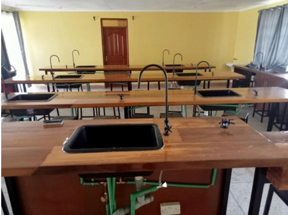
Our science laboratory

It is now fully equipped with all necessary equipment and ready for use as of January 2024.