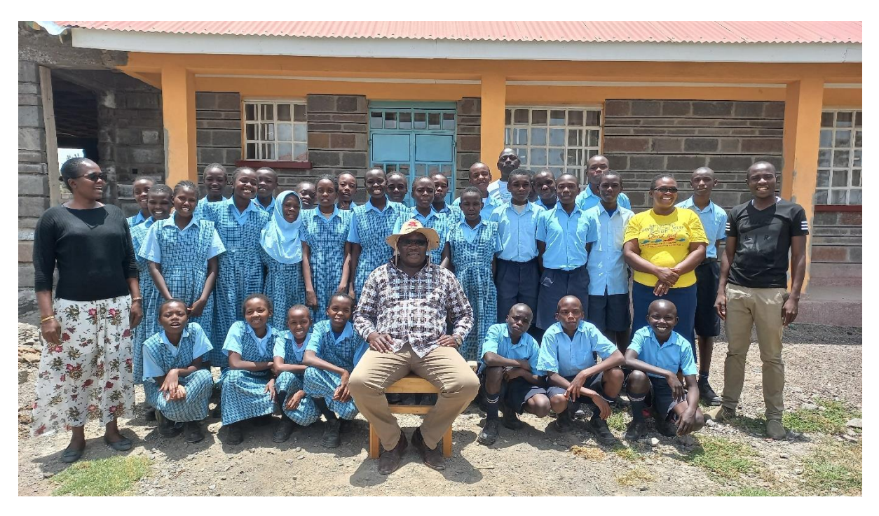
EDUCATION IS THE KEY TO THE FUTURE

2022 school calendar started on 3<sup>rd</sup>, January. This is the day we opened our school for the 3<sup>rd</sup>, term of academic year. From 3<sup>rd</sup>, January when the school calendar started, we closed the year on 30<sup>th</sup>, November after grades, 6 and 8 had done their final exams.