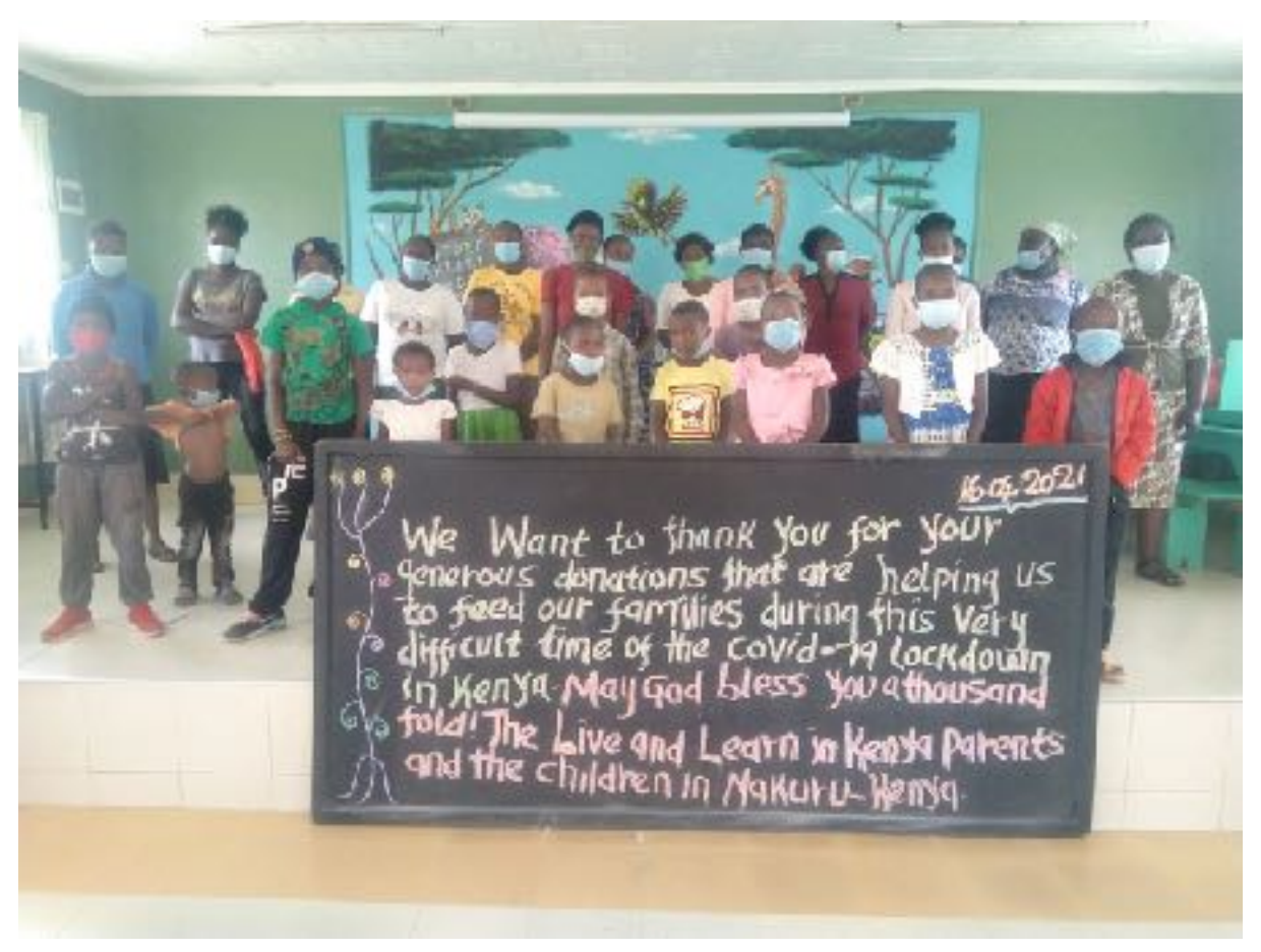
Parents were very grateful for the financial support they received from sponsors and donors.