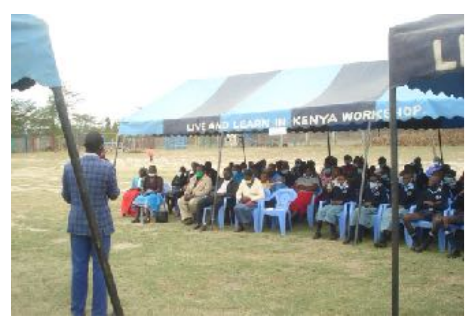
A pastor praying for grade 8 children

5 Ministry of Health officers were also invited to come and vaccinate both our parents and staff. Over 200 people were vaccinated. I asked all parents to be fully vaccinated by end February in order to be allowed on our school premises. This is to control Covid-19 spread both in our school and in the area.