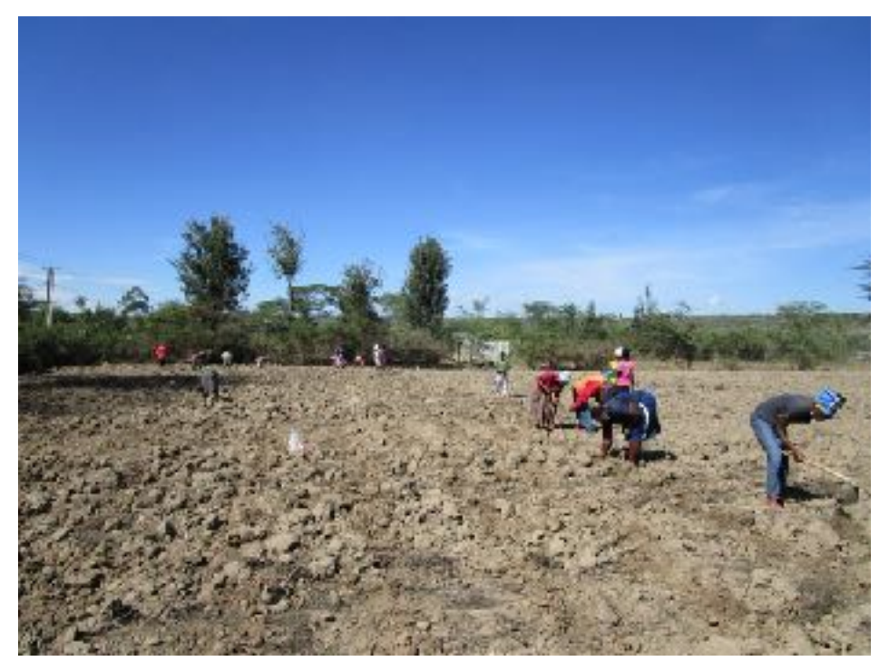
Parents planting maize and beans