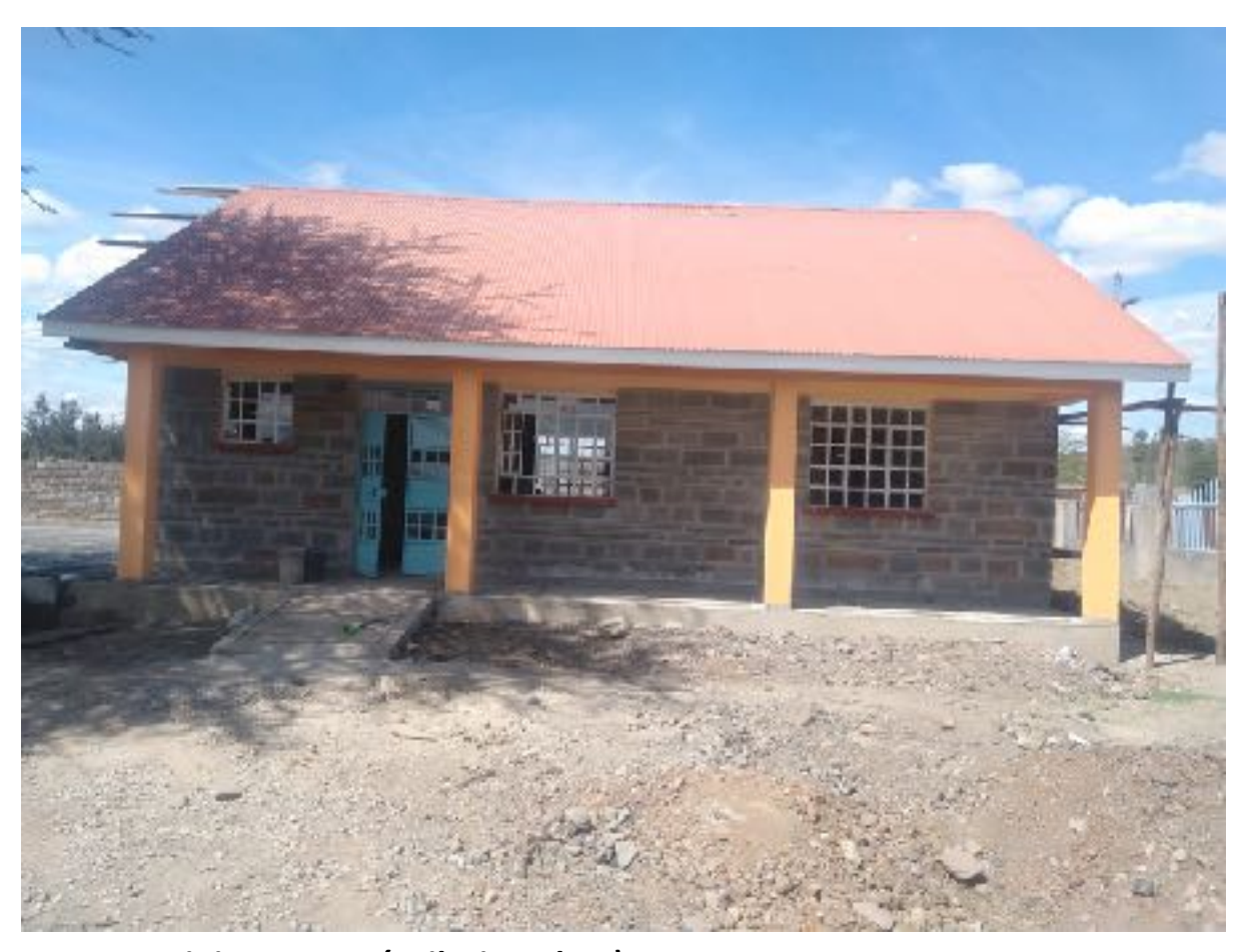
Career Training Center (Tailoring Class)

We may build more workshops in future if need be and also depending on availability of funds. Our computer workshop will really help our children to be computer literate which is a Ministry of Education requirement. At the same time our tailoring workshop will assist in training our youths and sewing our school uniforms.