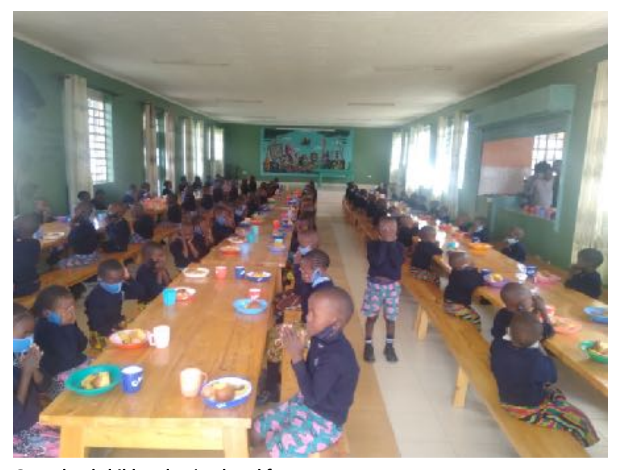
Our school children having breakfast

We pay for pupils's lunches in public schools in their respective schools while those who attend our school have breakfast and a well-balanced warm lunch every day. Other than the normal rice, beans, and vegetables. They also have milk, fruit and meat. All LLK children and youths are able to receive such lunches on Saturdays.