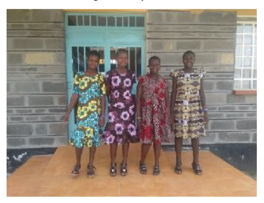
After 5 months of training they were able to make their own Christmas dresses