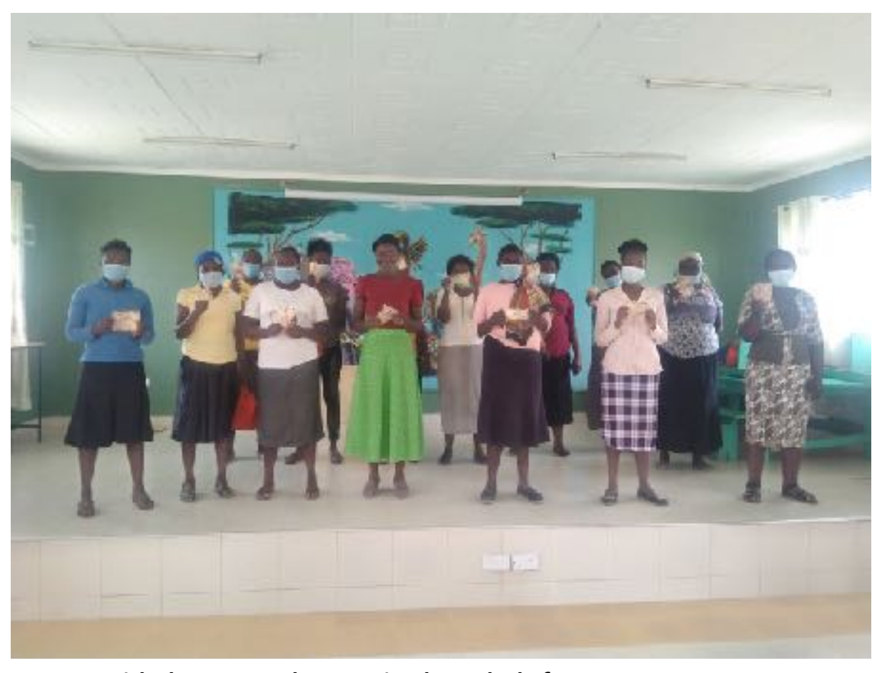
Parents with the money they received regularly from sponsors

We are very grateful to our sponsors who made sure that all staff, children and parents received salaries, presents and money for food and soap throughout the Covid-19 lockdown period. They were all extremely grateful for this support.