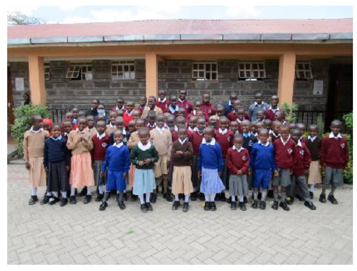
Above photo shows children from our partner public school in new uniform

By the end of February, all our children had received their full school uniform including shoes and socks.