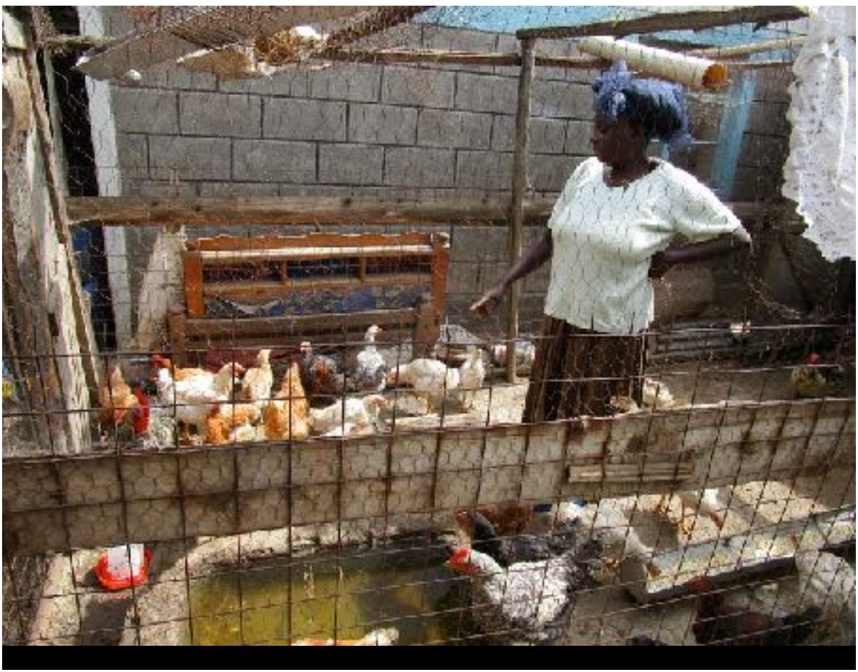
Chicken keeping business

We visit all families doing business to monitor their progress. The last visit was in December. Most of them are doing well and families are able to buy their basic needs. They are very appreciative for the assistance.