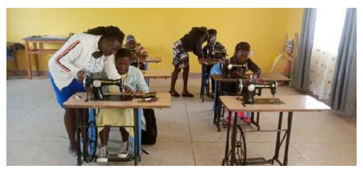
Girls at the tailoring workshop

We paid school fees and bought school uniforms for all children who joined high school and vocational training.