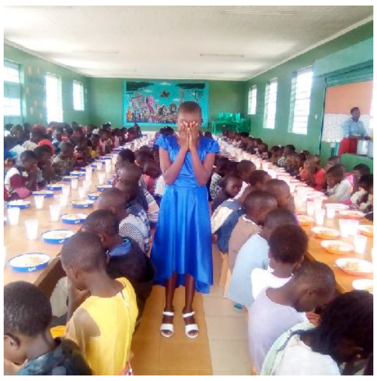
Lunch time with a glass of milk