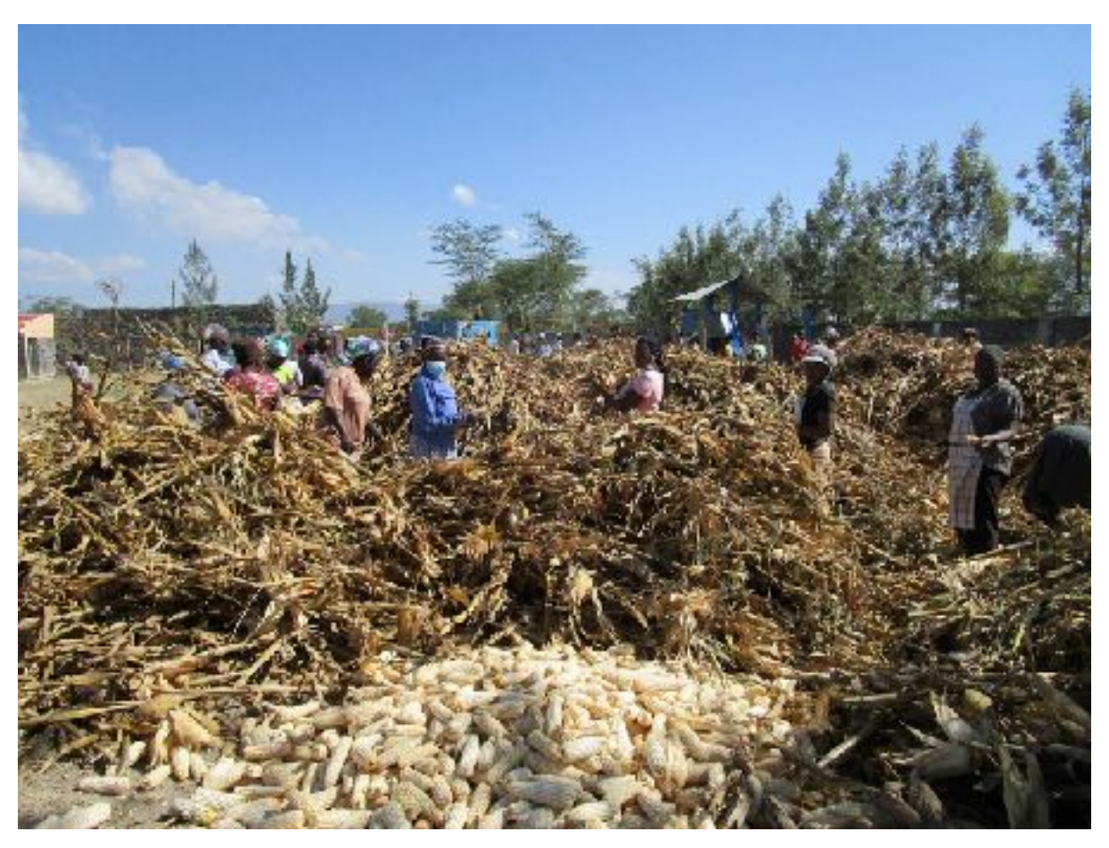
Parents harvesting maize