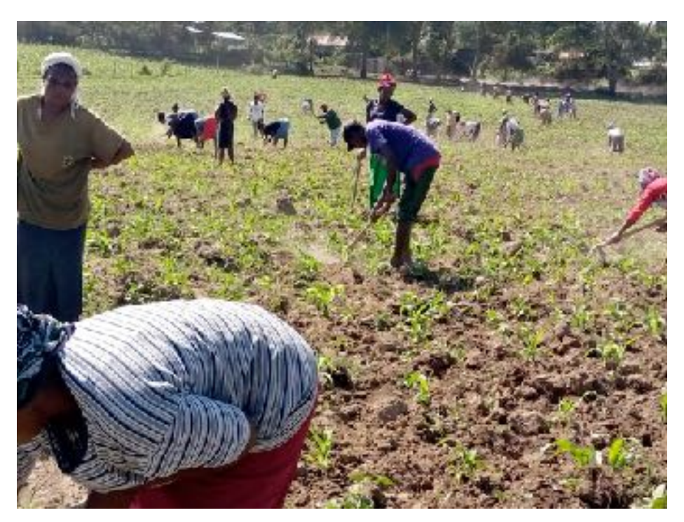
Parents weeding maize and beans