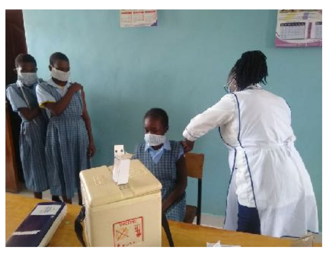
Girls getting vaccine for cervical cancer

On December 18<sup>th</sup> officials from the Ministry of Health came to our school for parents and staff's Covid-19 vaccination. Over 200 parents have been vaccinated. Out of this number, 141 received their first vaccination. The medical officer in charge was very happy because that was the highest number they vaccinated in this area in one day. The vaccination was done at our satisfactorily equipped Day Clinic.