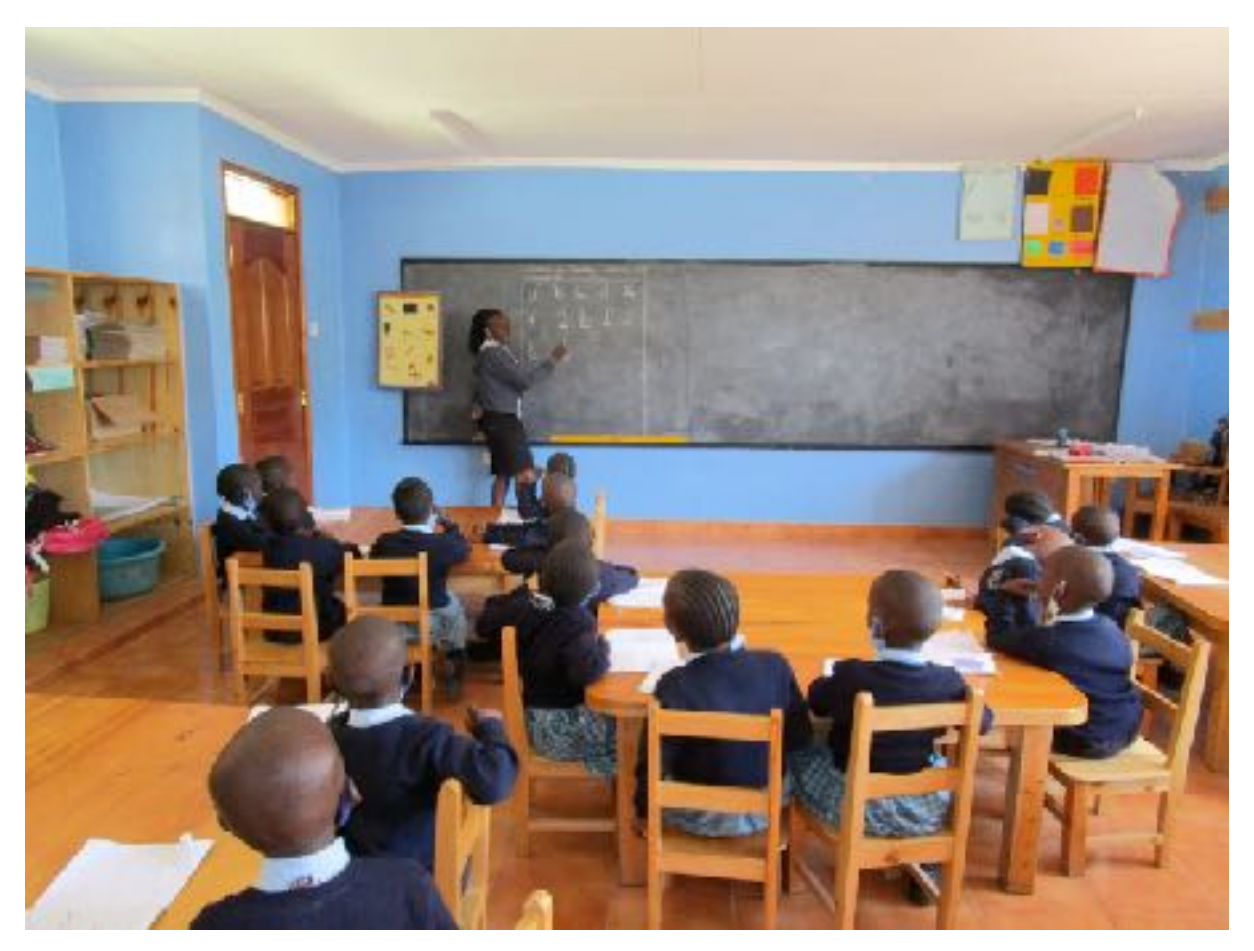
Emmaculate Angano in PP1