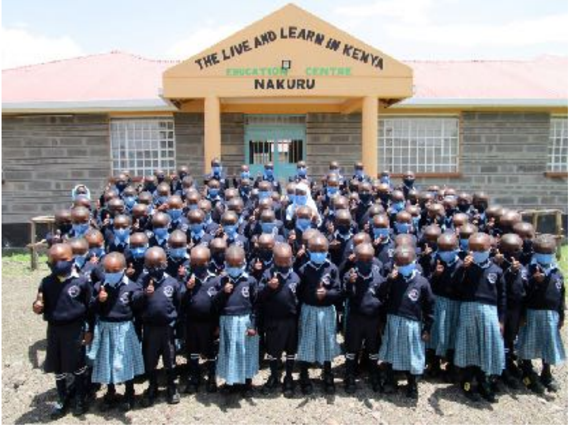
LLK children in their new school uniform