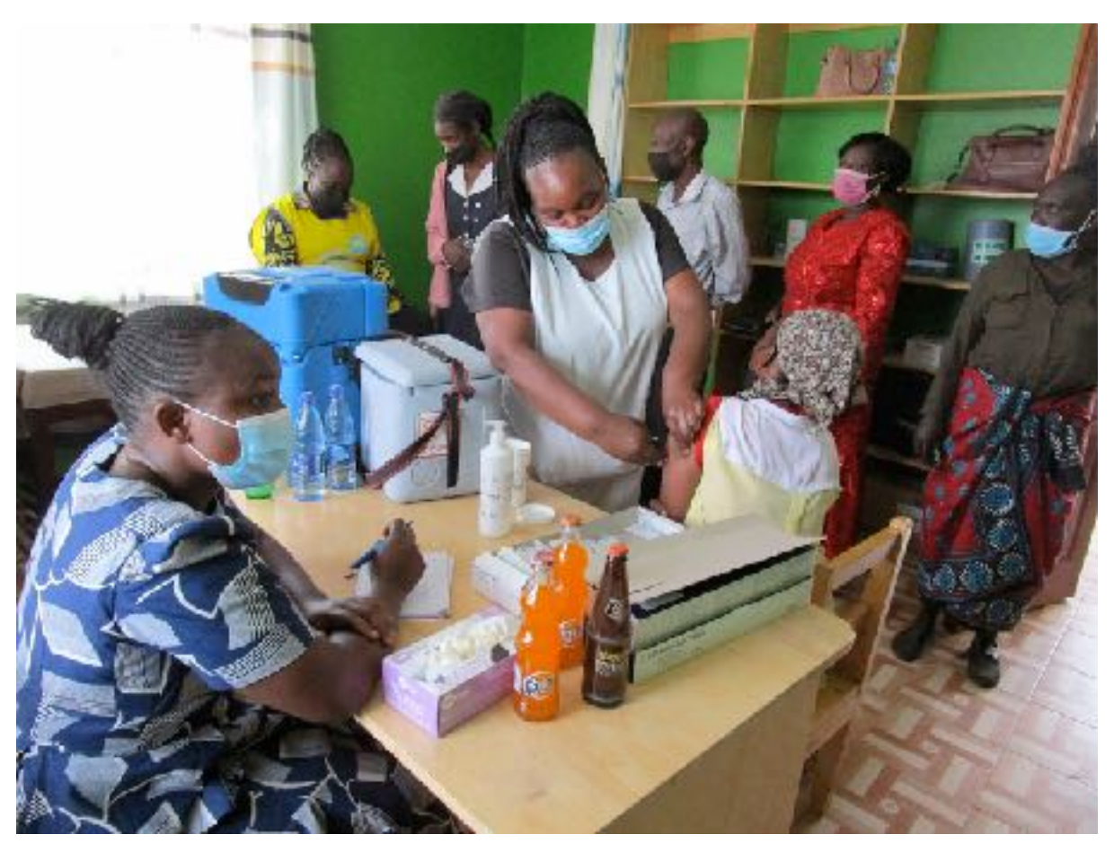
A parent receiving a Covid-19 vaccination