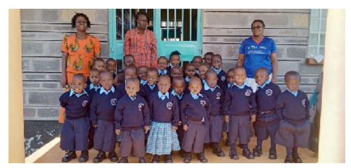
Day care children with their teachers

All of them received full school uniform and other learning material ready to start their learning journey. They will be moving to Pre-primary 1 in April 2022.