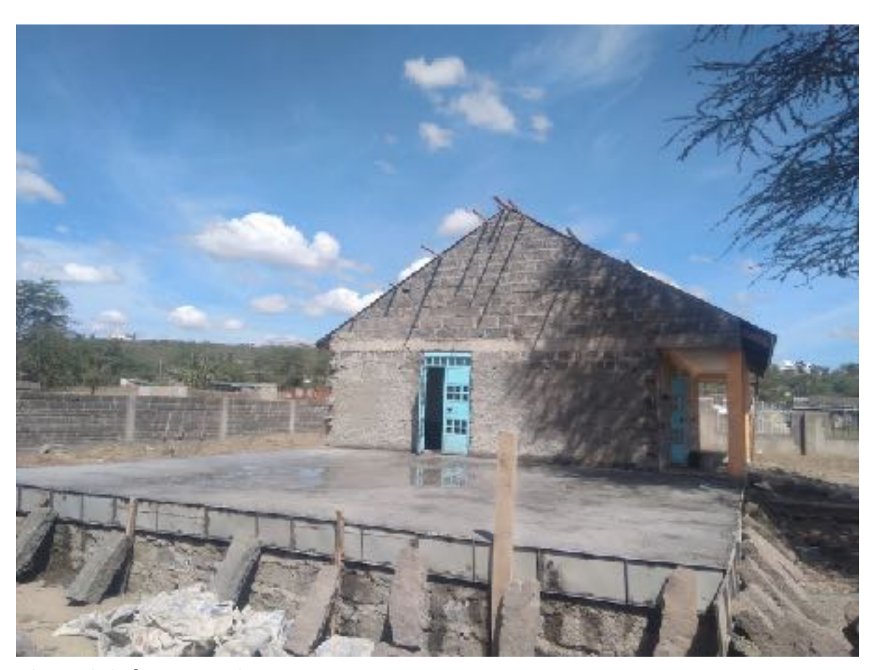
Floor slab for an IT classroom