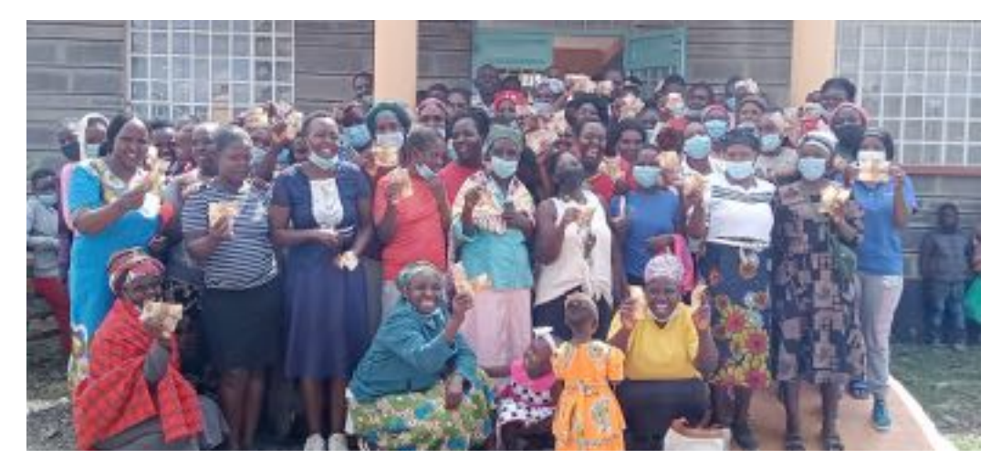
It's all SMILES as parents/guardians receive funds for Christmas

This year, like last year, we were not able to buy foodstuff as Christmas presents for our parents. Parents once again received cash funds to buy Christmas food themselves.