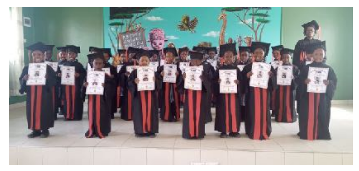
Children who graduated from Preschool to Grade 1