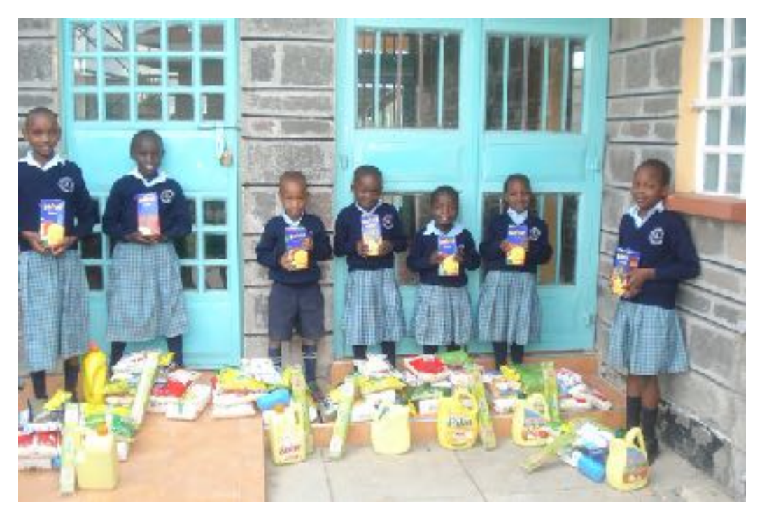
Children with extra Christmas presents

This year, like last year, we were not able to buy foodstuff as Christmas presents for our parents. Parents once again received cash funds to buy Christmas food themselves.