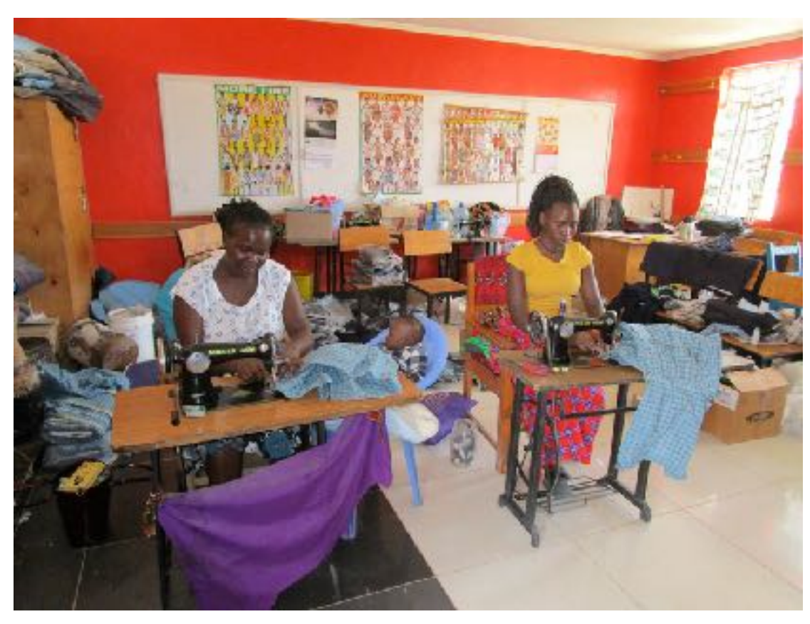
Our project girls sewing school uniforms - which saves clothing funds.