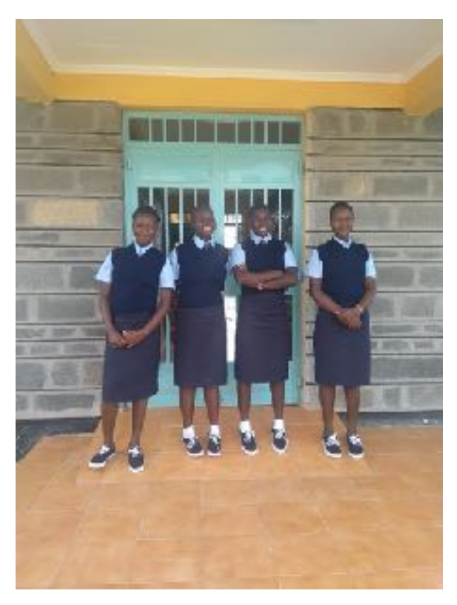
Tailoring girls in their school uniform