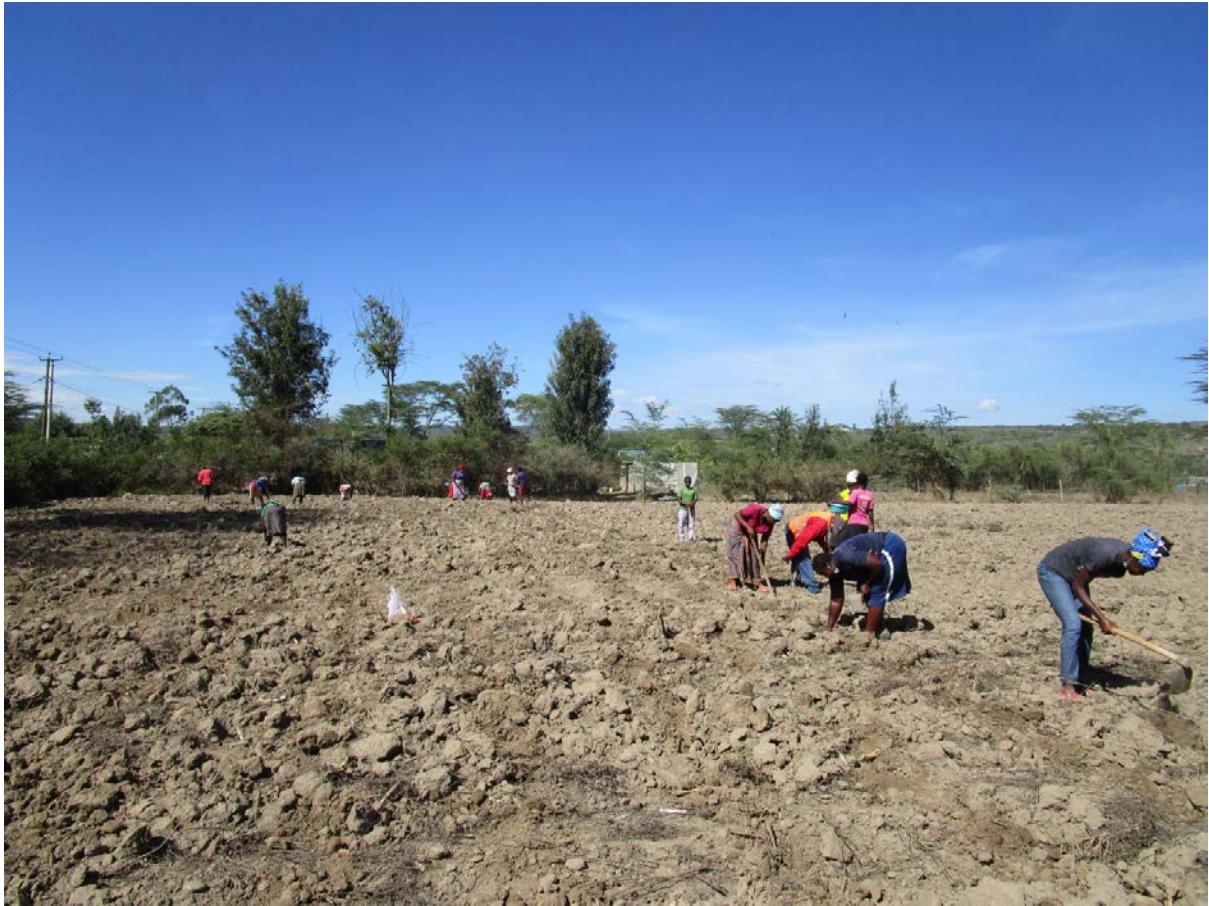
Parents planting maize and beans