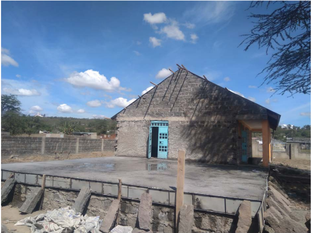
Floor slab for a computer workshop