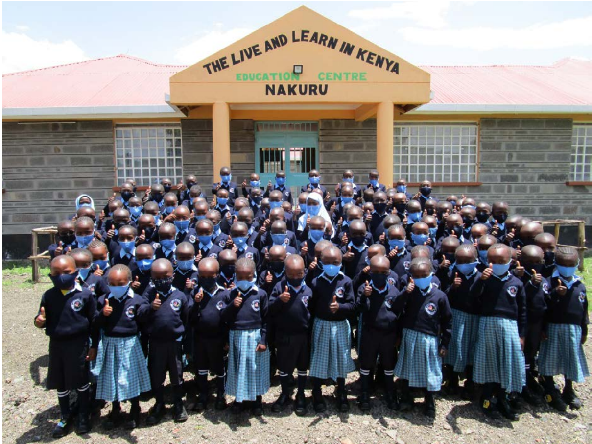
By the end of February, all our children had received their full school uniform including shoes and socks.