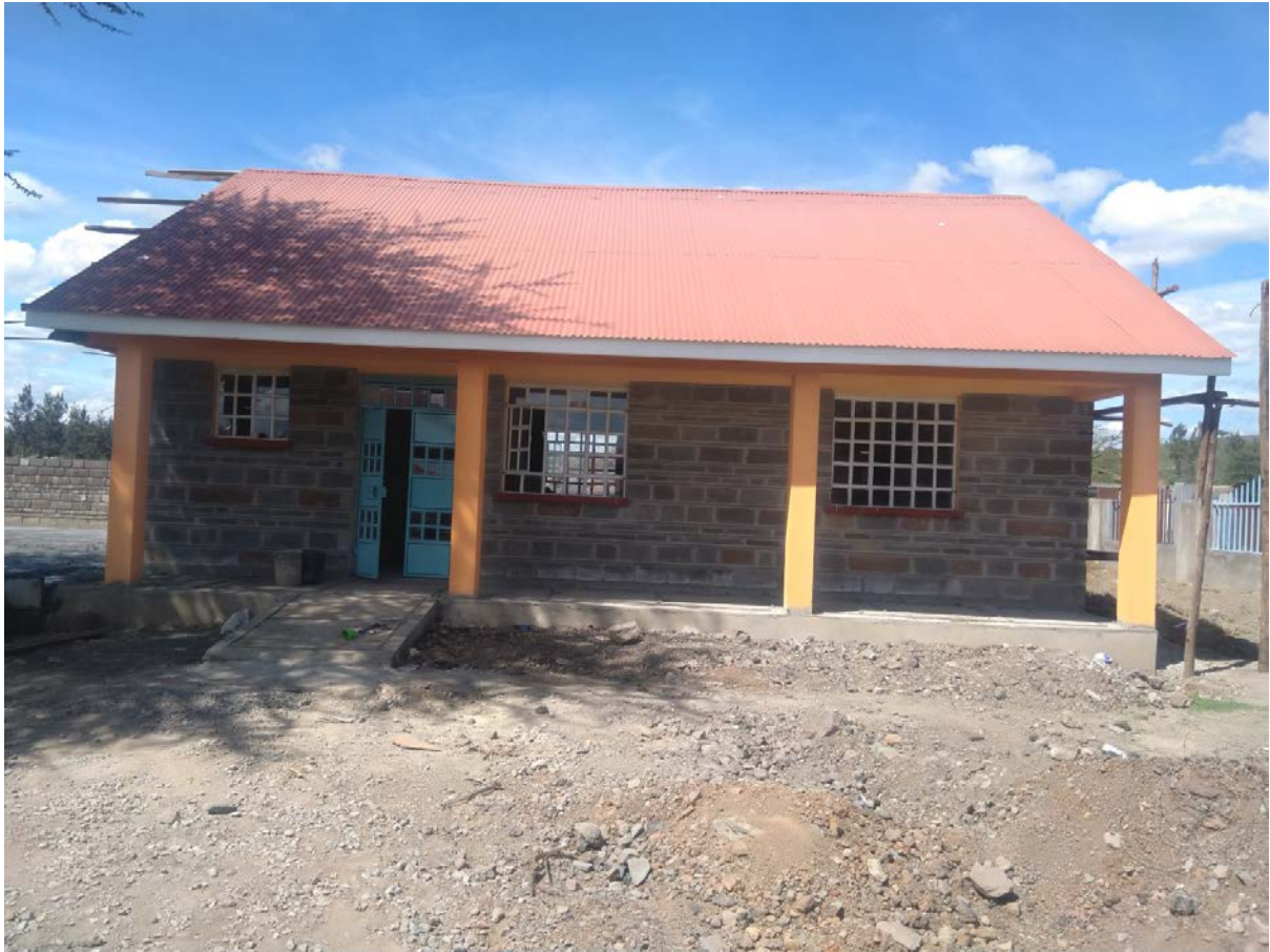
Career Training Center (Tailoring Workshop)

We hope to build more workshops in future depending on availability of funds. Our computer workshop will really help our children to be computer literate, which is a Ministry of Education requirement. At the same time our tailoring workshop will assist in training our youths and making our school uniform.