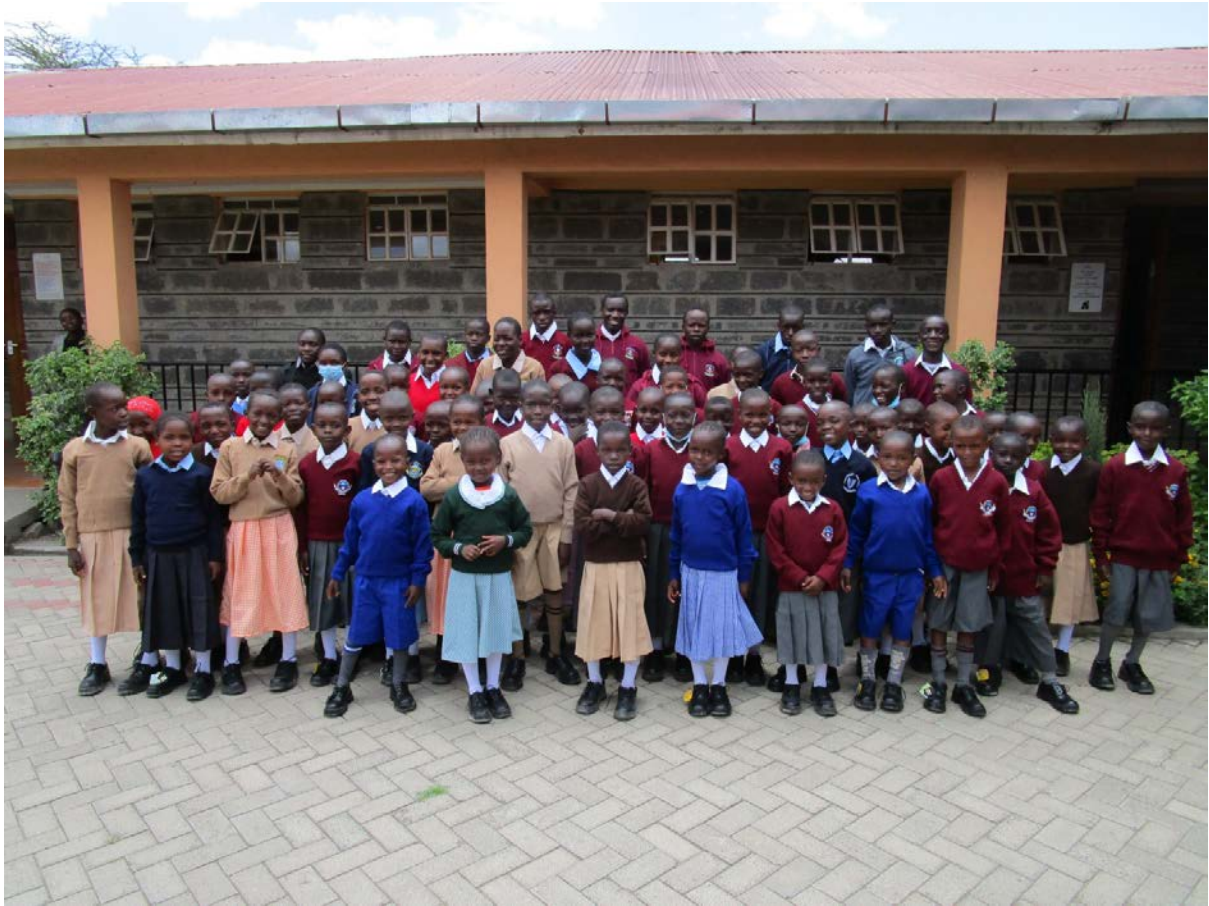
Above photos shows children from our school and those from our partner public school in new uniform.