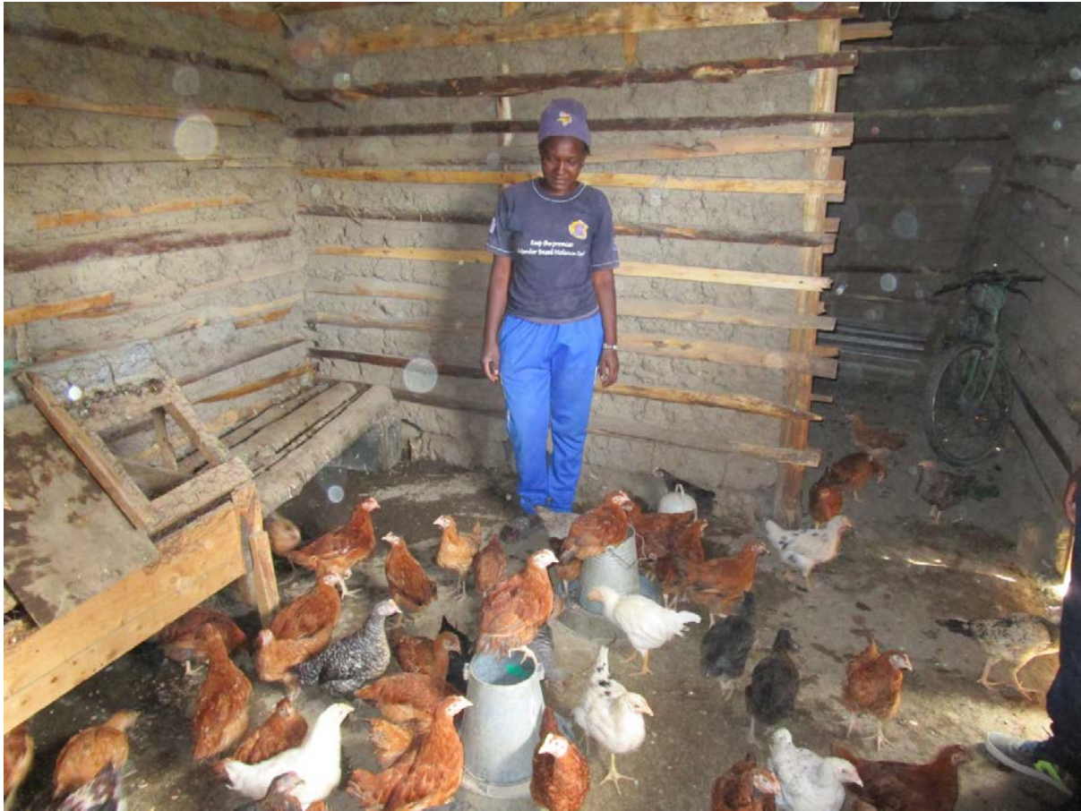
Chicken keeping business

In early February, we visited all families running businesses in order to monitor their progress. Most of them are doing well and families are able to buy their basic needs. They are very appreciative for the assistance.