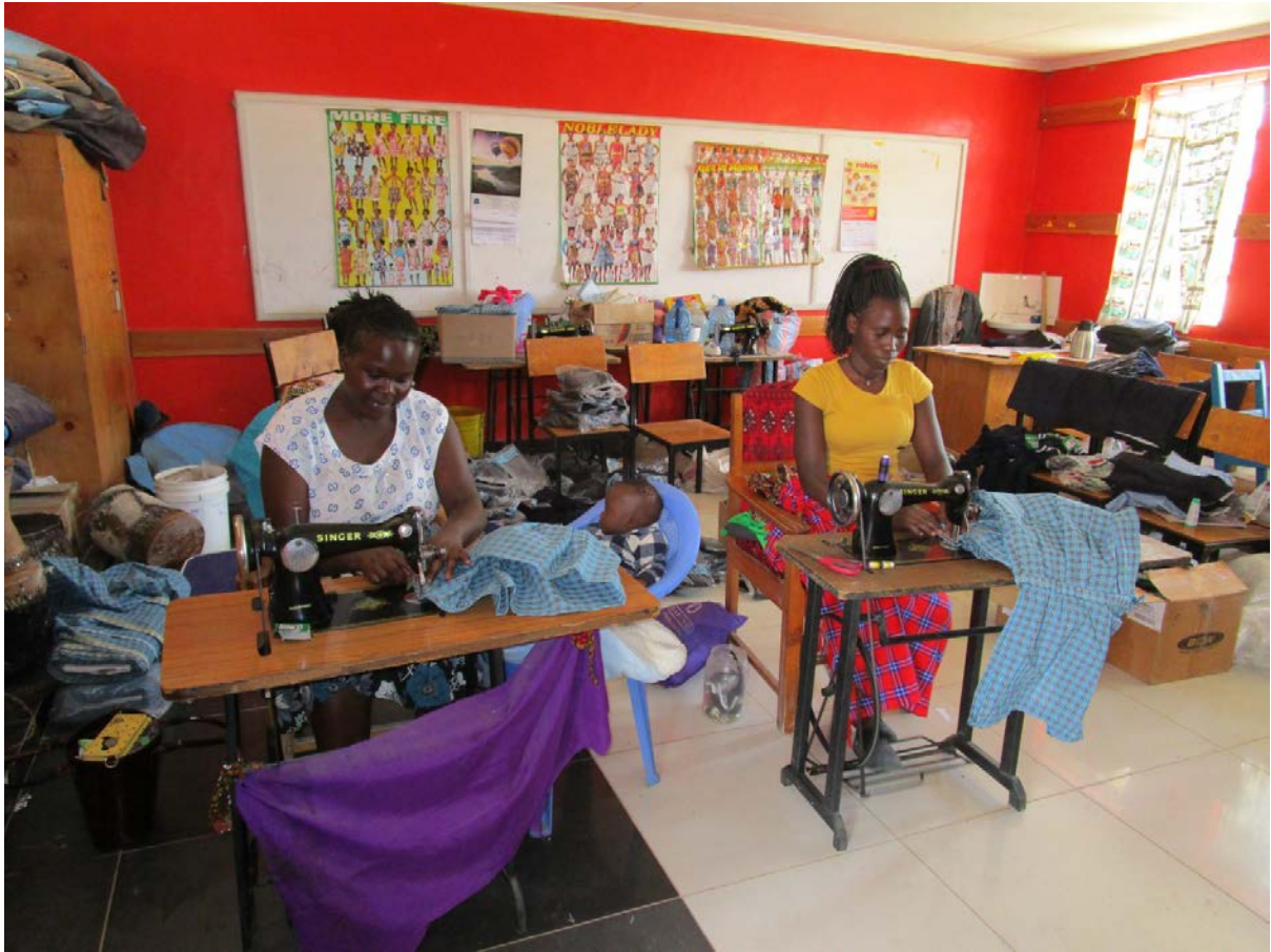
Our project girls making school uniforms.

All school uniforms are made at our workshop by our girls whom we trained in tailoring. This helped us to save a lot of money.