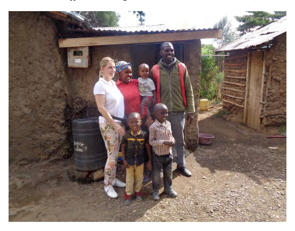
Most of the visitors are sponsors of our project's children. They visited their homes to see their living conditions as seen in the above photo.