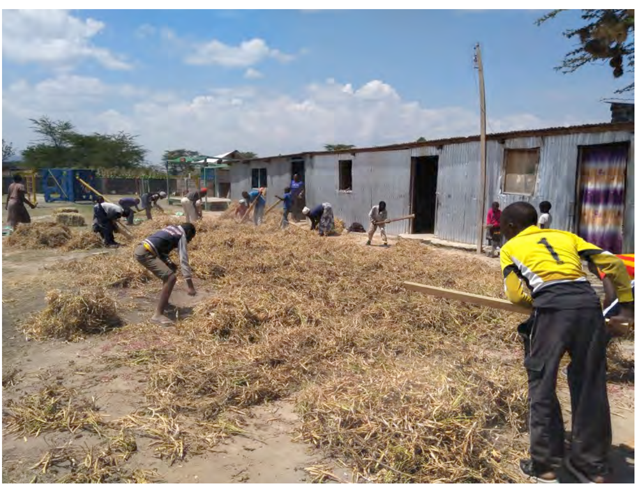
Children helping parents to shell beans