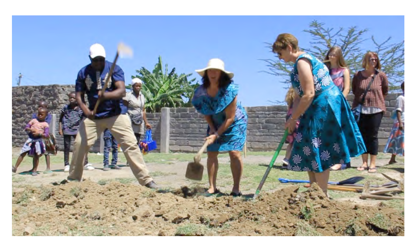
Ground-breaking of Kindergarten construction