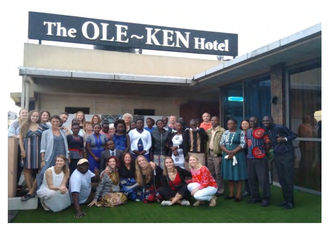
Guests with LLK staff at Ole Ken hotel where we all had dinner together