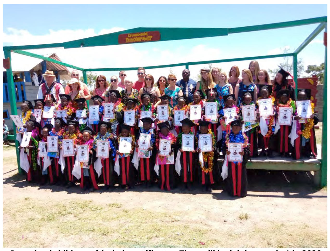
Pre-school children with their certificates. They will be joining grade 1 in 2020