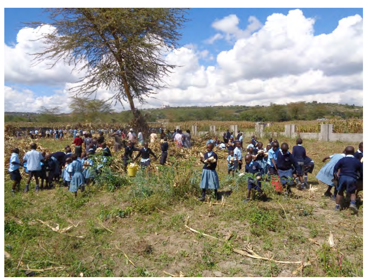
Children, parents and staff harvesting maize on our school farm

Parents, staff and children helped in harvesting. Parents did the digging of land, planted, weeded and helped in harvesting. We are also planning to lease land for the same next year.