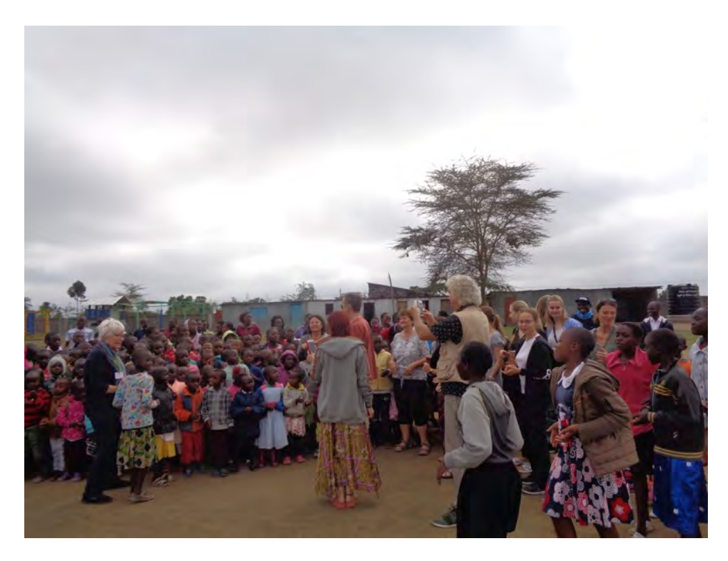
Children and staff welcoming visitors at LLK center on 28<sup>th</sup>, October