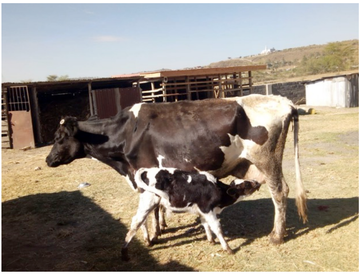
Riziki with her calf