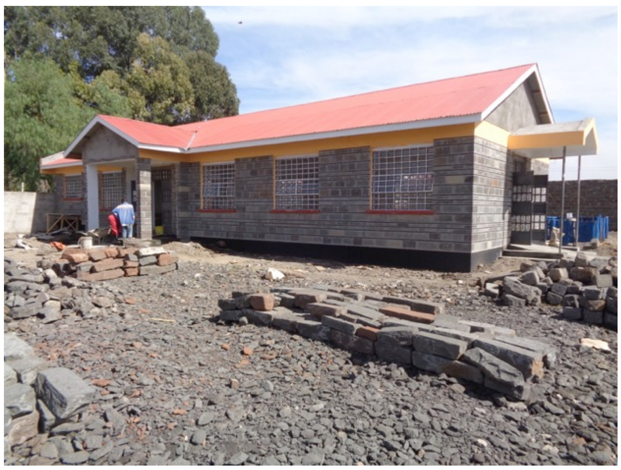
Work in progress at our dining hall