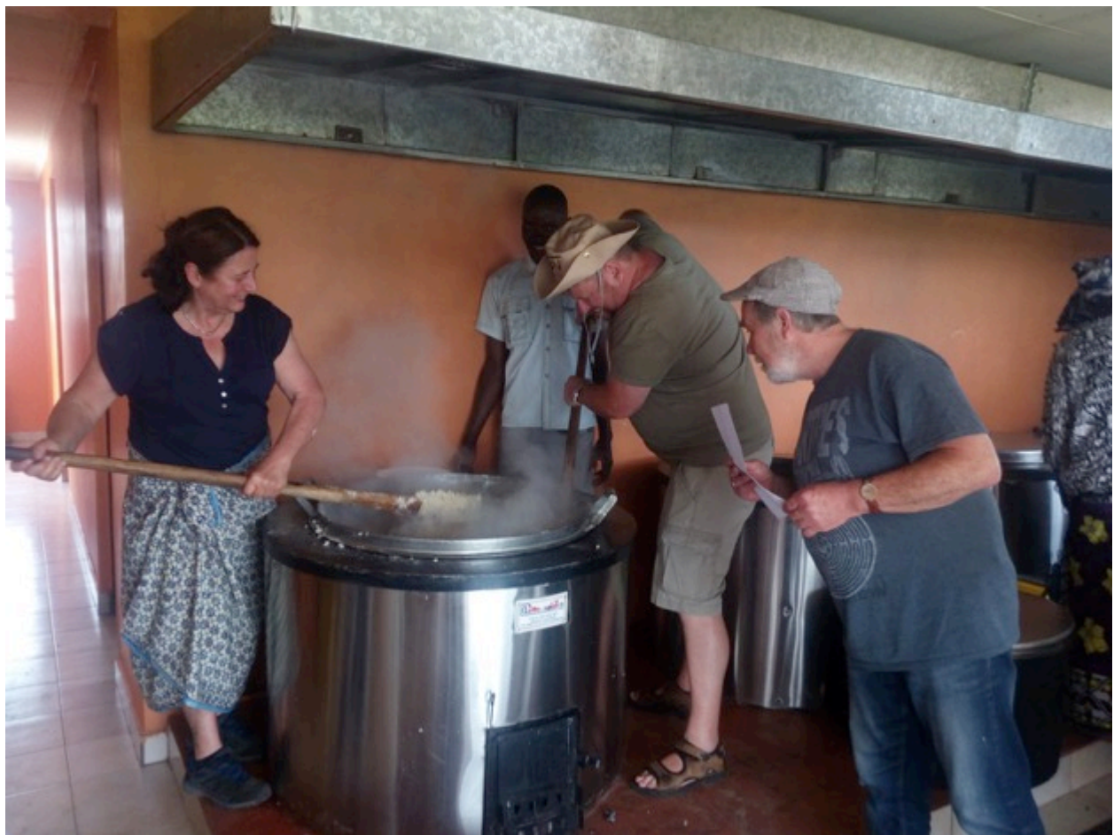
Visitors cooking ugali for children

They also came with presents for our children. Among them were the much appreciated sports uniforms from SpVgg Selb 13. They also brought presents for their sponsored families. They were impressed with the work we are doing in Nakuru.