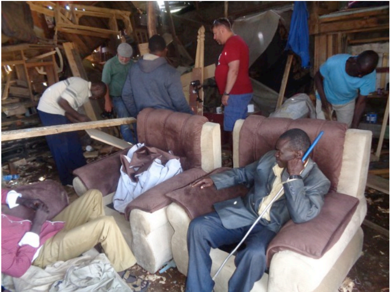
They also visited a workshop run by a blind parent