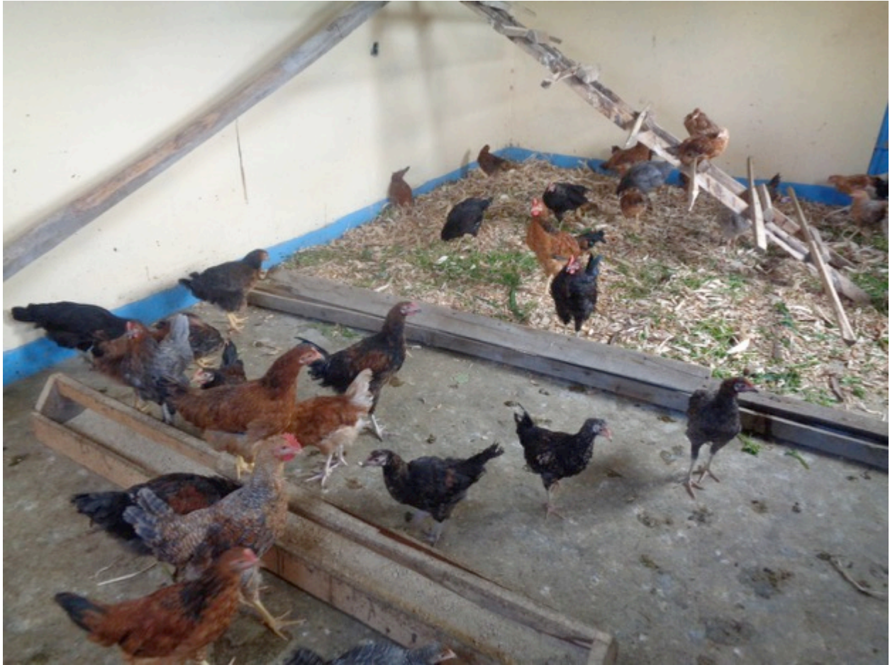
Esther Nanjala's parent is raising chickens