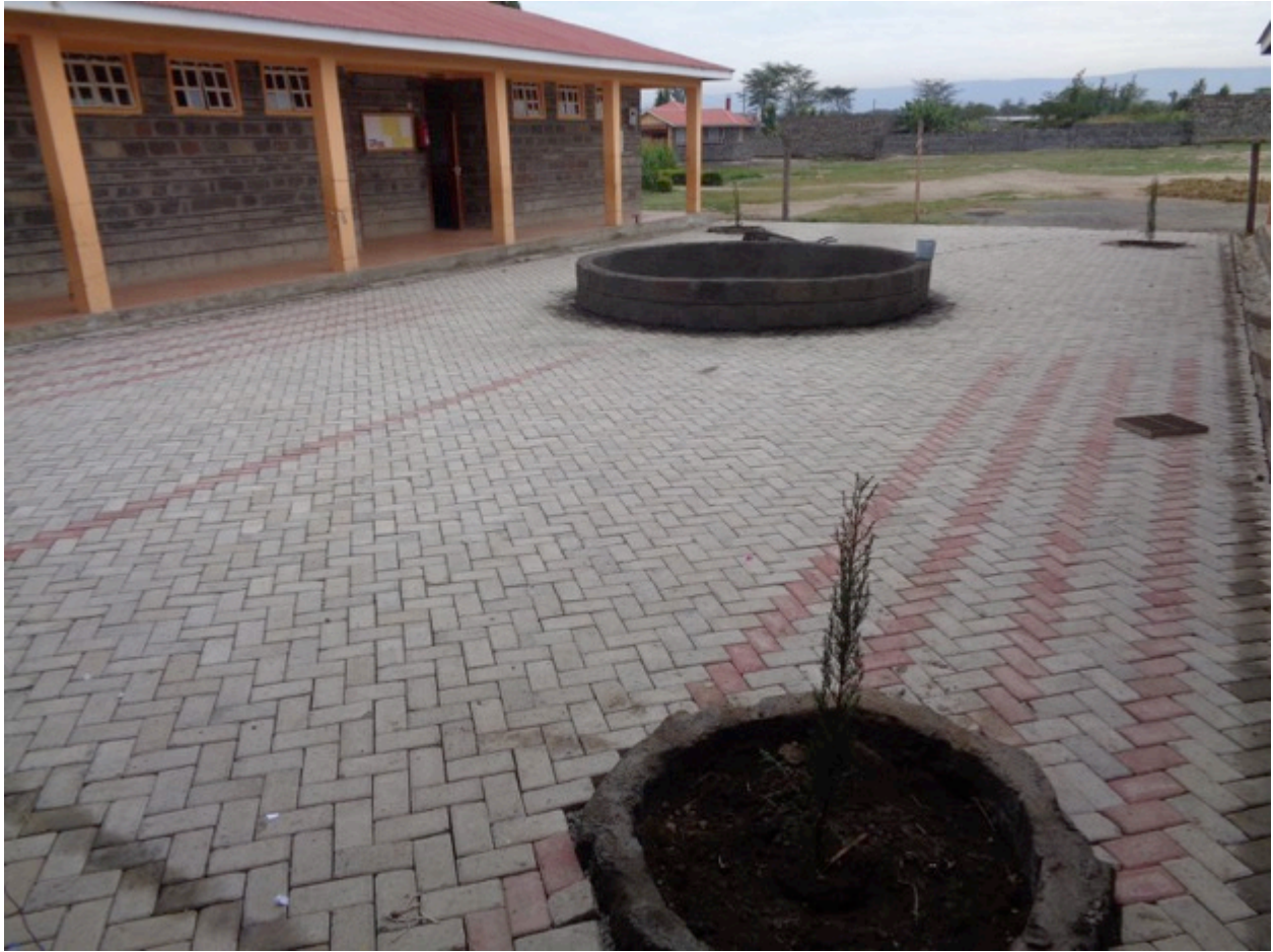
Photo above shows the finished courtyard with trees planted