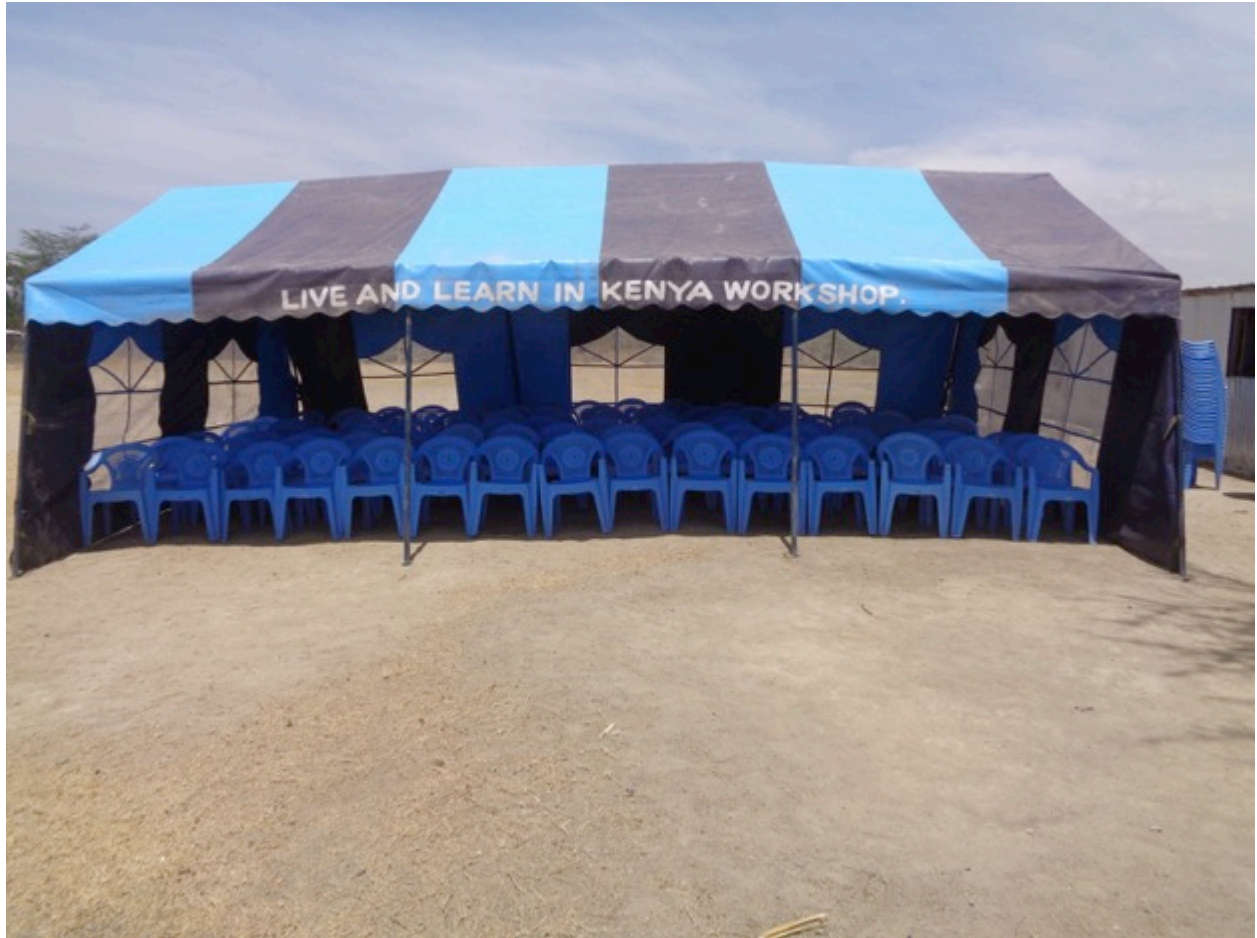
A tent and plastic chairs bought from tailoring profits