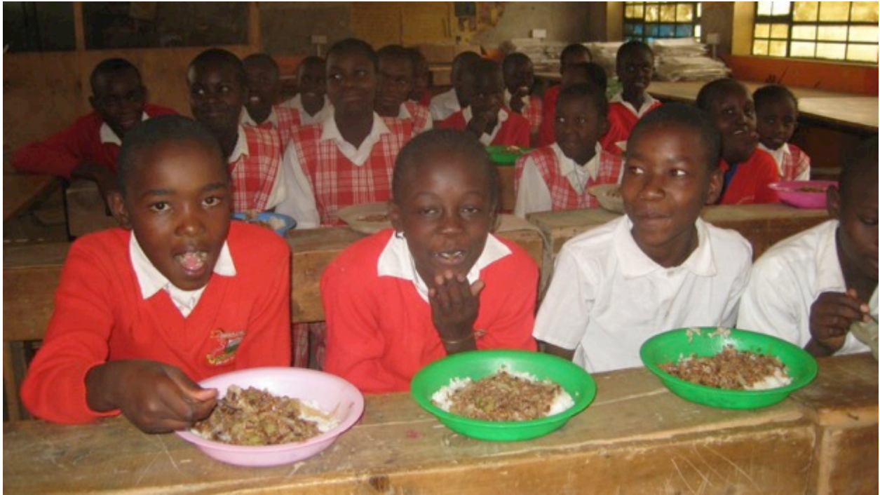
Children at Freehold primary having lunch

We are very grateful to our sponsors and donors for their generous support. Special thanks go to the Feed a Smile program and GlobalGiving .