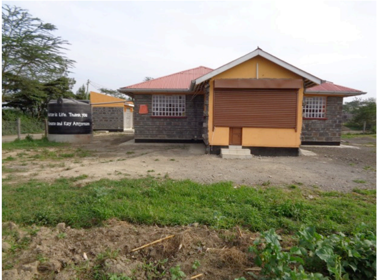
Our modern Kitchen with a 10,000 liter water tank

A 10,000 liter water tank was fitted to this kitchen for rainwater harvesting. This tank was donated by Renate and Kay Angermann. They are sponsors are also sponsoring 2 project children. We all appreciate this donation.