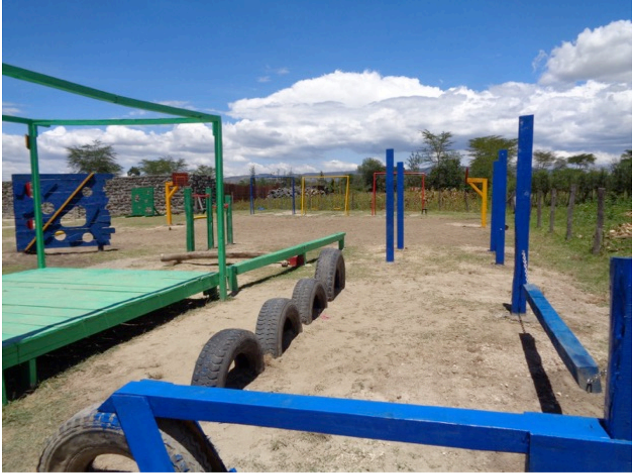
A completed playground