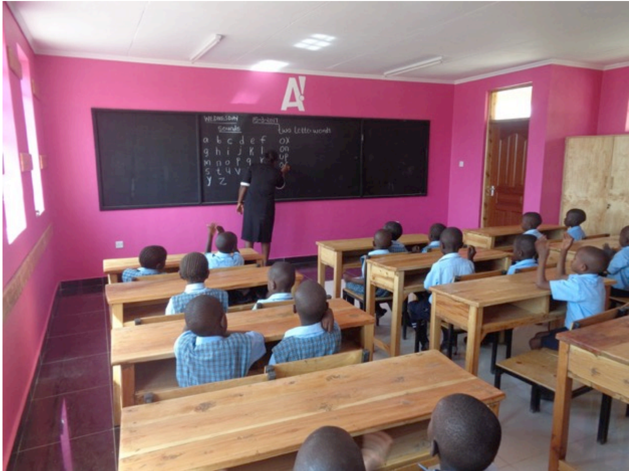
The 5 th grade classroom