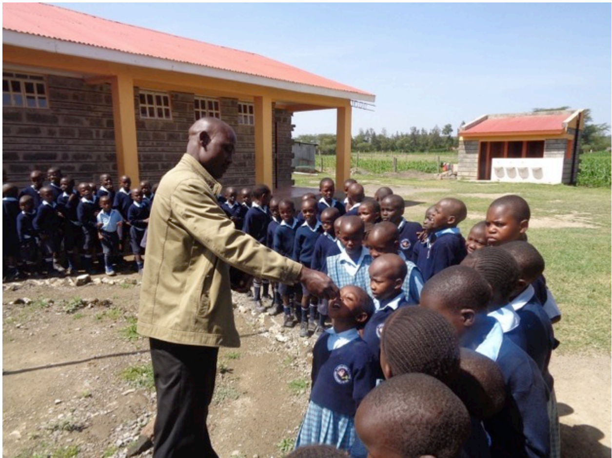
Public health officer giving de-worming tablets

There was a cholera outbreak in Nakuru and Nairobi in July. We invited a public health officer to come and give a workshop for both children and teachers. They were taught personal and environmental hygiene. After the workshop all children were de-wormed.