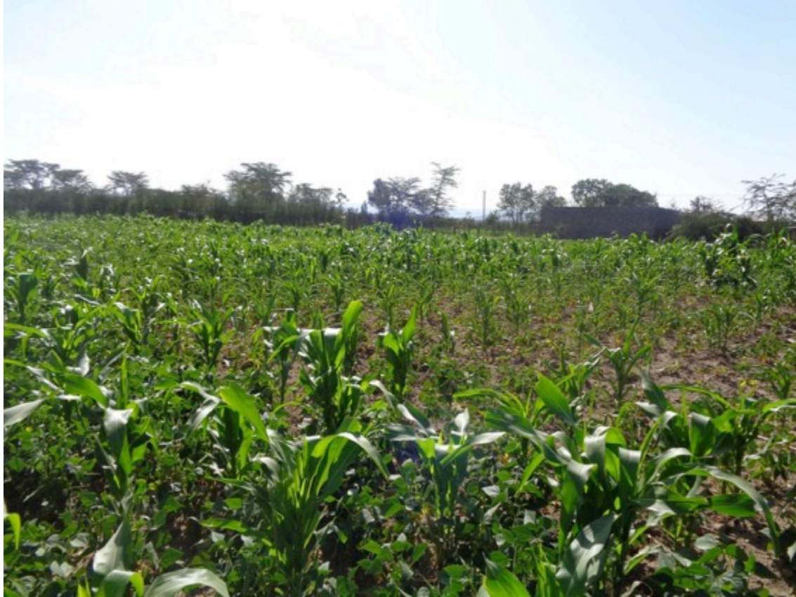
Maize and beans on our rented farmland. It is not doing well.