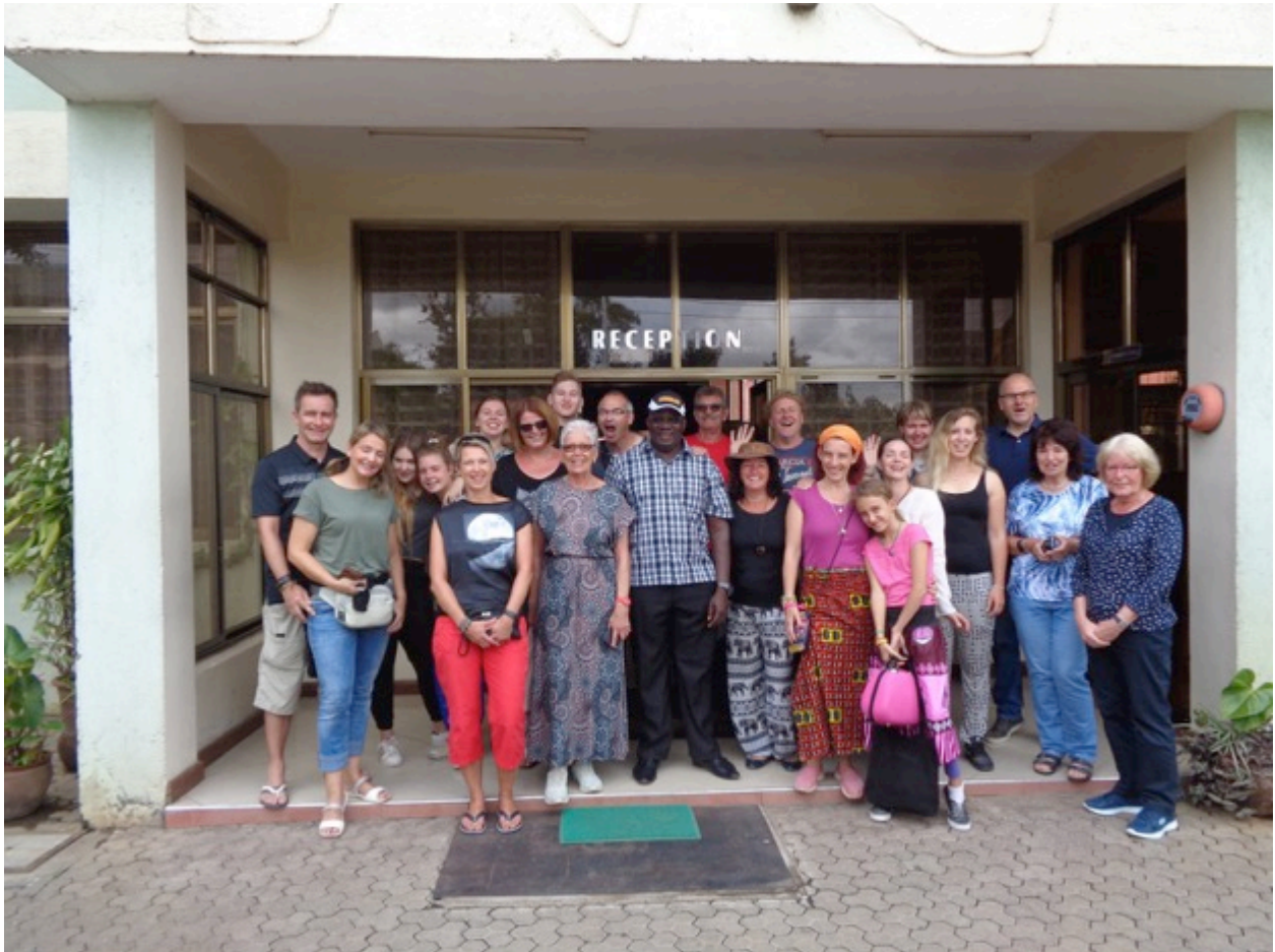
Happy visitors before leaving for Germany/the Netherlands

Every year on the last Friday of October we welcome our sponsors and donors from abroad.