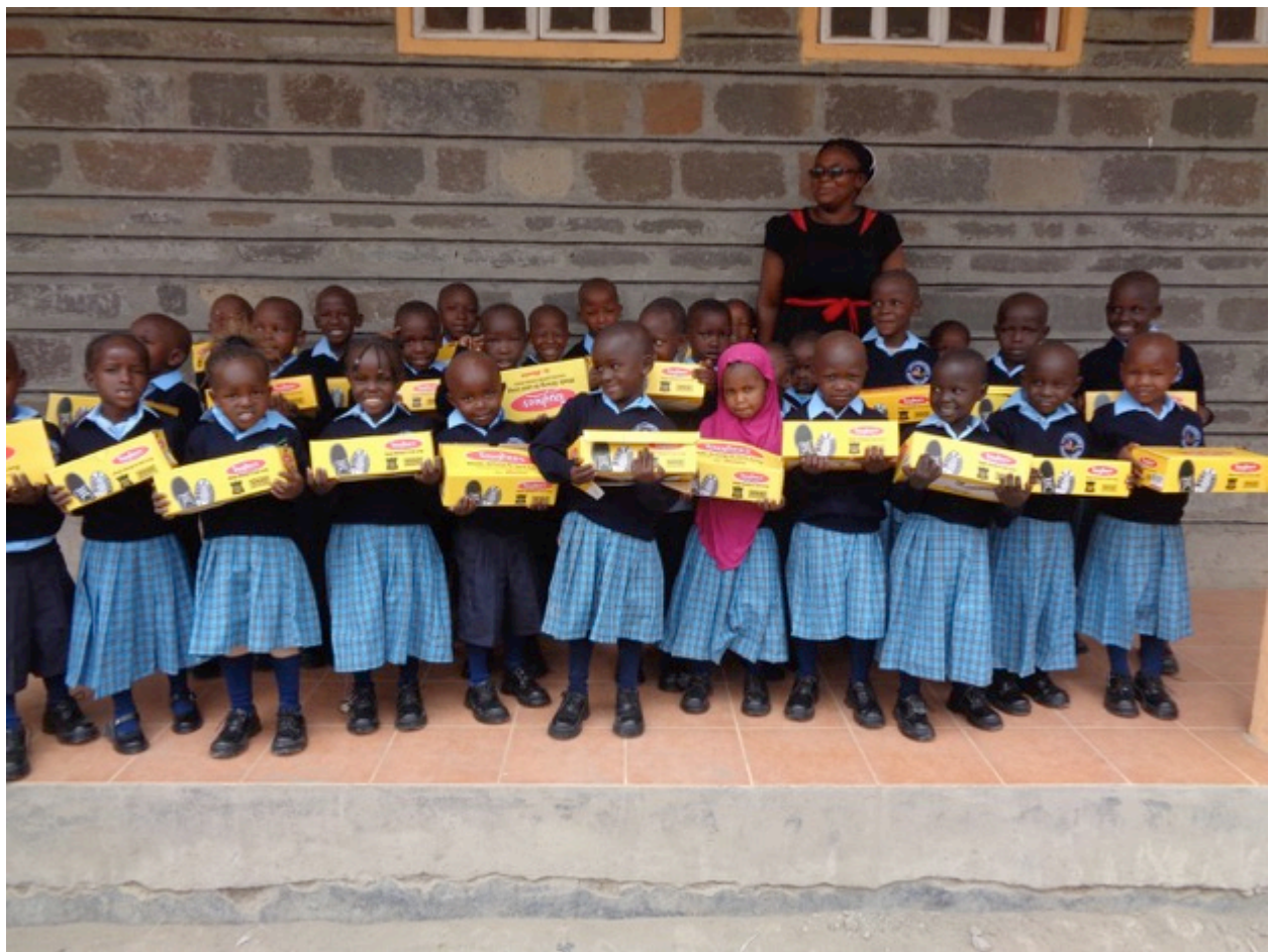
Kindergarten class pupils in their new uniform - including shoes