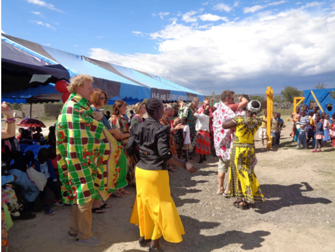
Time to give presents to visitors as a sign of appreciation