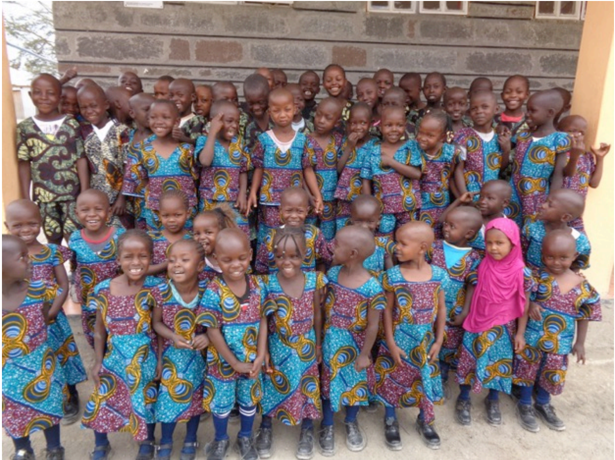
Original African attire that the LLK children wear on Fridays