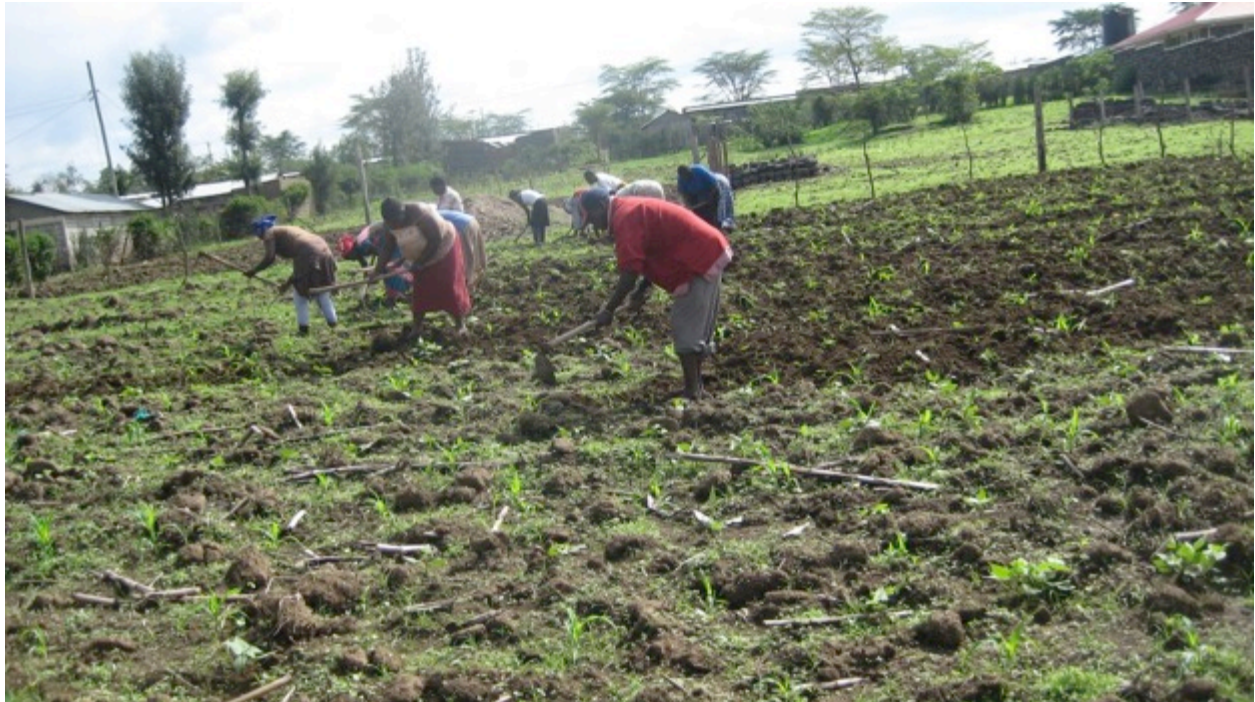
Parents weeding the rented farmland

Parents came, as usual, to plant and weed the farmland that we rent from our neighbors. Our youths also give a hand - especially at our school farm. They plant and weed vegetables.