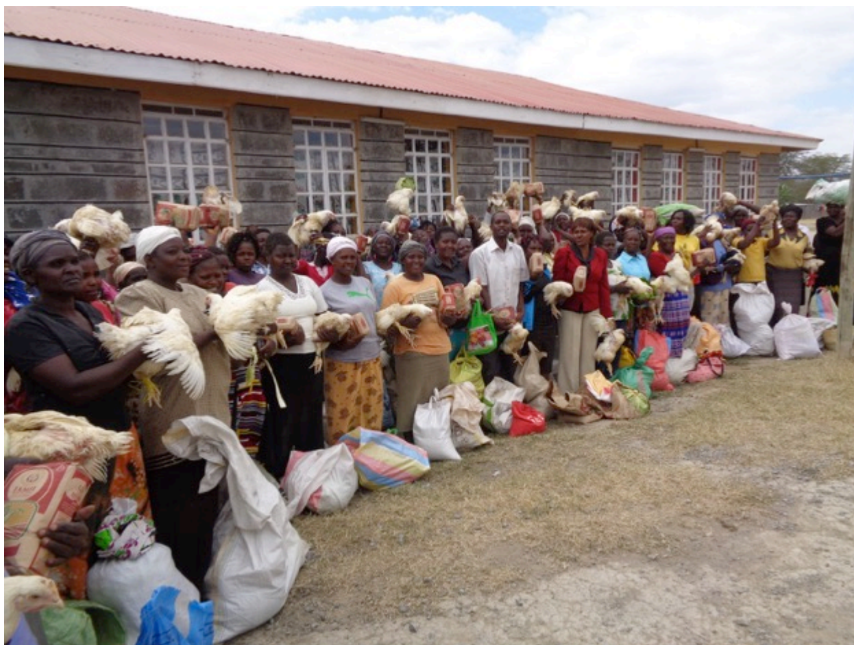
Happy parents/guardians with their Christmas presents