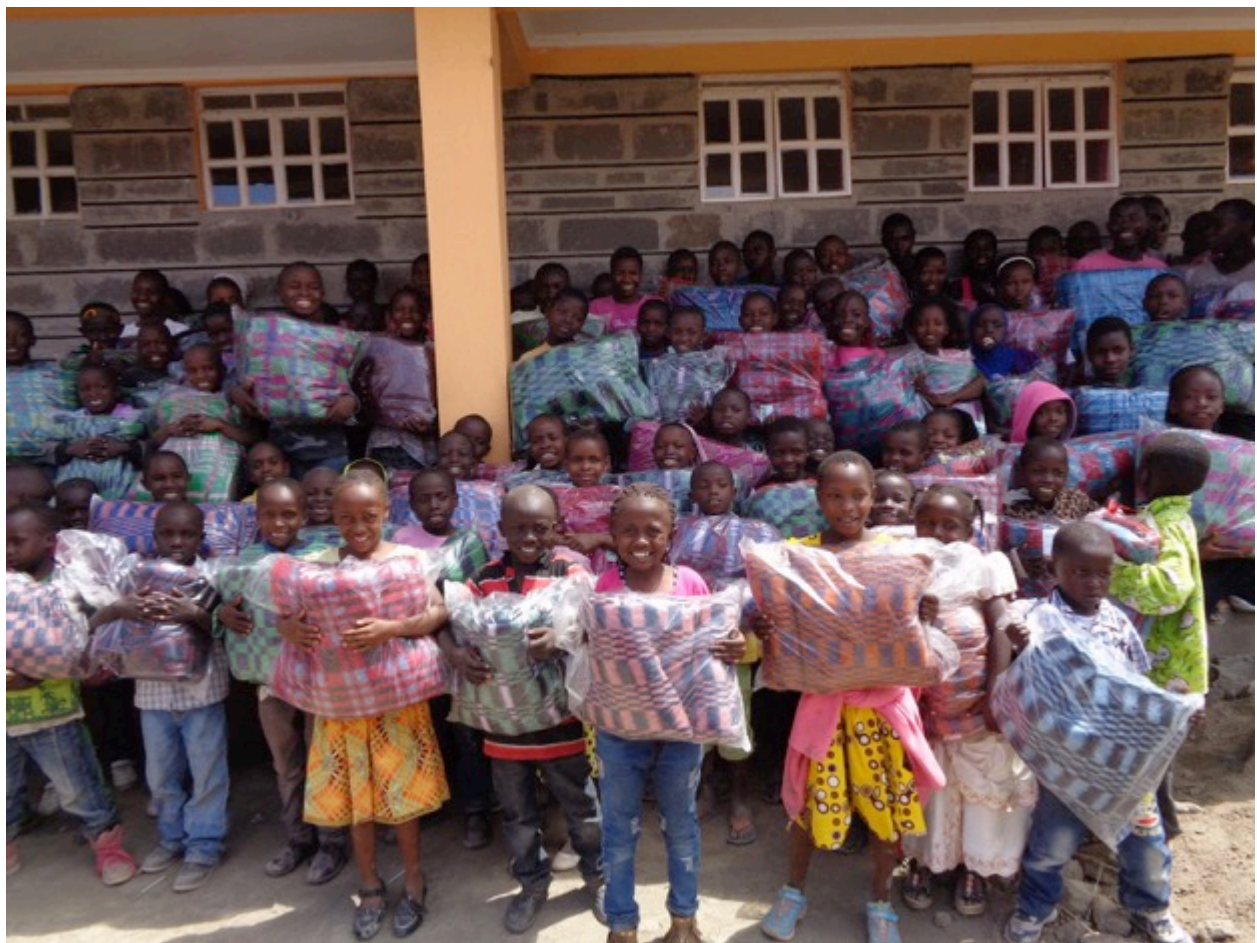
Children with their warm blankets