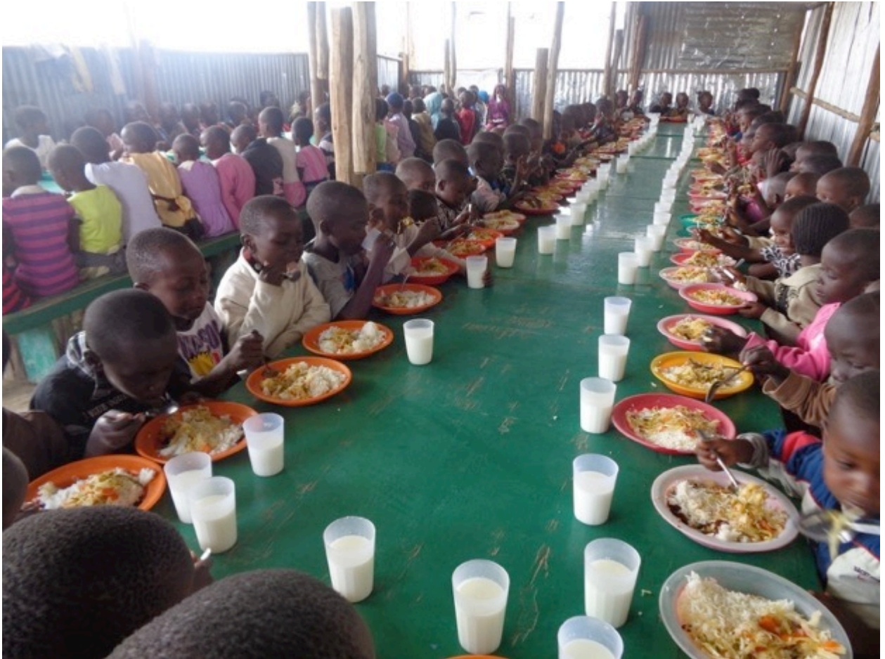
Our children enjoying a meal at our center