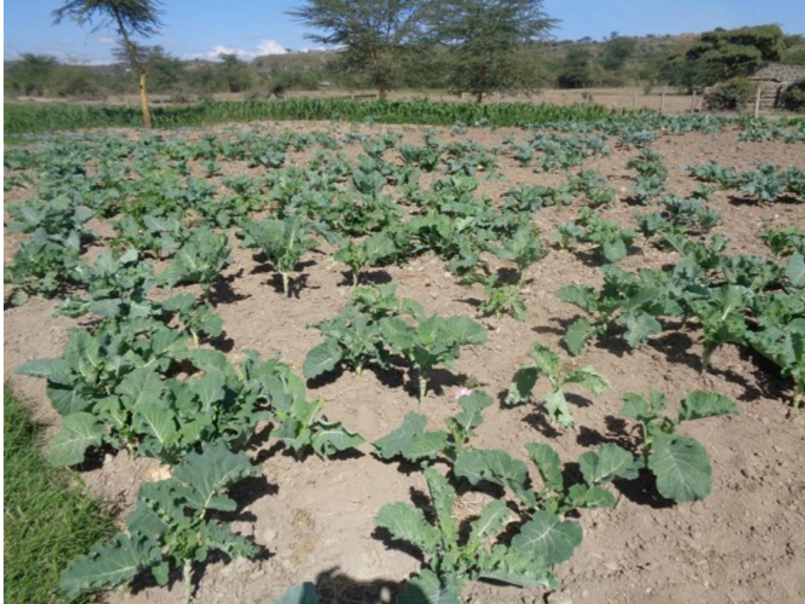
Vegetables planted by our youths at our school farm