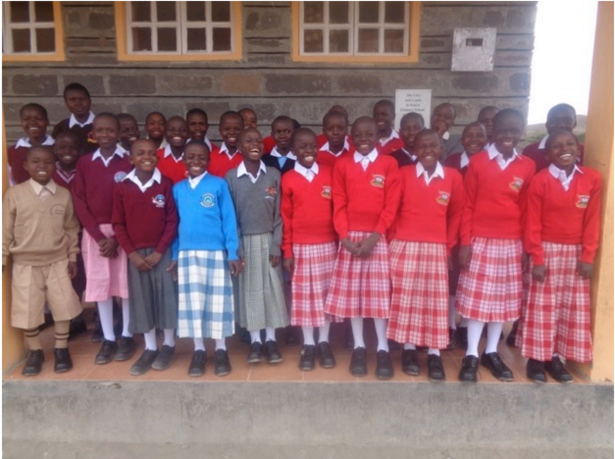
Children going to public schools in their respective school uniform

In the process of making school uniforms and other clothes, these youths earn a profit. They have managed to use this profit to buy 200 plastic chairs and 2 tents with a capacity of 100 people each. This saves us the costs of renting tents and chairs whenever we have visitors or larger events/activities.