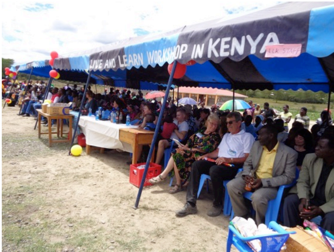
Guests seated during the big party