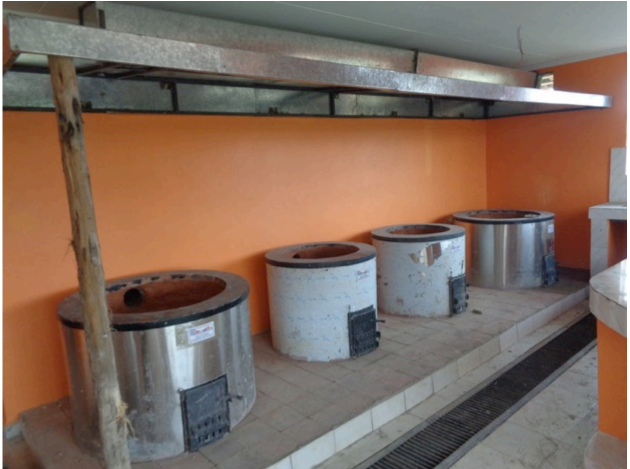
The inside of our kitchen (steam hood being fixed)