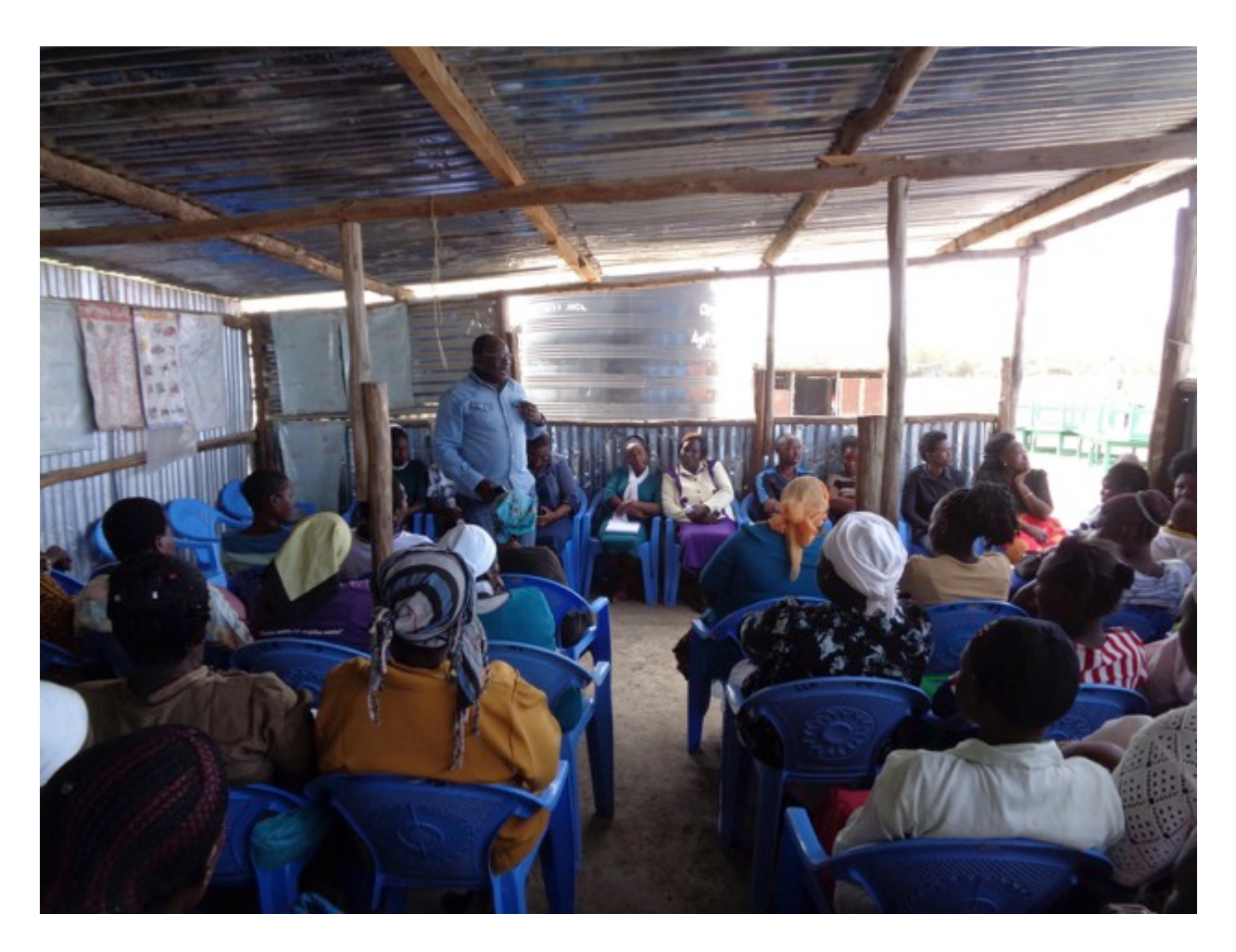
Parents and LLK staff listening to the project manager