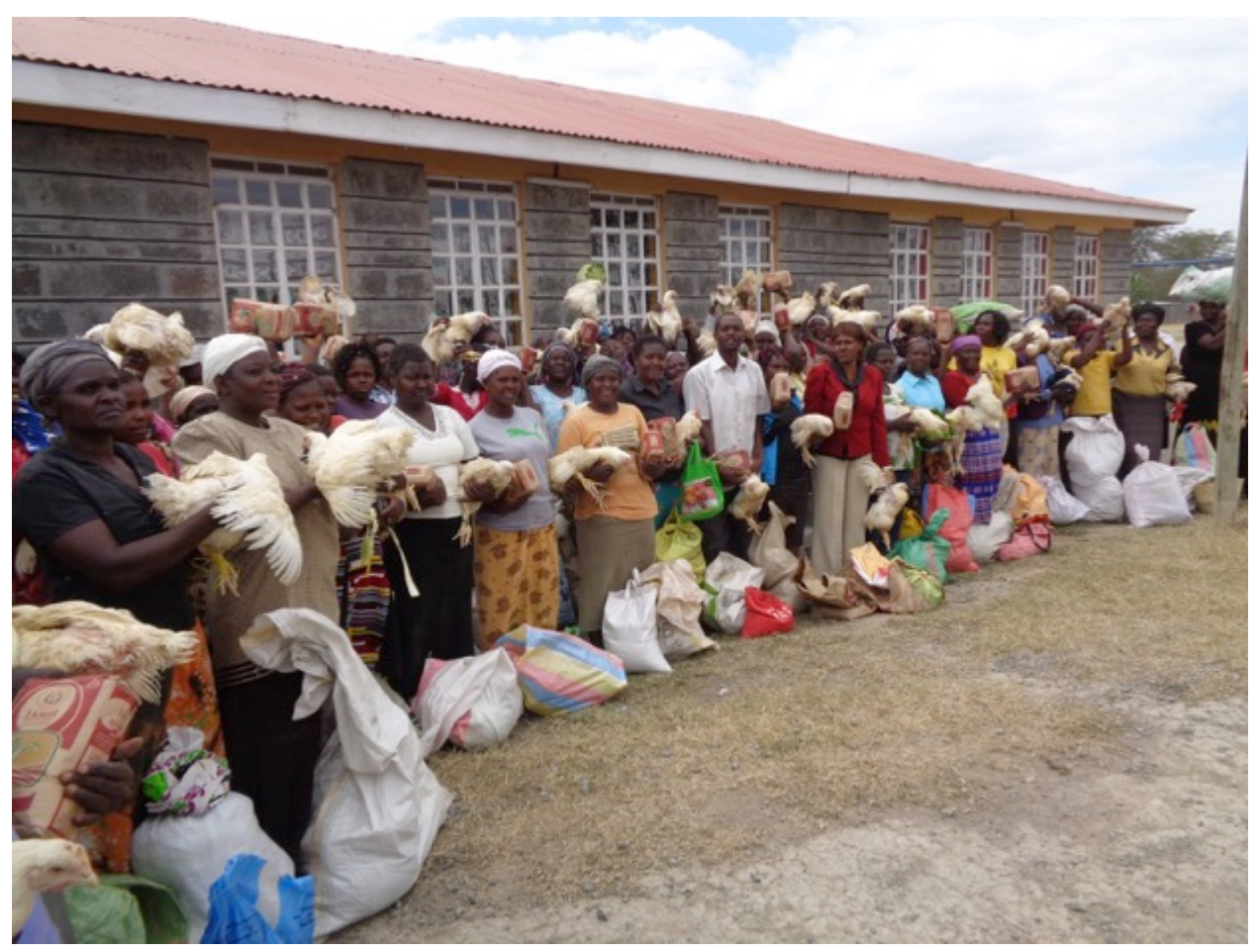
Happy parents/guardians with their Christmas presents