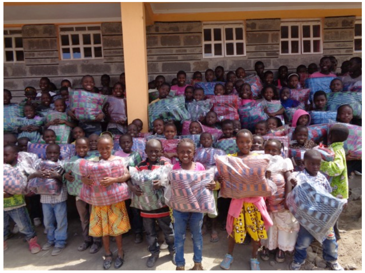
Children with their warm blankets

Both parents and children were very grateful for the presents and thanked sponsors and donors from around the world, especially from Germany and other parts of Europe and the USA. They danced on streets of Nakuru in praise of LLK.