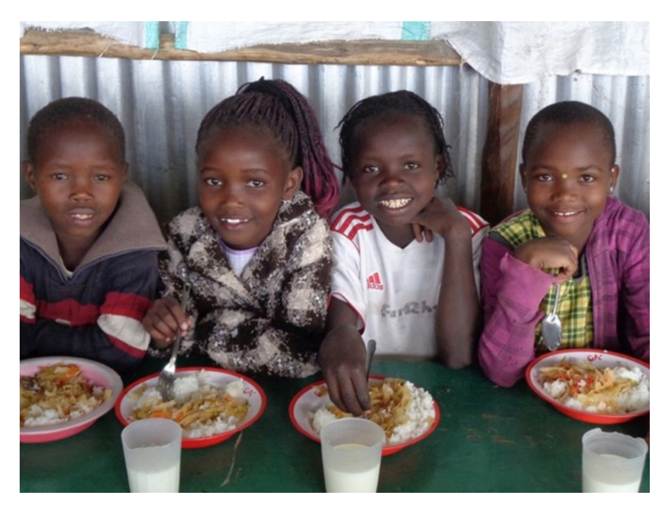
Children enjoying a meal after classes