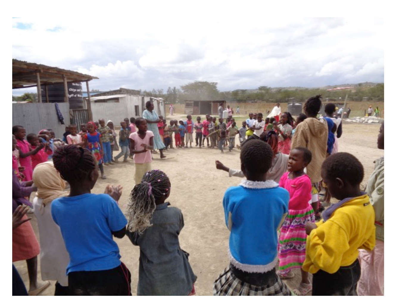
Children playing games after classes