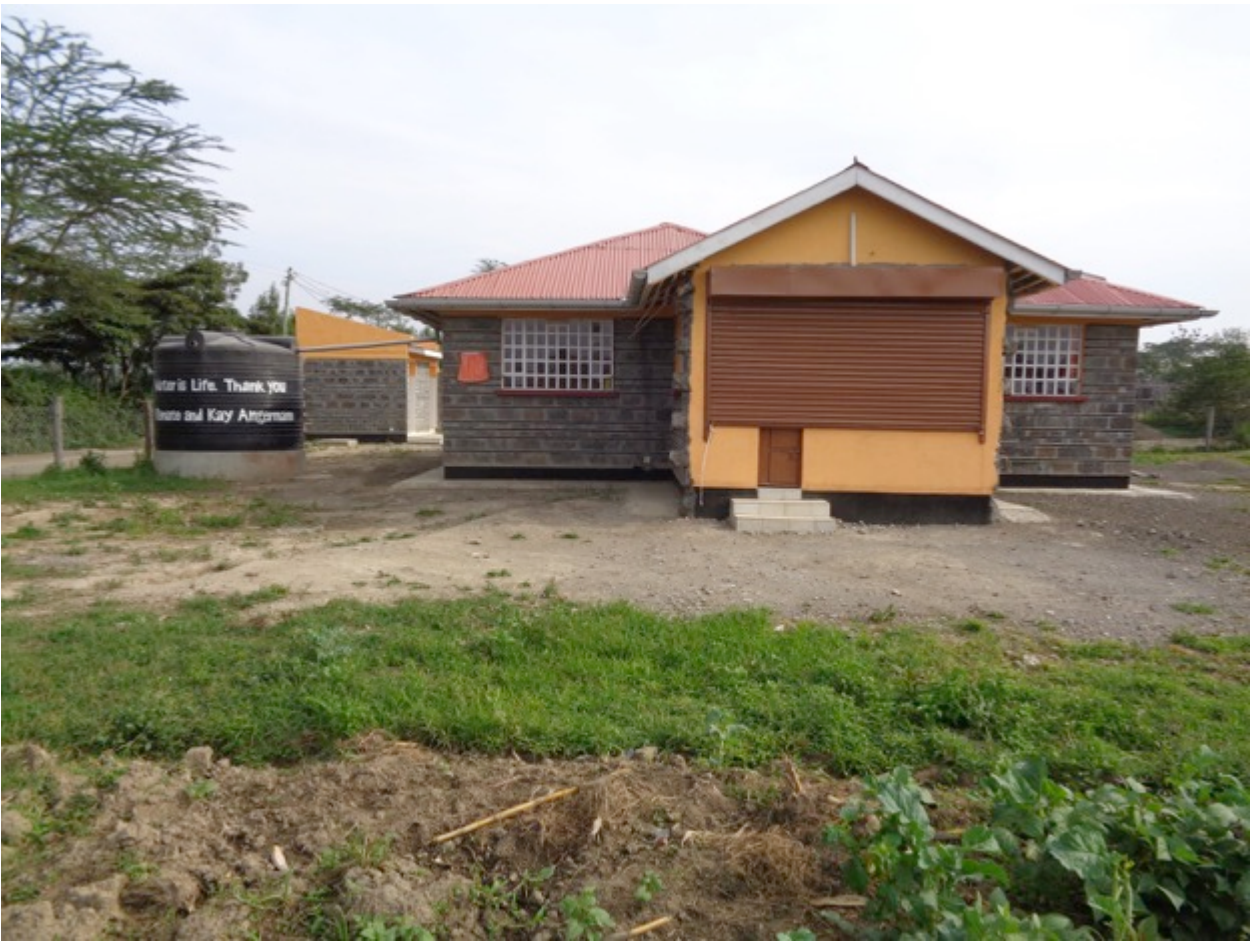
A completed modern kitchen

A 10,000 liter water tank was fitted to this kitchen for rain water harvesting. This tank was donated by Renate and Kay Angermann. These are sponsors to our project children. We all appreciated this donation.