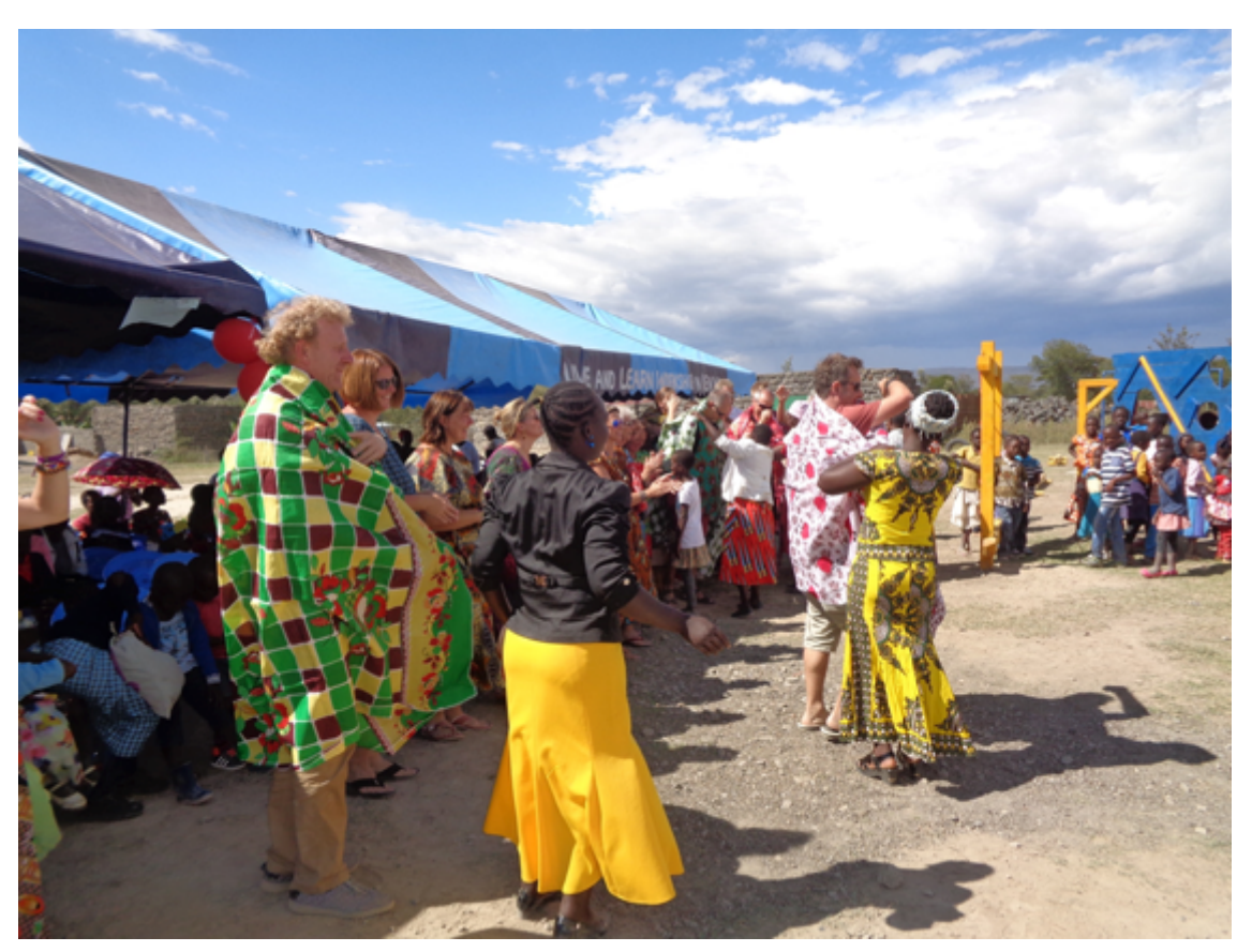
Time to give presents to visitors as a sign of appreciation