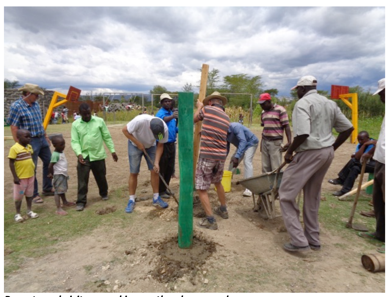
Parents and visitors working on the playground

Angermann). He spent more than 1,000€ on material and a lot of skilled preparation and labor. Visitors were joined by male parents and our youths to do the work, which took the 4 days to complete.