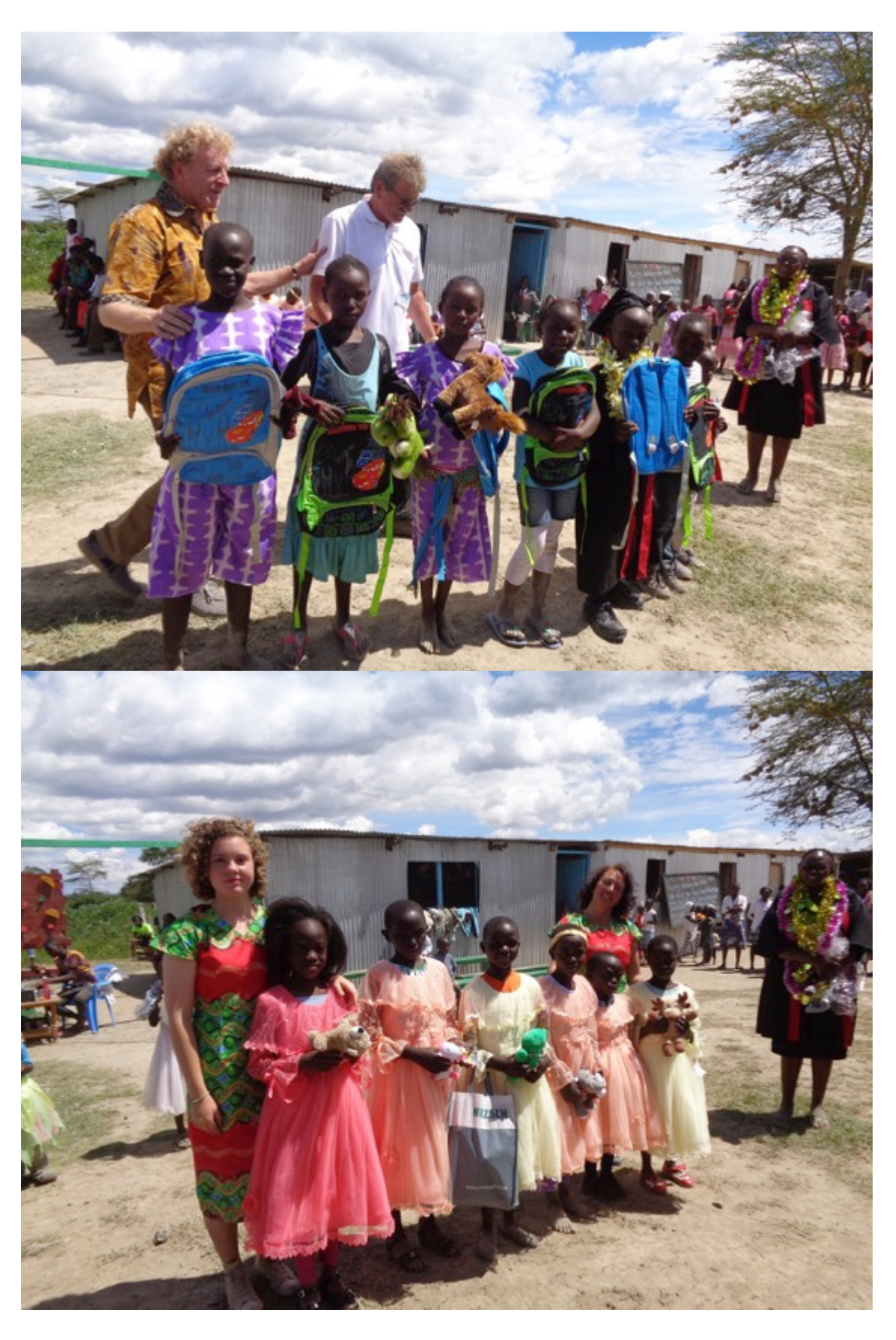
Top performing children receiving presents from visitors