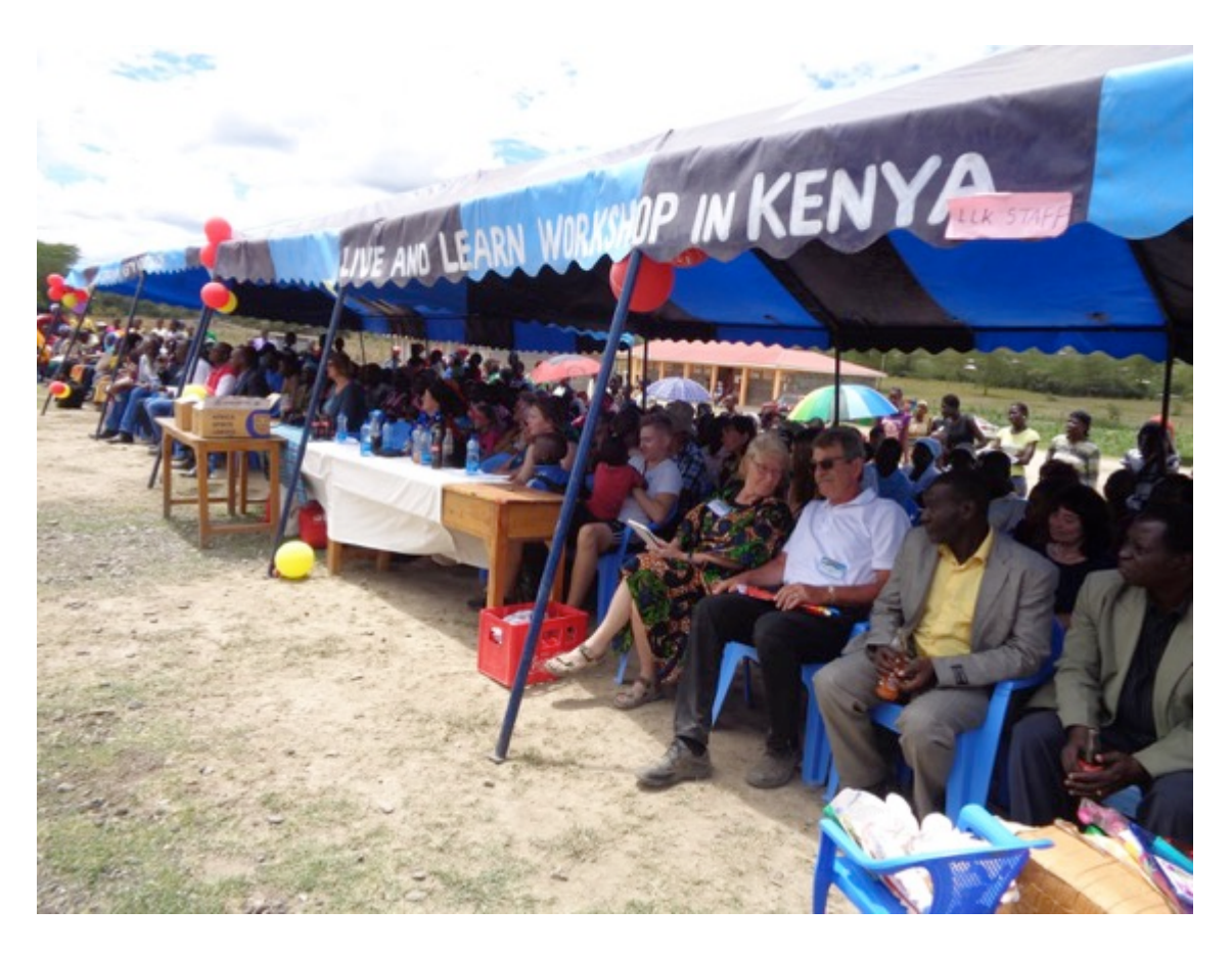
Guests seated during the big party