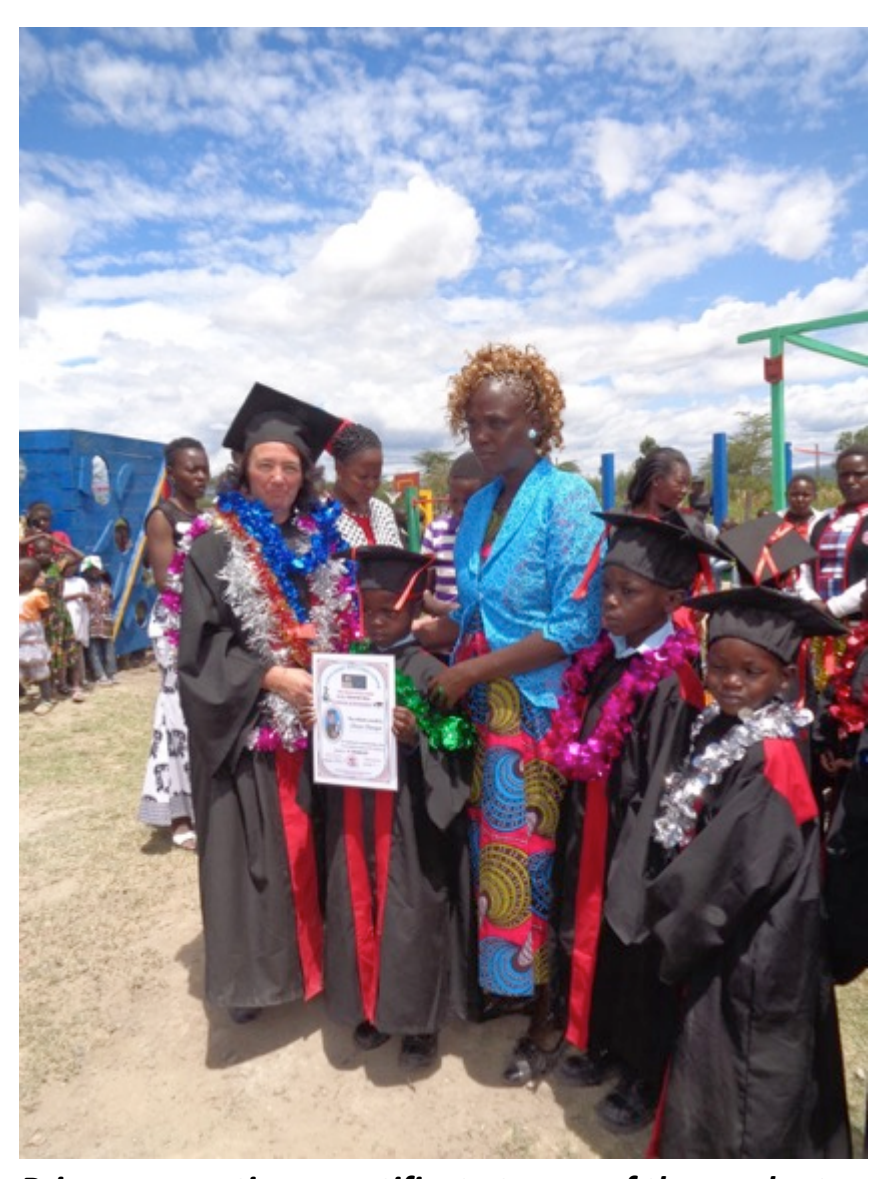
Brique presenting a certificate to one of the graduates