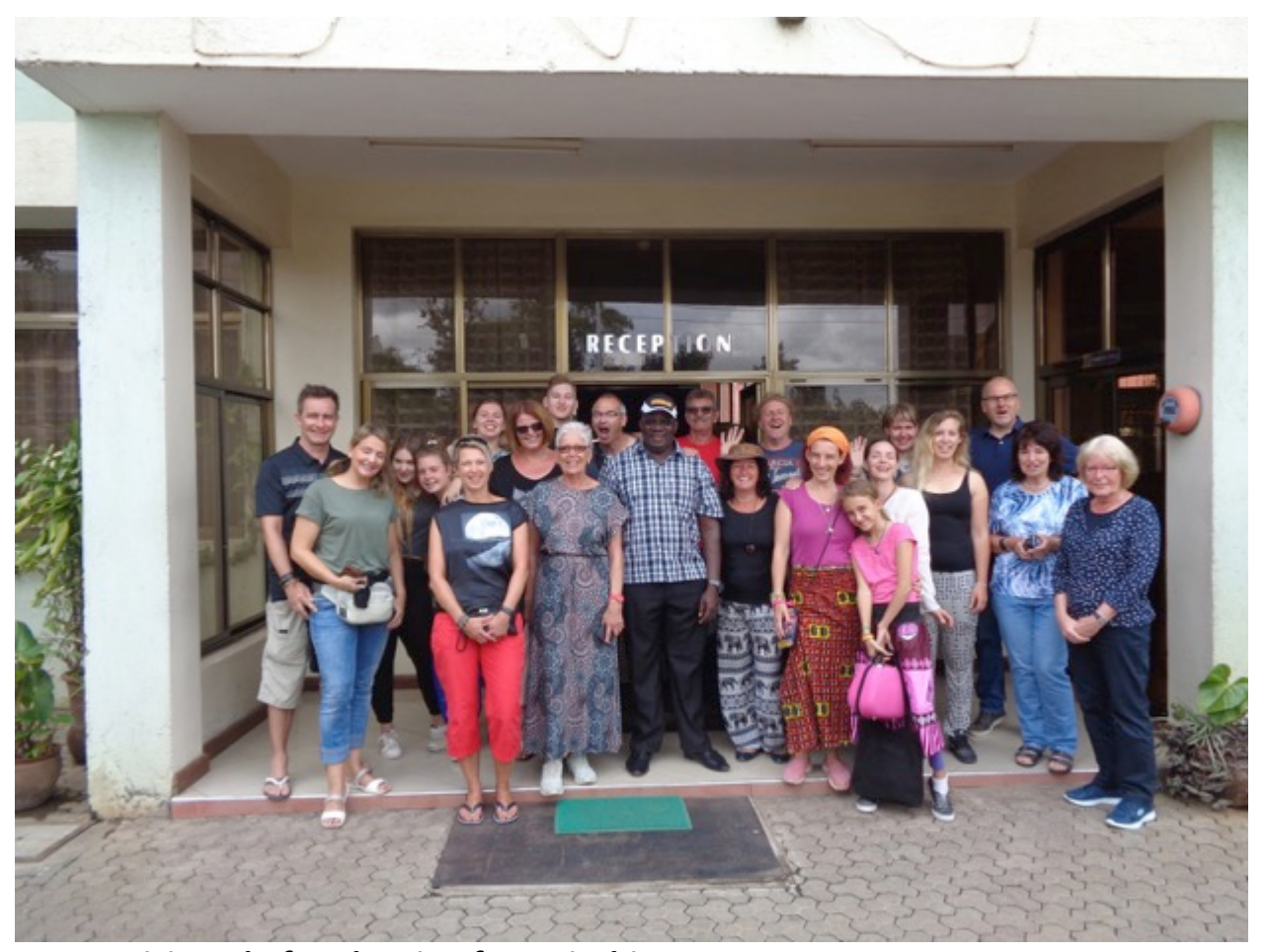
Happy visitors before leaving for Nairobi

Every year in October, last Friday of October to be precise, we receive our sponsors and donors from different parts of Europe.