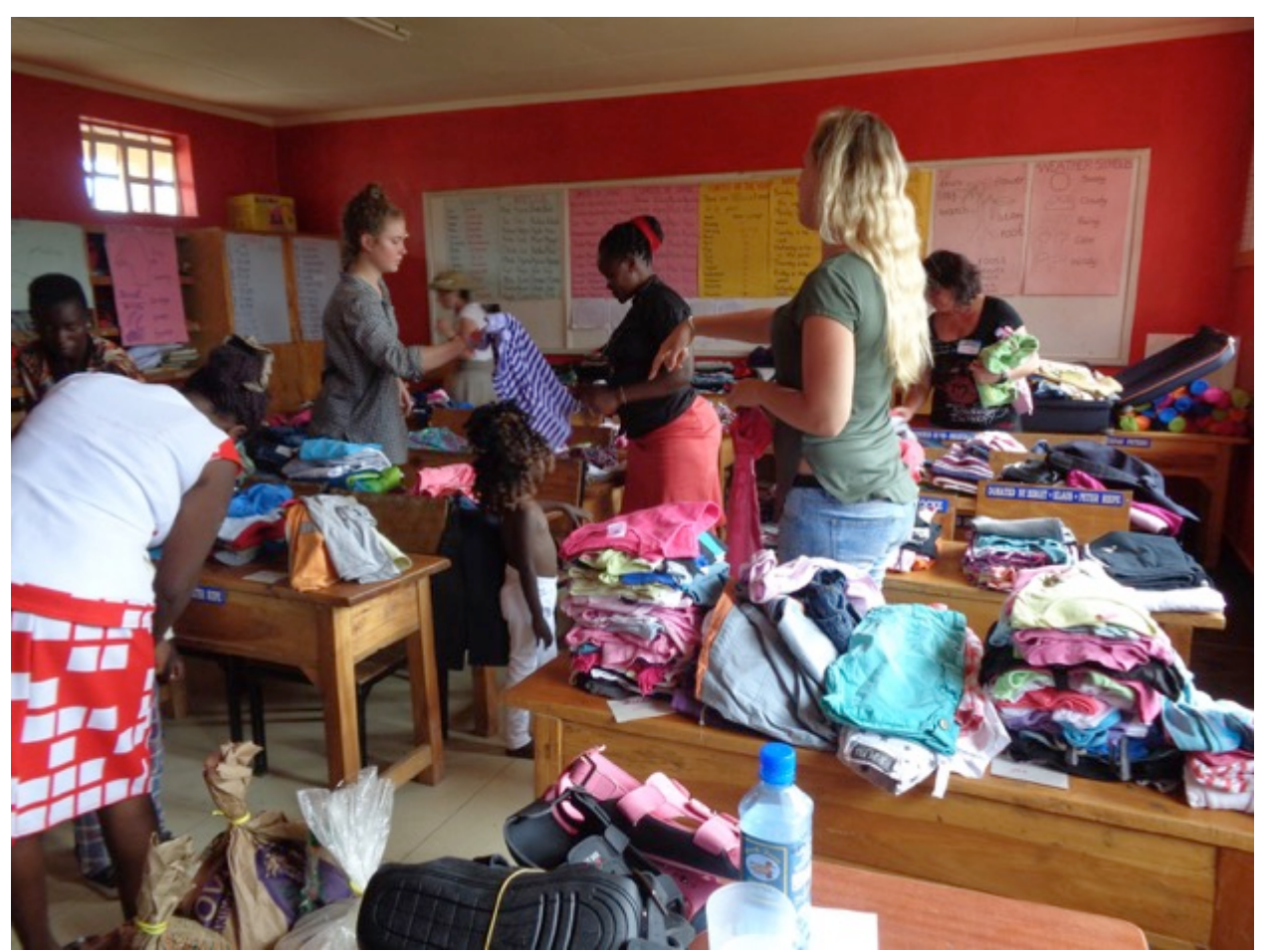
Visitors came with lots of presents for our project children.