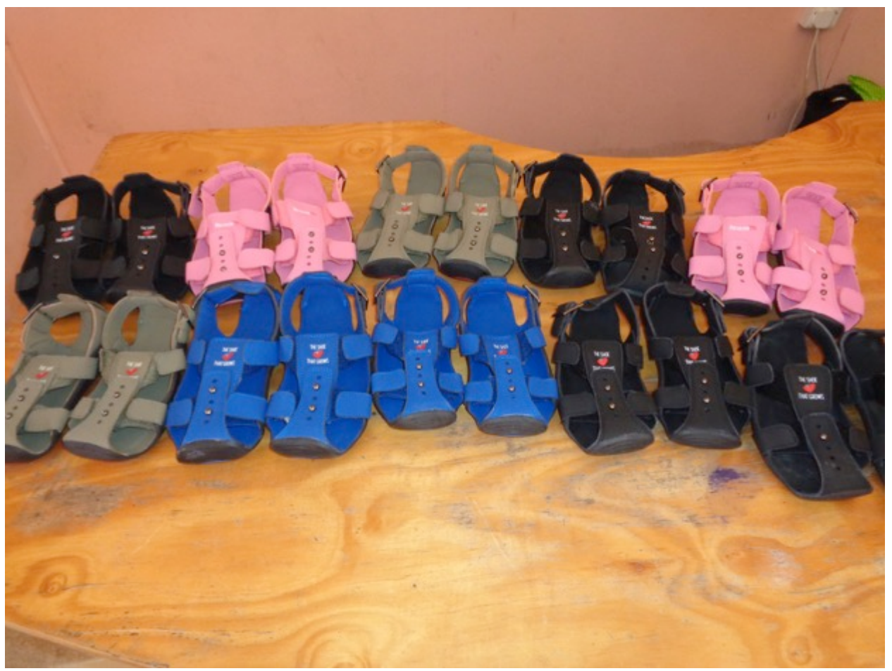
The Shoes That Grow – produced by a non-profit organization in the USA and are now also being produced in Africa with a warehouse in Nairobi.

On behalf of our children, parents, LLK staff and my own behalf, I thank all visitors from Germany and Holland who came to celebrate our 10<sup>th</sup> anniversary since establishing Live and Learn in Kenya International with us. I am also grateful to donors and sponsors who contributed towards kitchen and classroom construction. God bless them all.