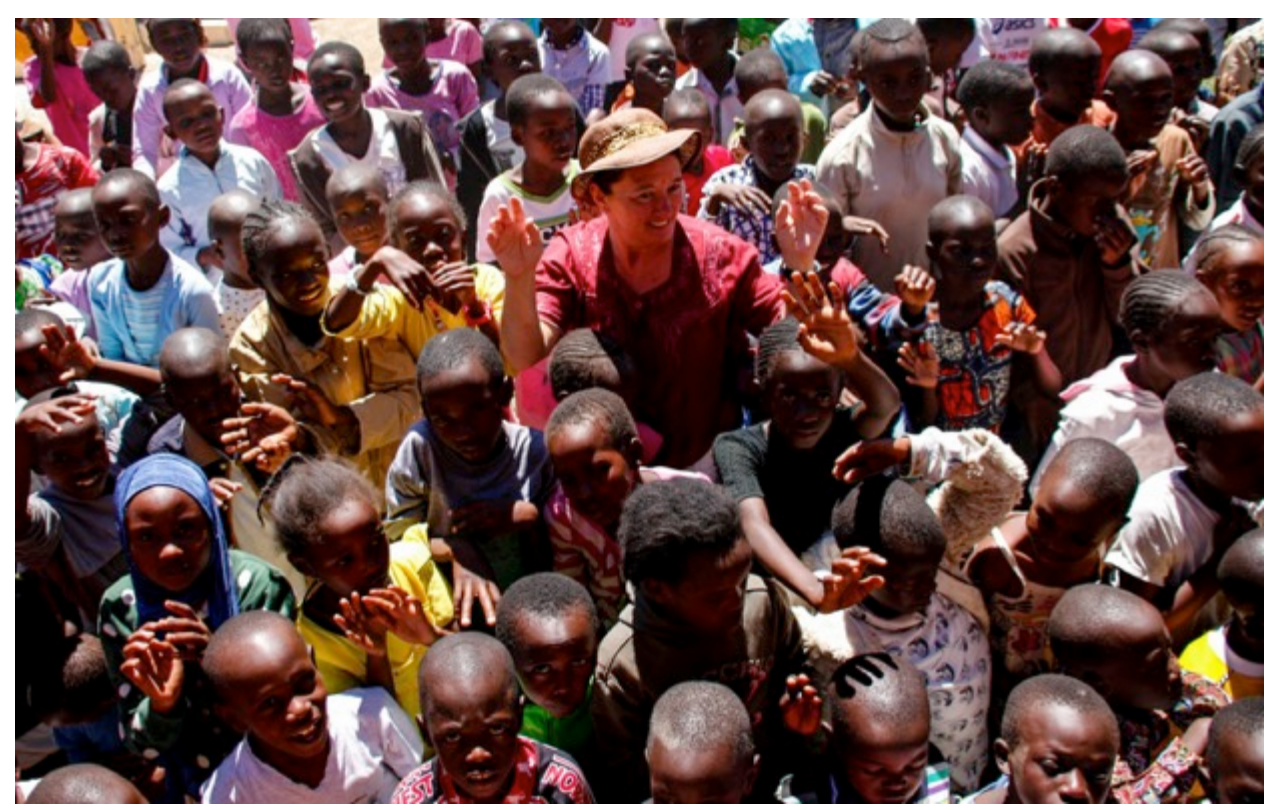
Children getting a feeling of Mama Brique