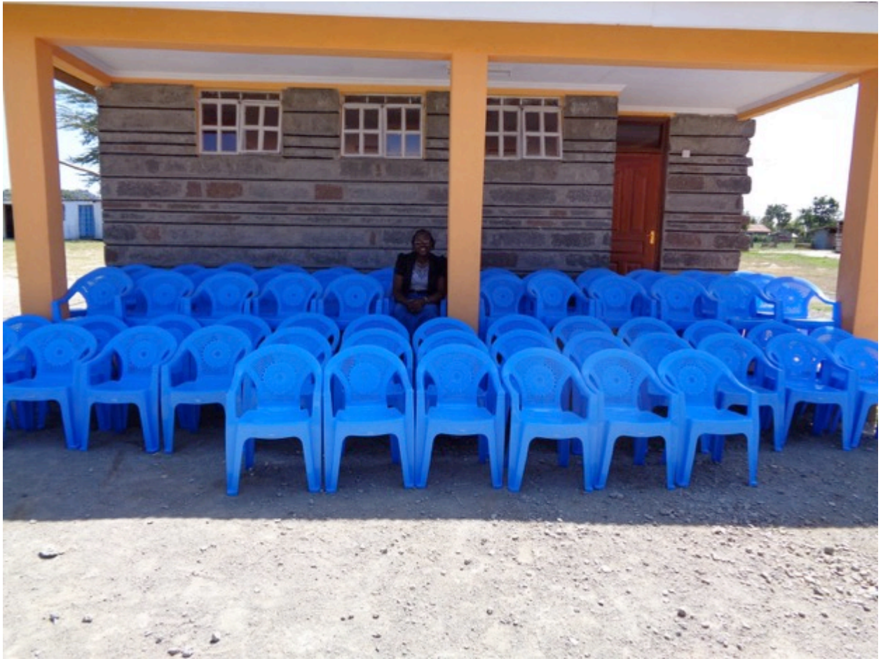
70 plastic chairs bought from workshop profits