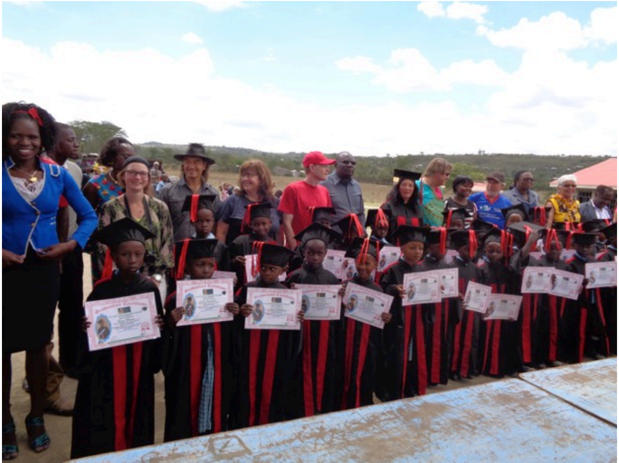
Top class graduation ceremony on 7 th November