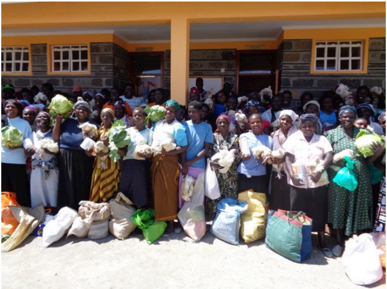
Parents happy to receive their Christmas presents - Their smiles tell it all!

Parents received the food on December 21st and children received theirs on December 23 rd - just before we closed the project for Christmas. Both parents and children were very happy to receive their presents. The parents were singing and dancing through the streets of Ronda slums while taking their families' food home. They thanked our sponsors for their generosity and wished them a Merry Christmas and a happy New Year