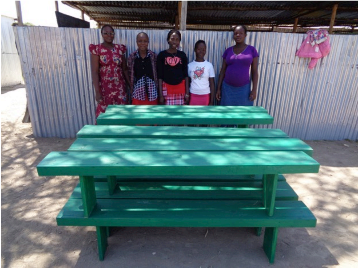
Benches bought from tailoring profit