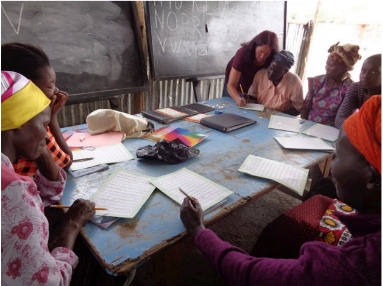
A parent's class in session