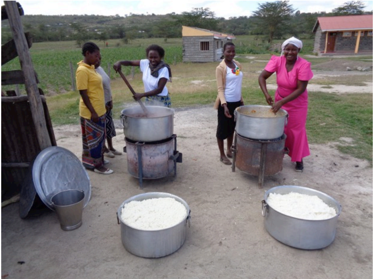
Parents preparing a meal on a weekend