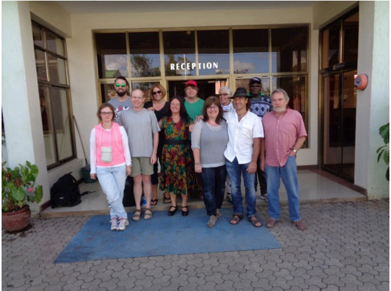
A photo of sponsors who visited this year