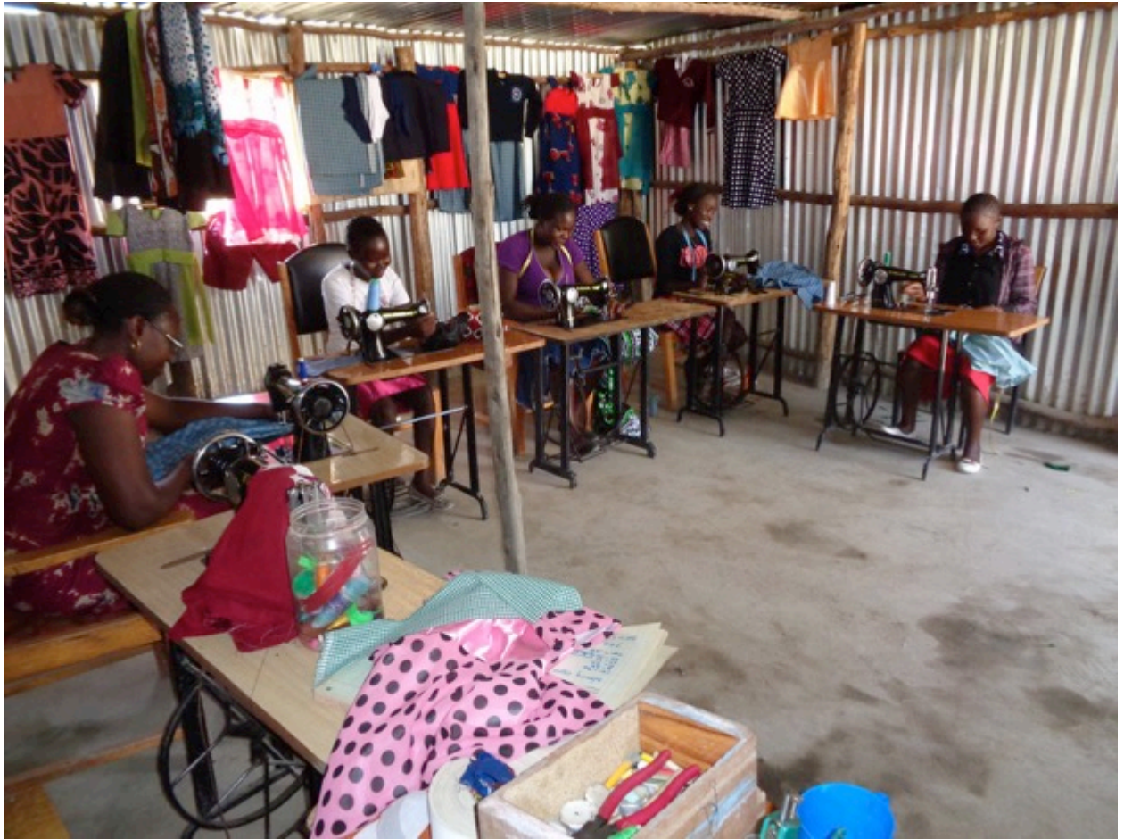
Work in progress in our tailoring workshop