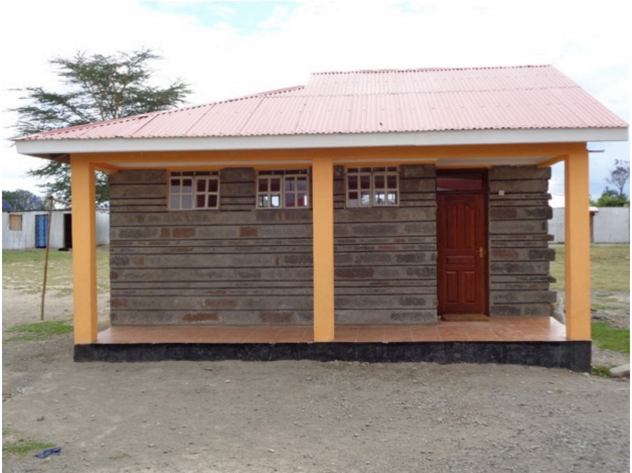
A completed class 3