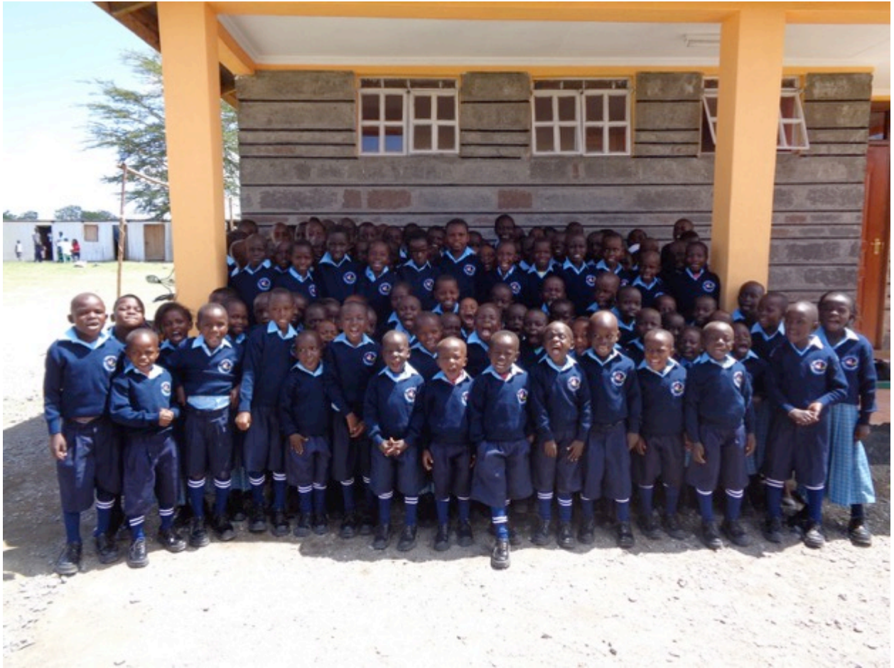
Children in uniform made from our workshop