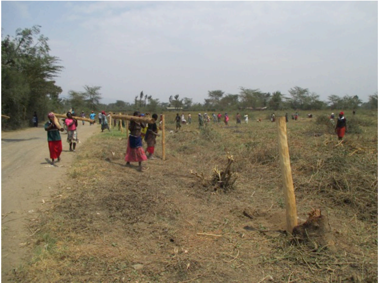
Parents clearing and fencing our school