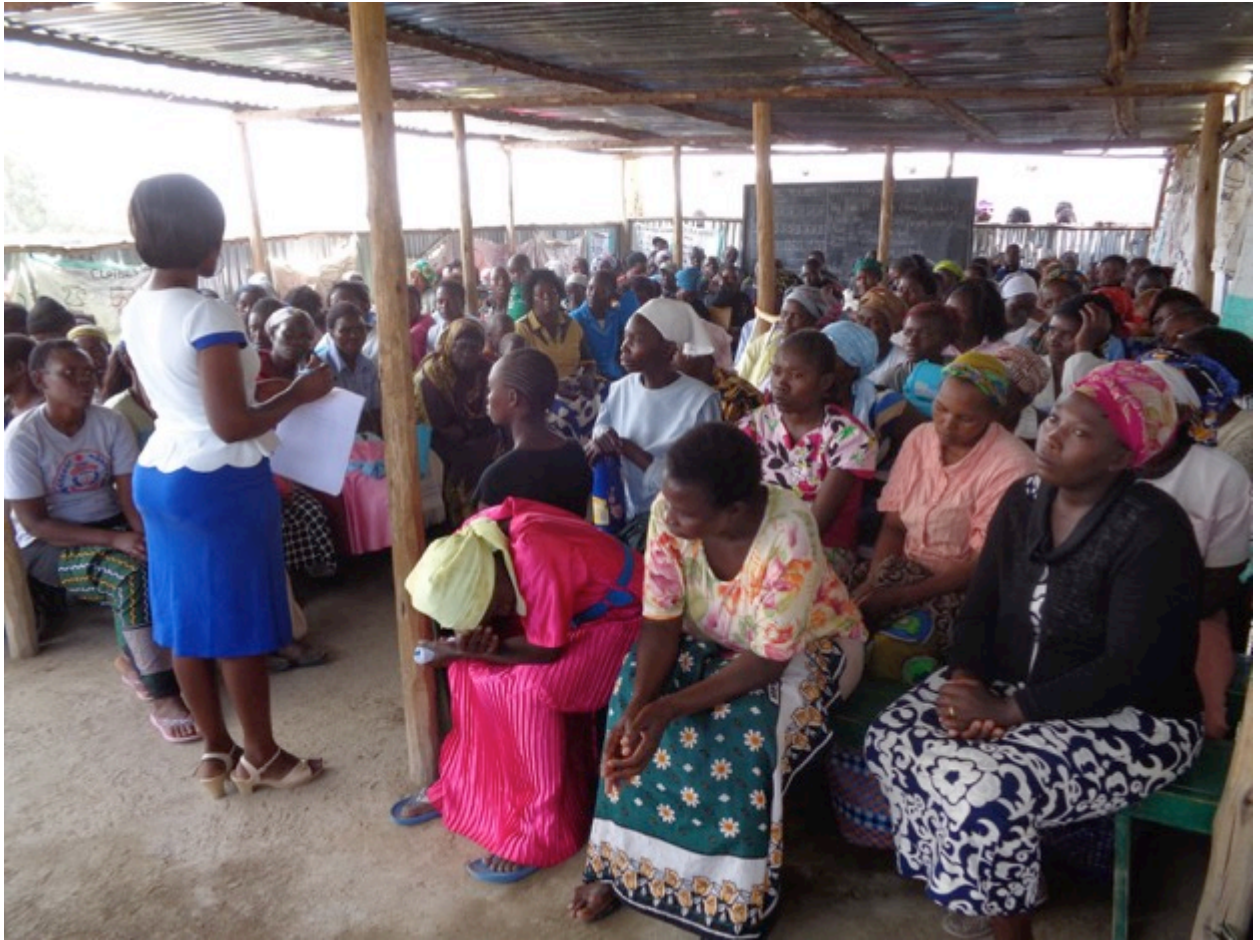
The Live and Learn in Kenya head teacher talking during a parent's meeting.