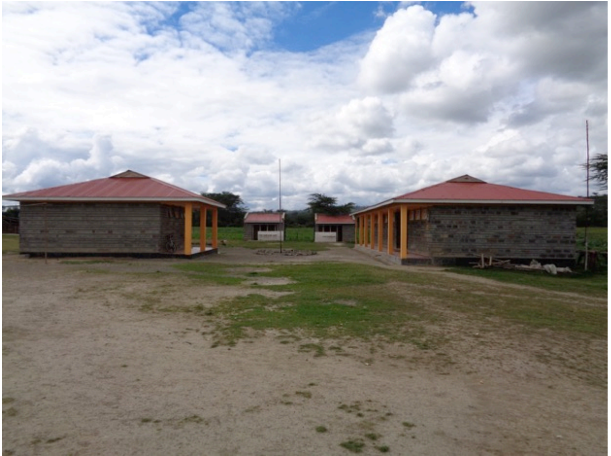
This is the Live and Learn in Kenya Education Centre