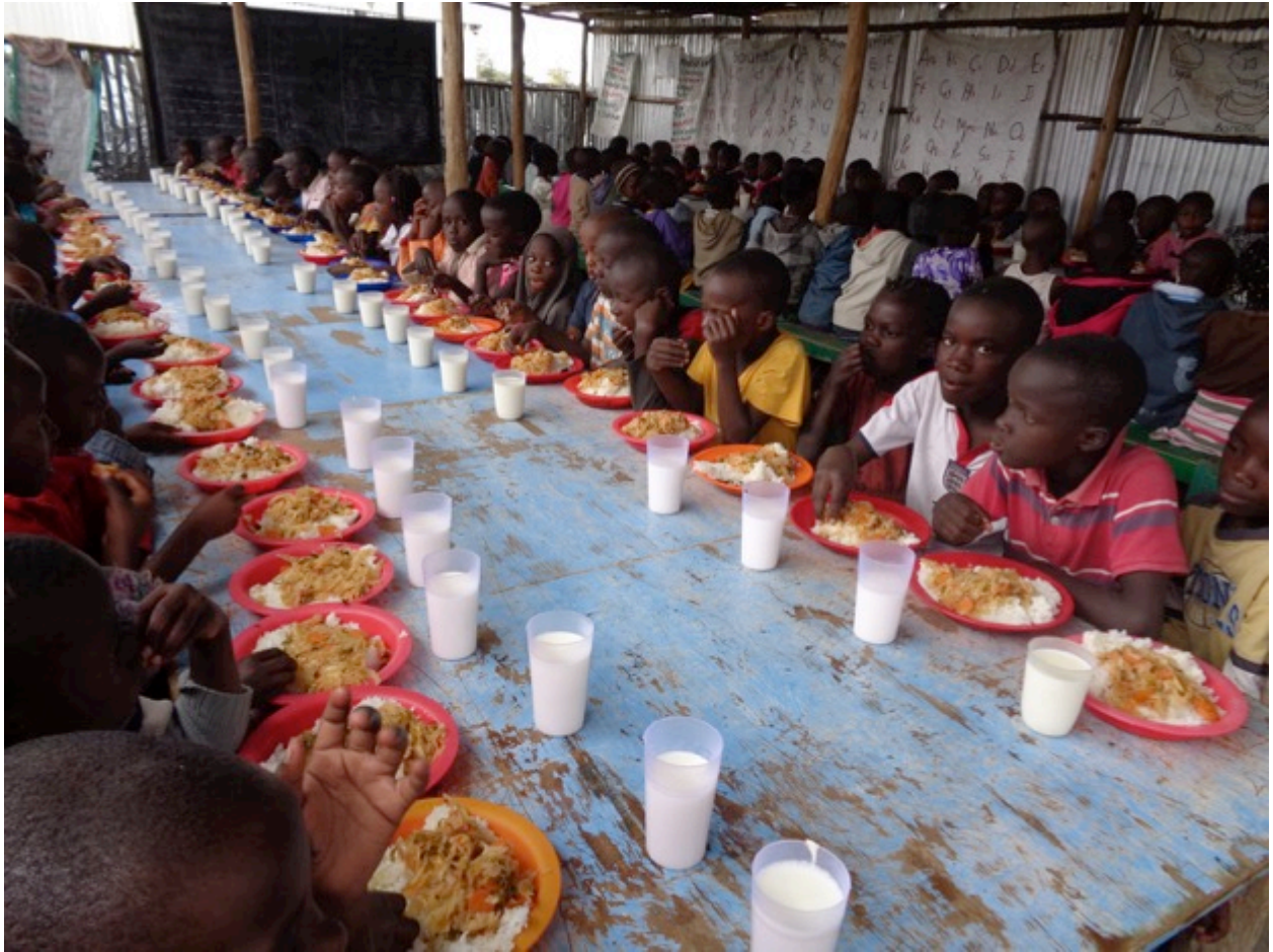
Children enjoying a nutritious meal at our center