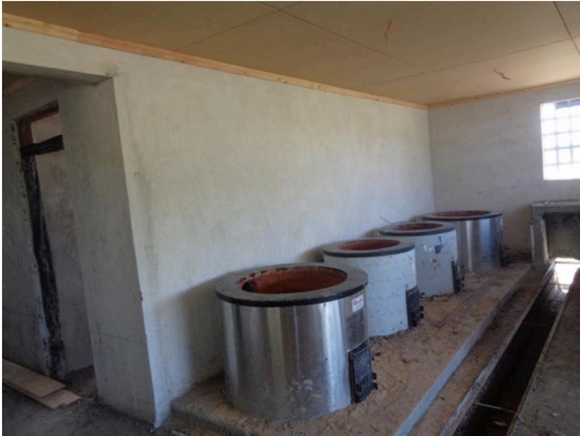
Installed cooking stoves