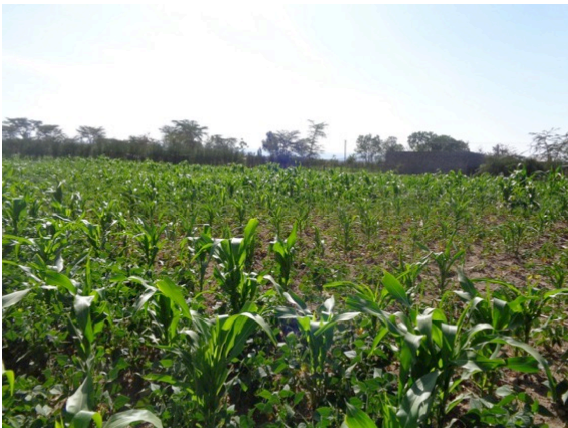
Maize and beans in our leased farm. It is not doing well.