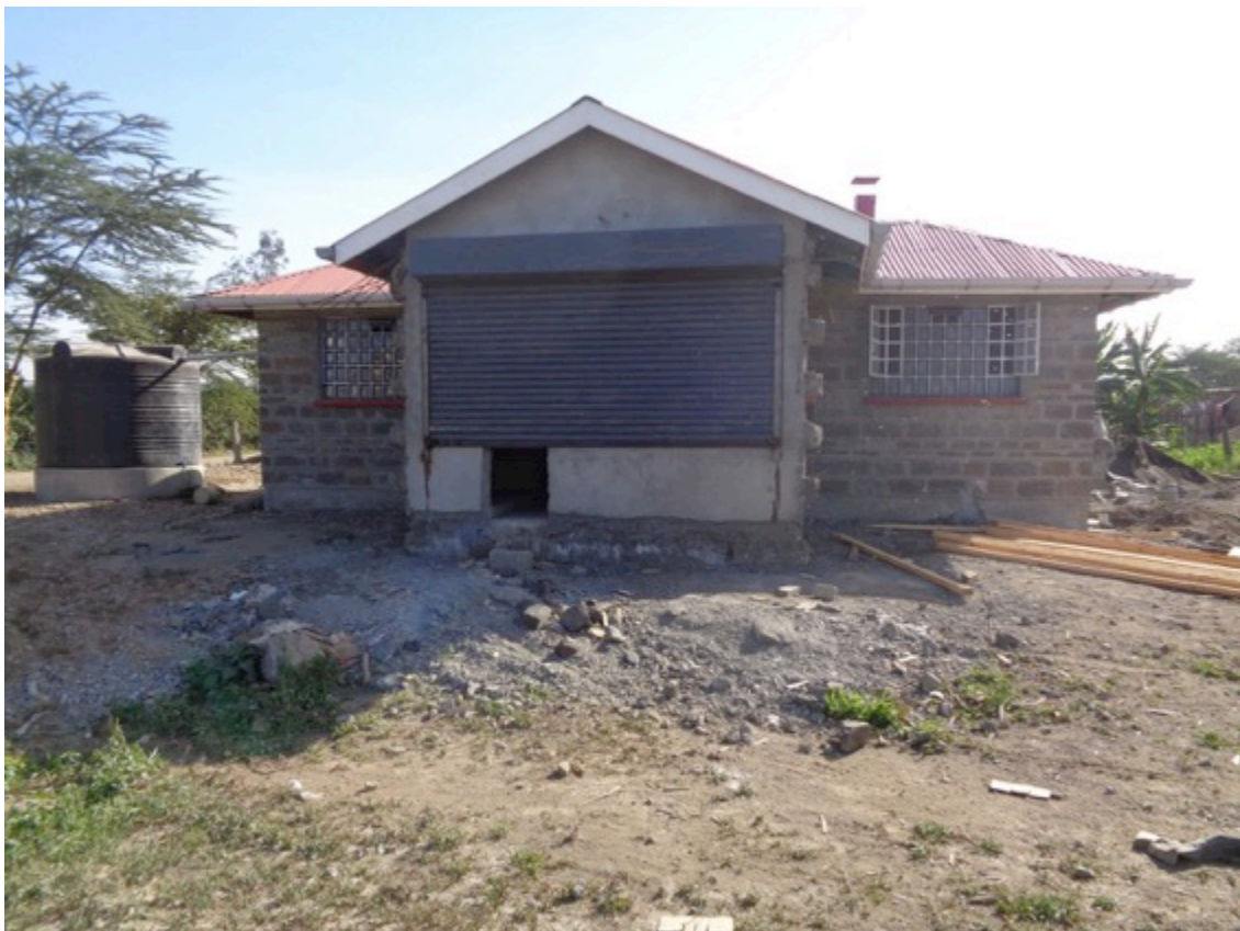
Our kitchen under construction

We started the construction of this world class kitchen a couple of months ago. Because of limited funds, its progress is a bit slow but steady. We contracted Ericom Building and Contractors Company to construct the school kitchen. They are also constructing our classrooms. They have finished the plastering, ceiling boards, floor tiles, installation of cooking stoves etc. The only major work remaining is painting and the kitchen will be ready for use. We are hoping that it will be done by August 2017.